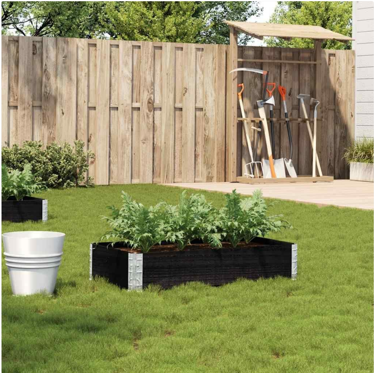
Image 1.1: The vidaXL Pine Wood Planter in an outdoor garden environment.