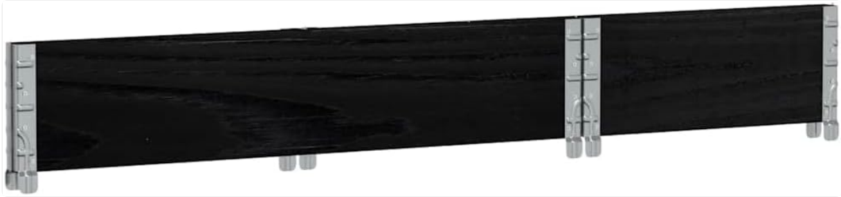
Image 3.1: A single pine wood panel with pre-attached galvanized hinges.