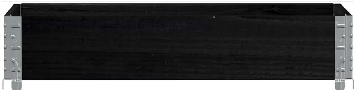
Image 6.1: The planter can be folded flat for convenient storage when not in use.