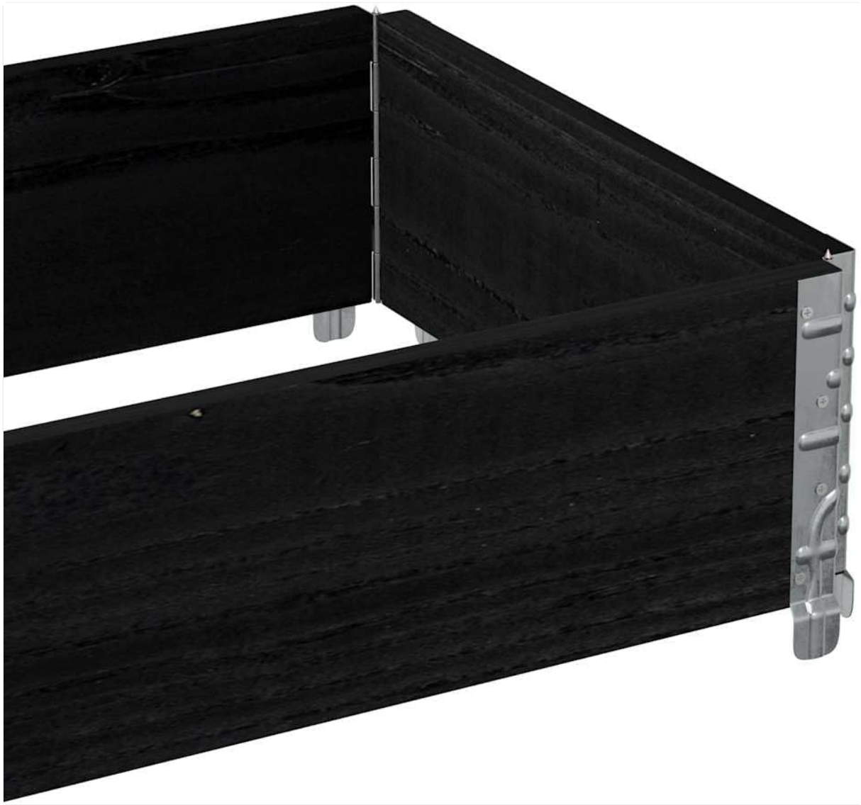
Image 4.1: Detail of the galvanized hinges at a corner, illustrating the assembly mechanism.