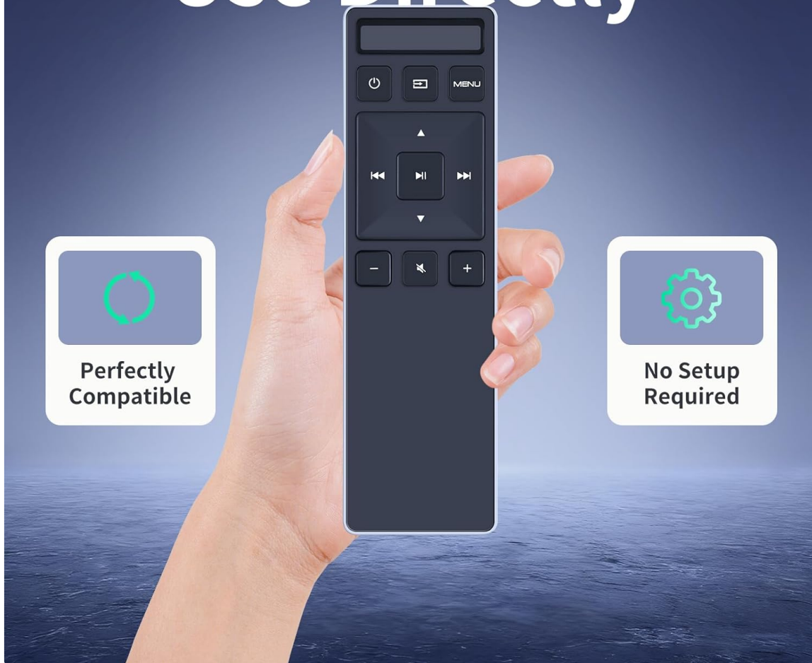
Image: A hand holding the ZWP XRS551-D remote control, with text indicating "Perfectly Compatible" and "No Setup Required," illustrating the ease of initial use.