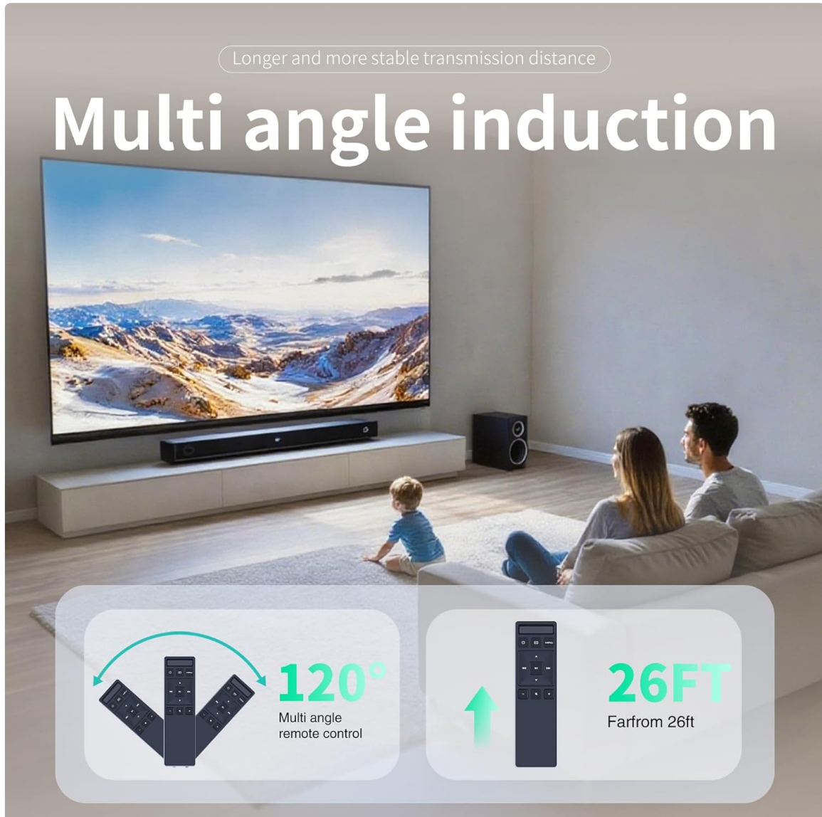
Image: An illustration demonstrating the ZWP XRS551-D remote control's operational range and angle. It shows the remote functioning effectively up to 26 feet and at angles up to 120 degrees.

The remote operates using infrared (IR) technology. Ensure a clear line of sight between the remote control and the soundbar's IR receiver for optimal performance. The maximum effective range is approximately 10 meters (26 feet). It supports multi-angle induction up to 120 degrees, allowing for flexible positioning.