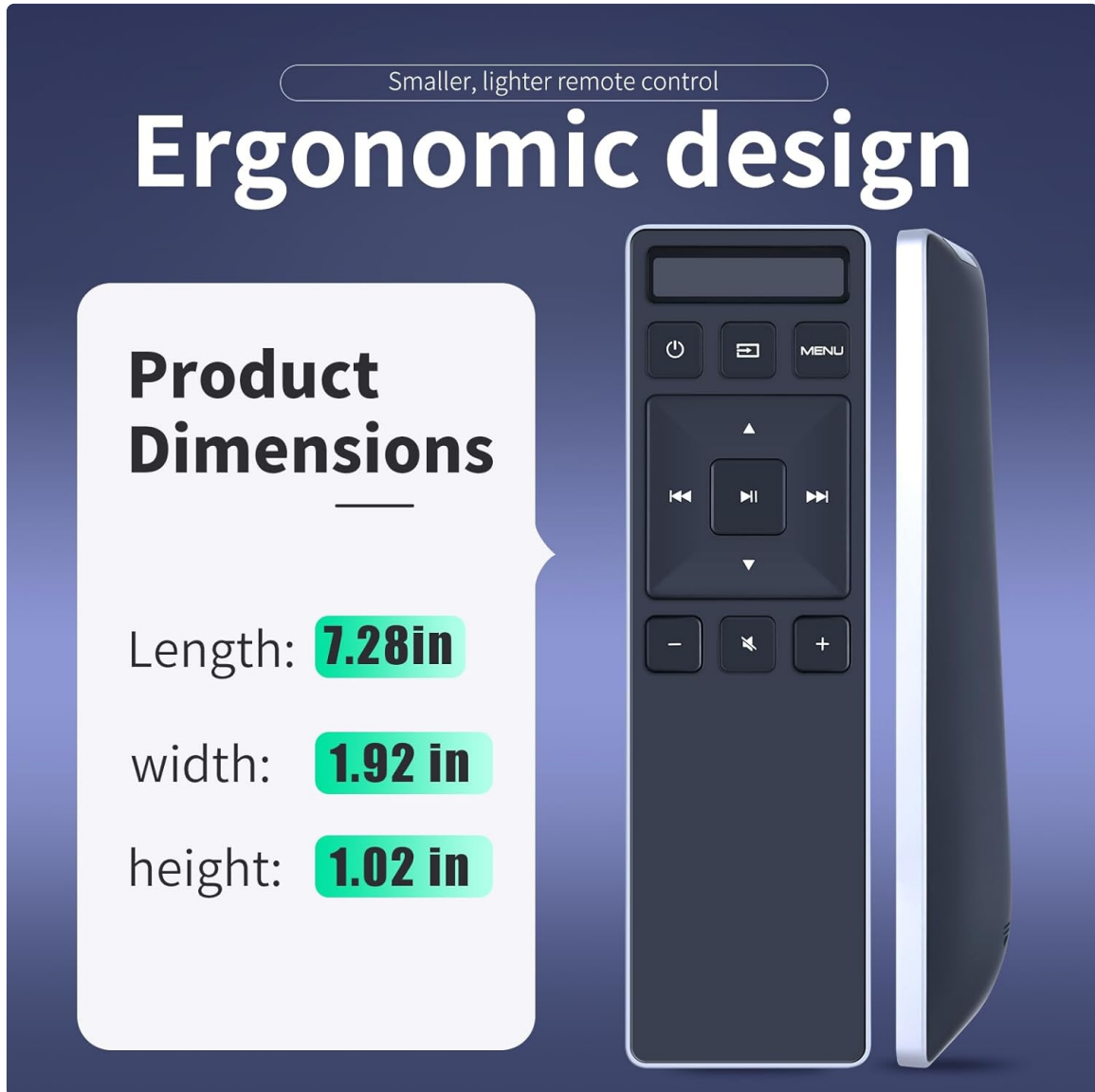
Image: A visual representation of the ZWP XRS551-D remote control highlighting its ergonomic design and precise dimensions: Length 7.28 inches, Width 1.92 inches, and Height 1.02 inches.