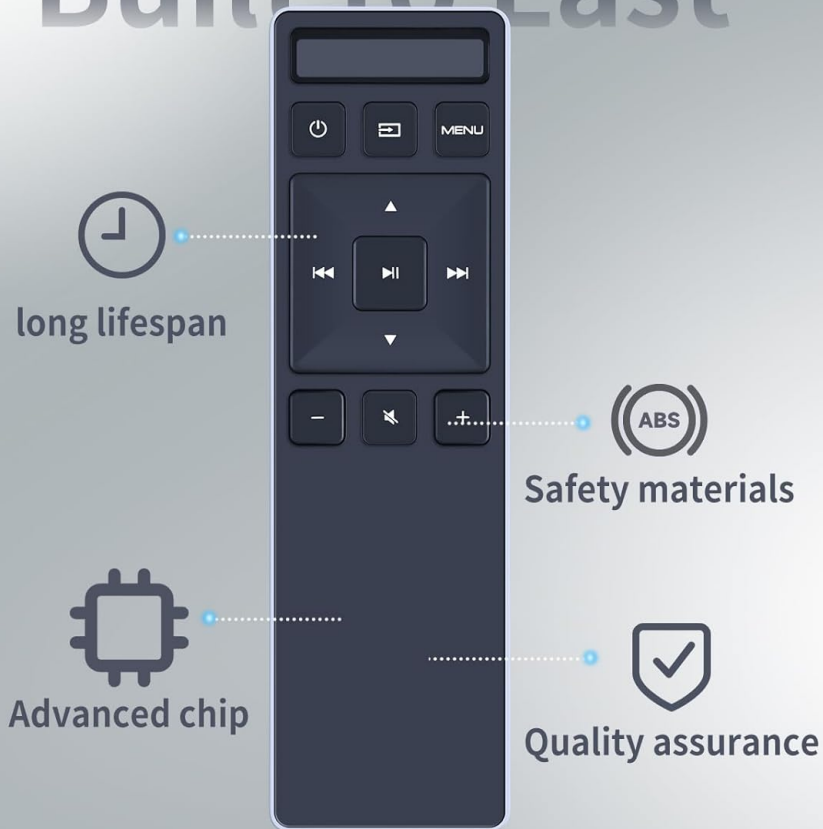
Image: Front view of the ZWP XRS551-D replacement remote control, showcasing its button layout.