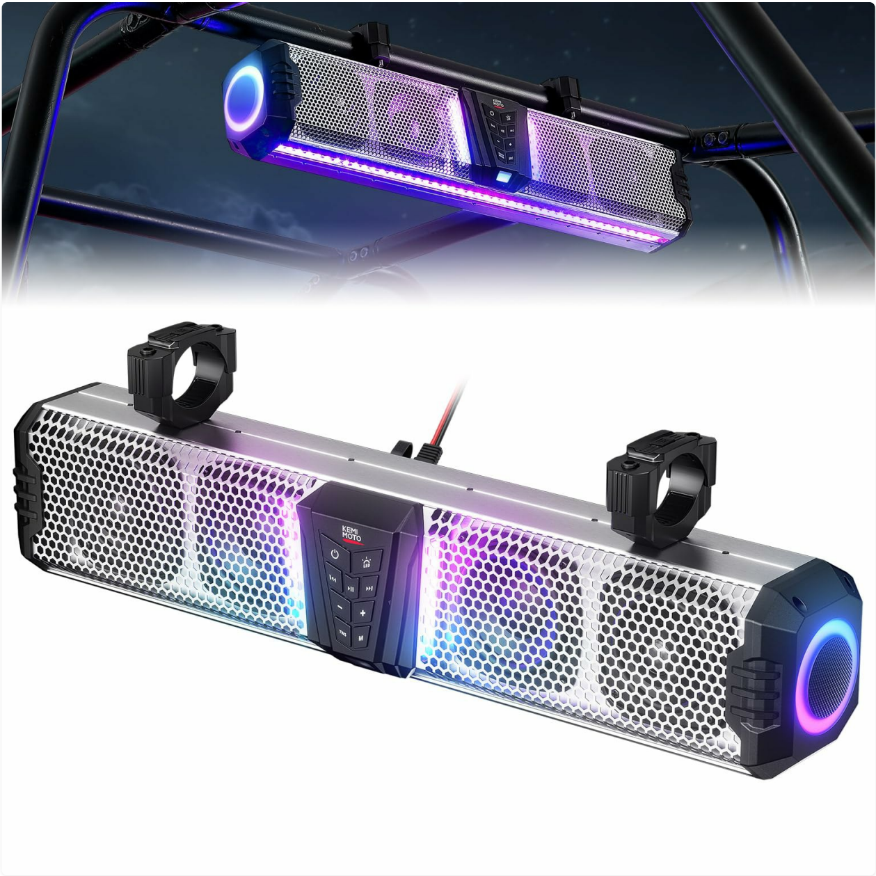
Figure 1: KEMIMOTO Midnight S60 UTV Sound Bar