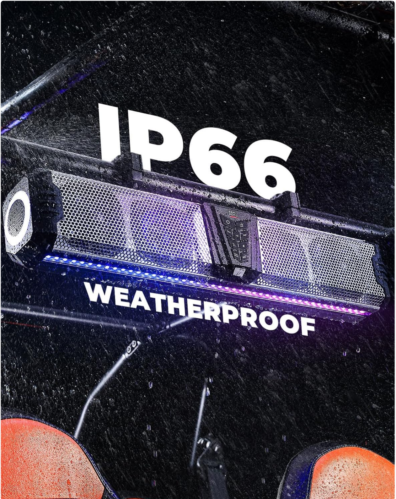
Figure 2: Metal-Built Construction for Enhanced Durability

The KEMIMOTO Midnight S60 features a robust metal structure, providing superior impact resistance and efficient heat dissipation. This design minimizes resonance, ensuring optimal sound performance even in challenging environments.