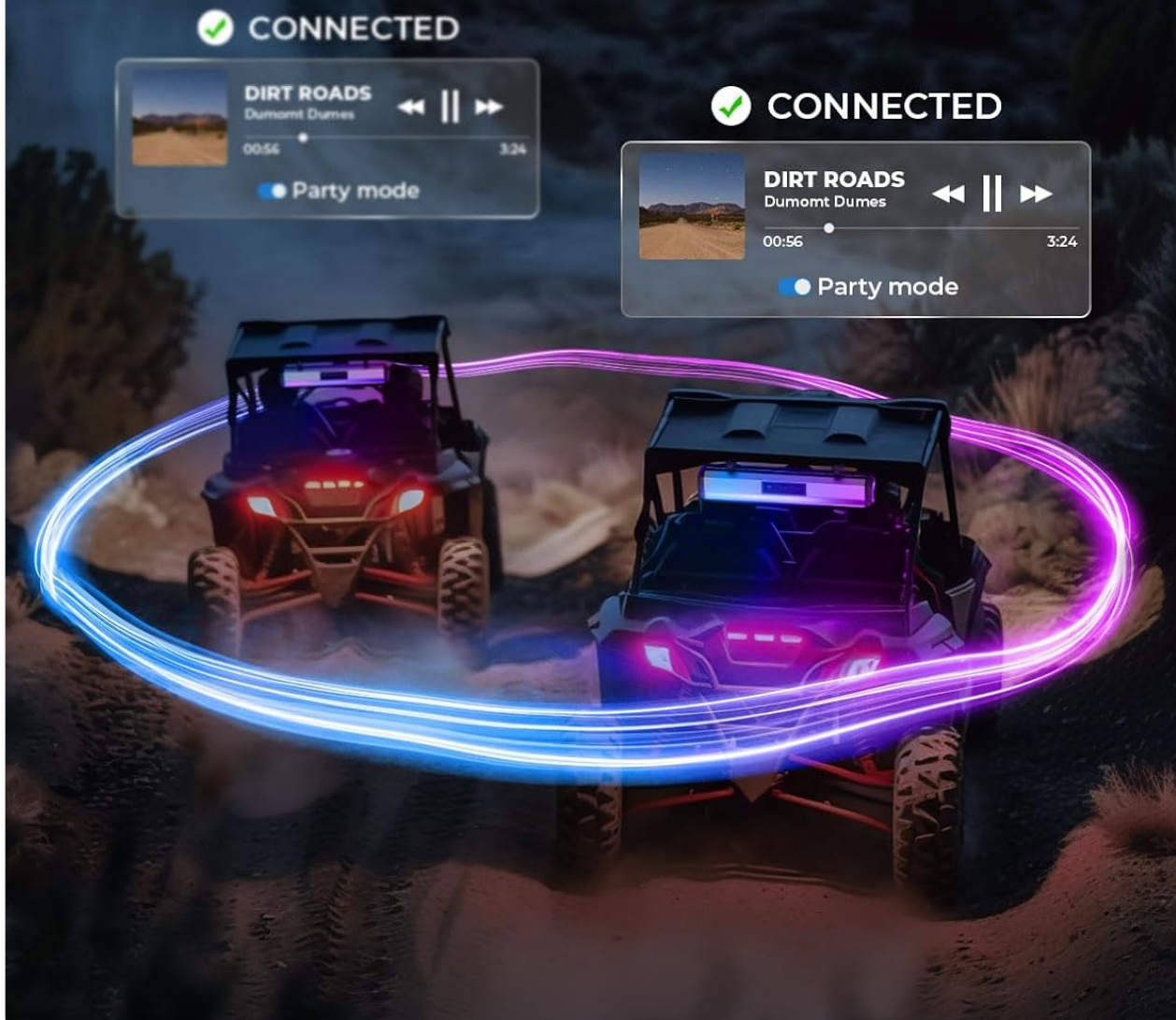
Figure 7: Stereo Pairing in Party Mode

Connect 2 KEMIMOTO Midnight speakers for stereo sound