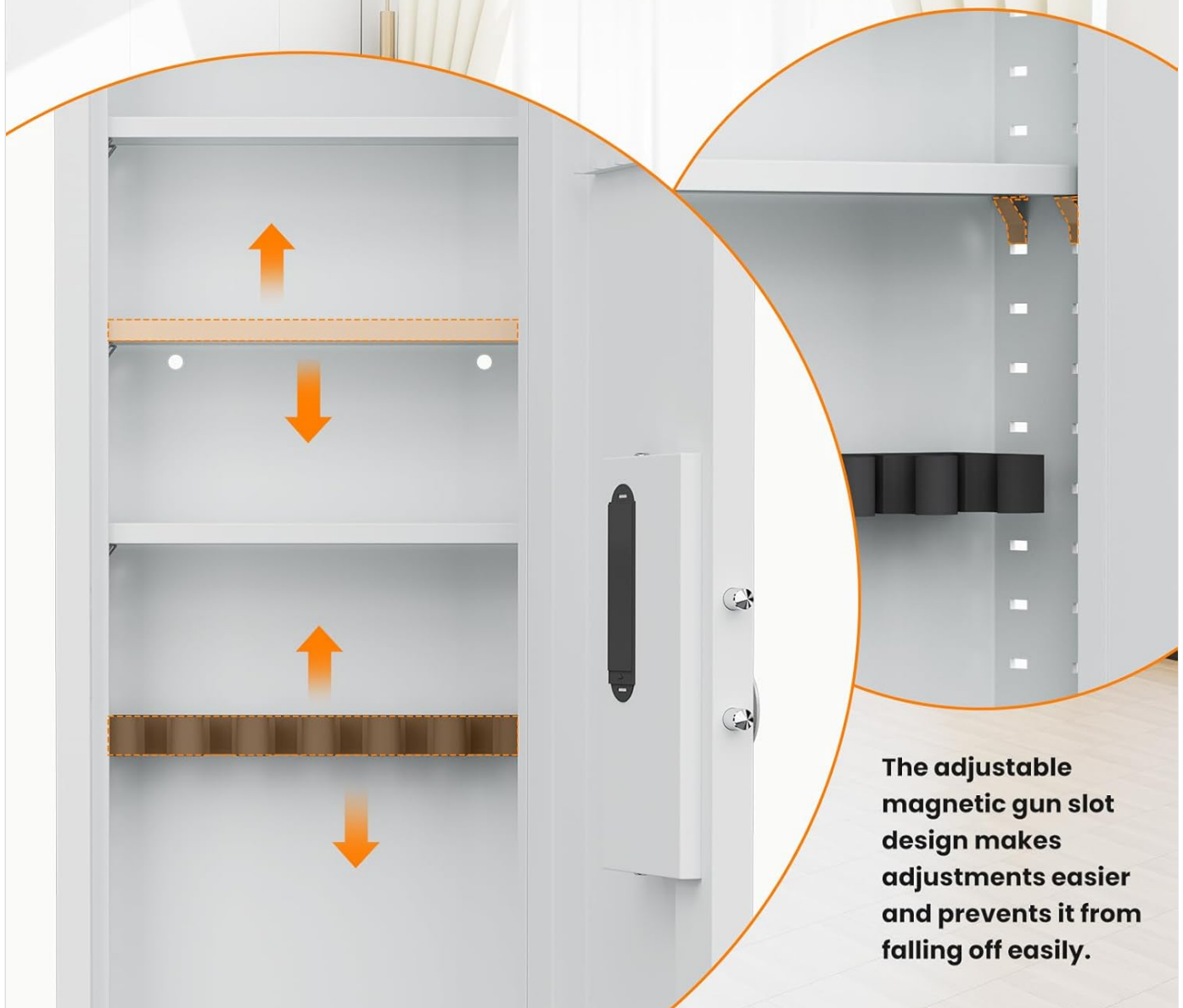
Figure 4: Customizable Storage with Adjustable Shelves and Gun Slot.