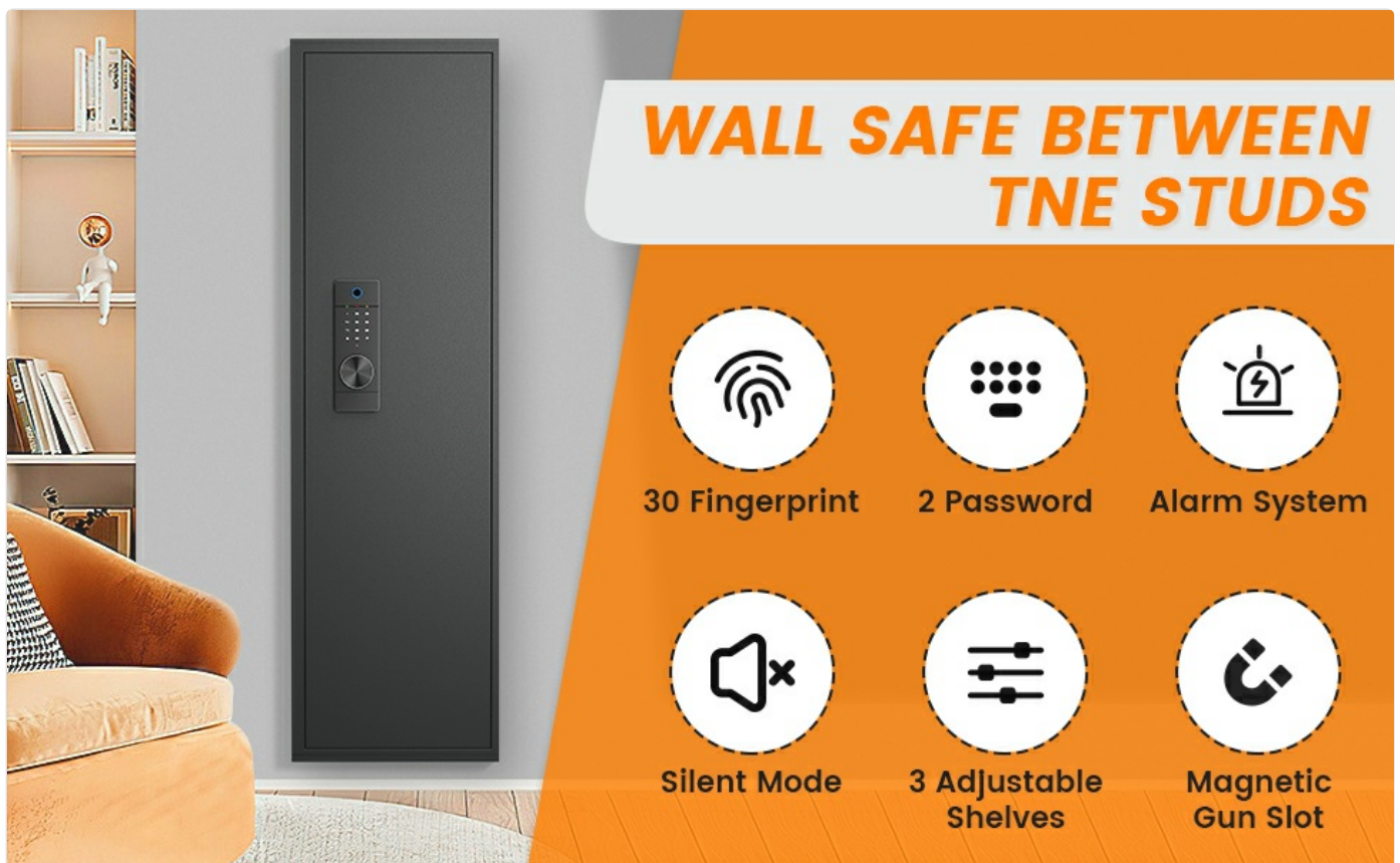
Figure 1: Included Components of the Omethey Wall Safe.