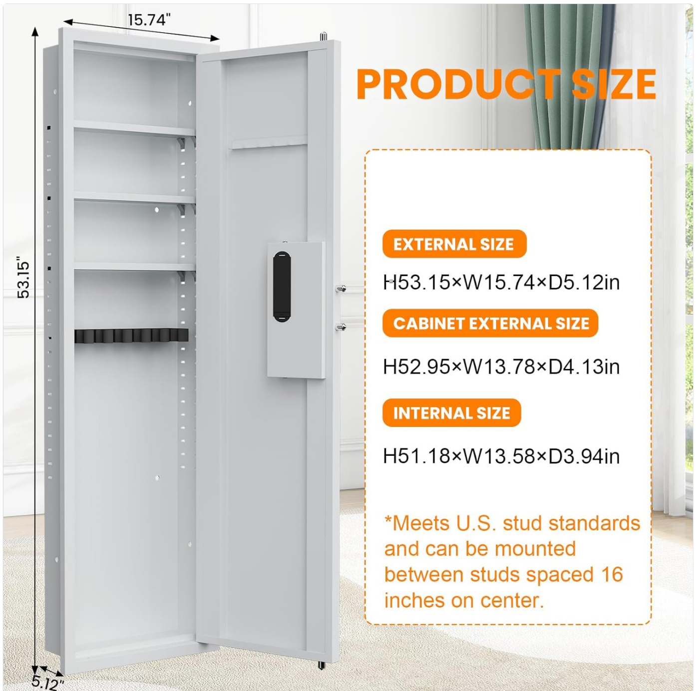
Figure 6: Product Dimensions and Stud Compatibility.

Note: The video above (Video 1) shows the mounting holes from 2:35 to 2:41.