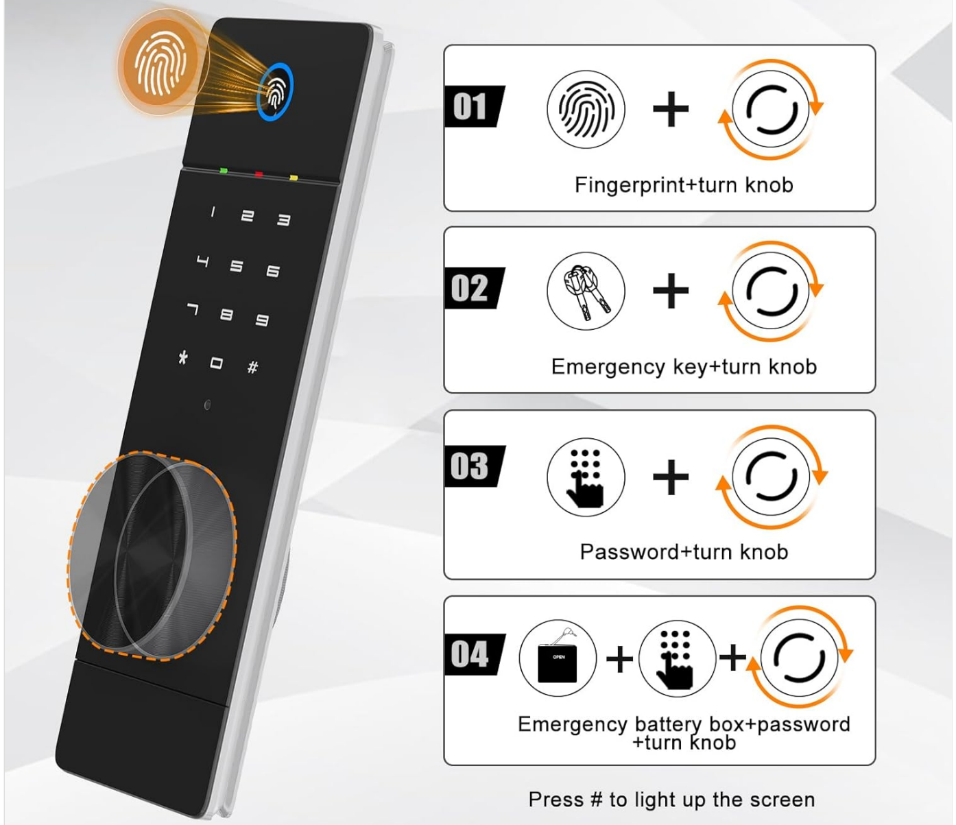
Figure 2: Four Unlocking Methods.