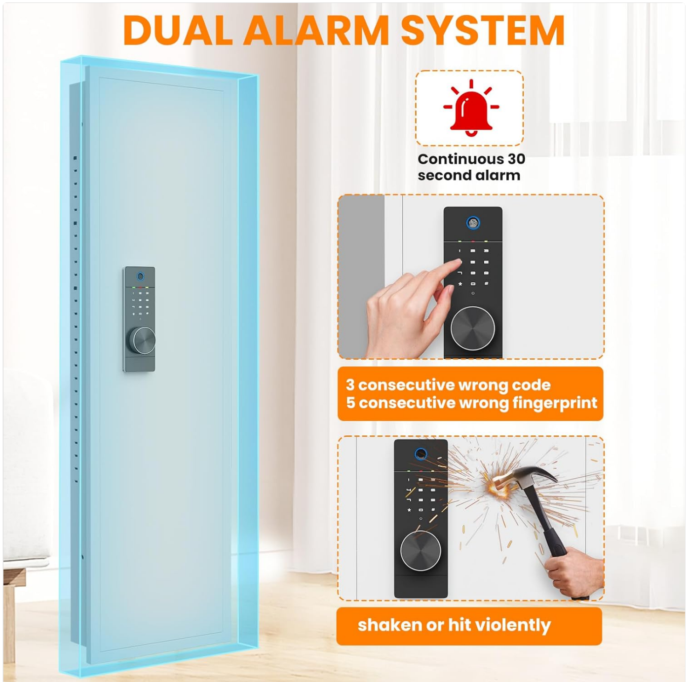
Figure 3: Dual Alarm System Triggers.