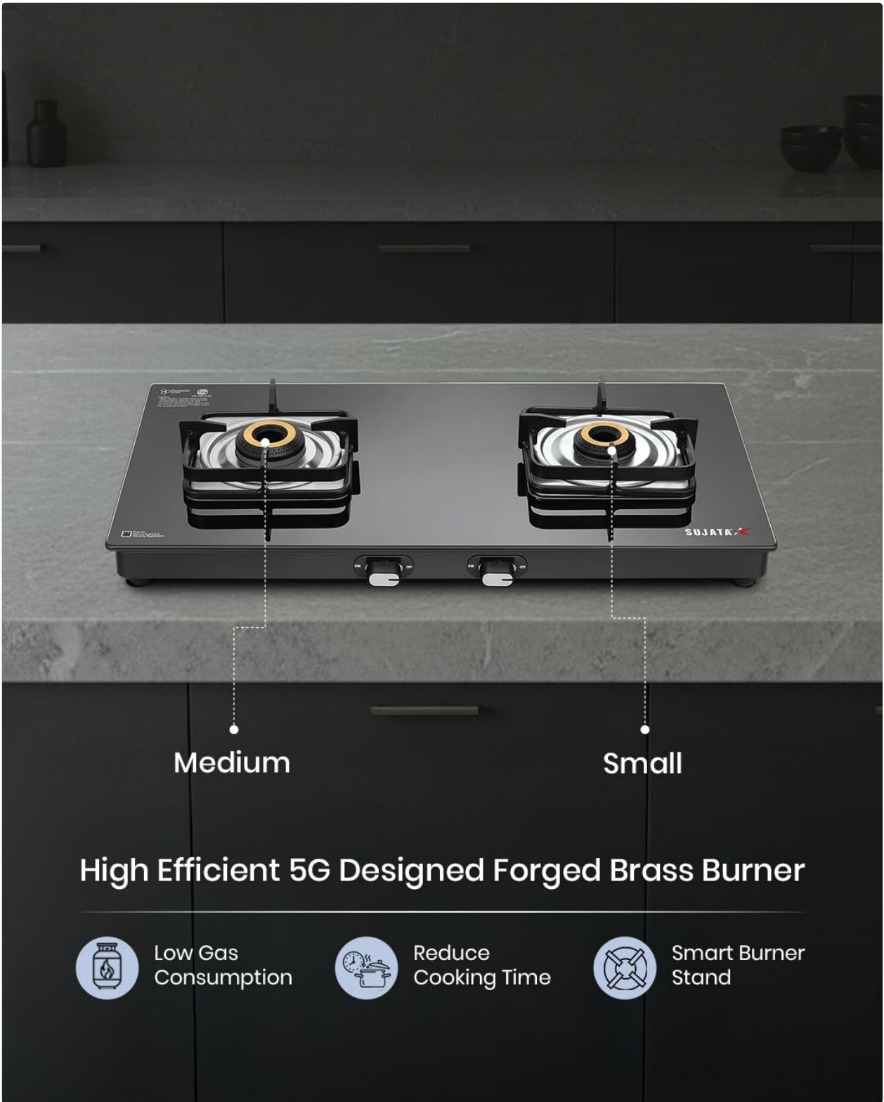
Image: Illustration showing the two burner sizes, one medium and one small, on the Sujata Classic Gas Stove.