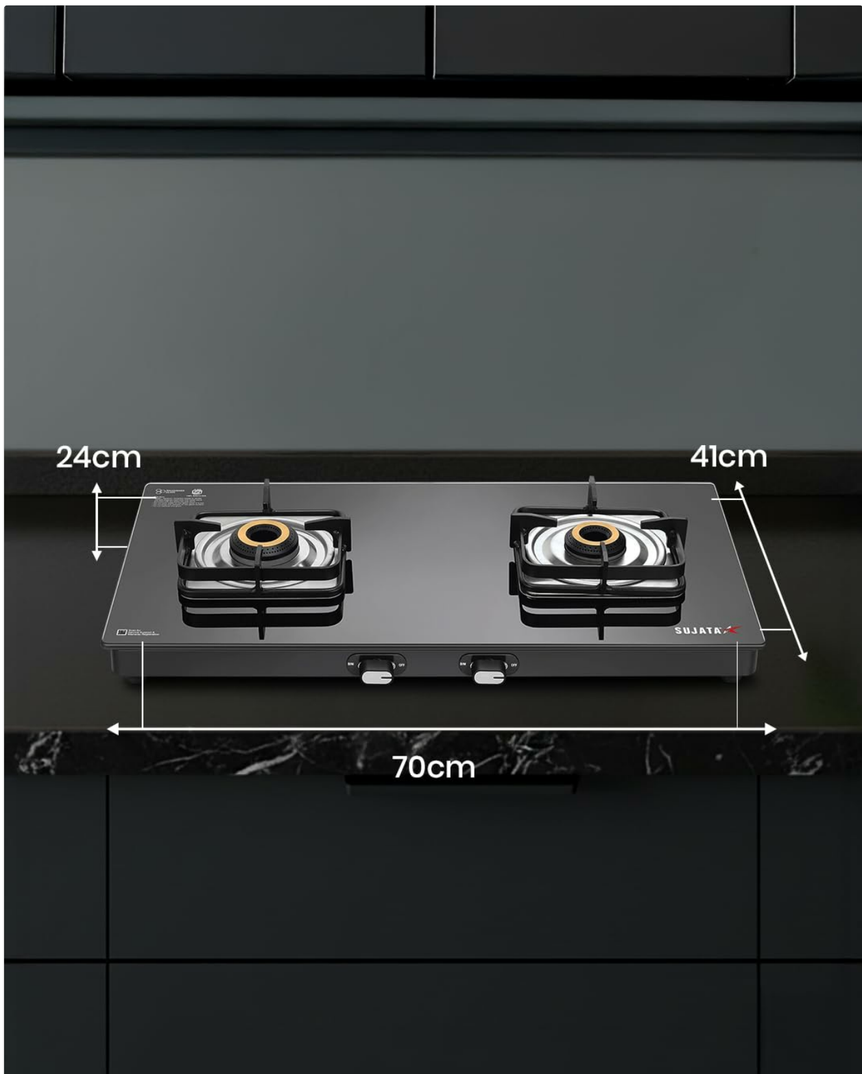
Image: Sujata Classic Gas Stove displaying its overall dimensions for installation planning.