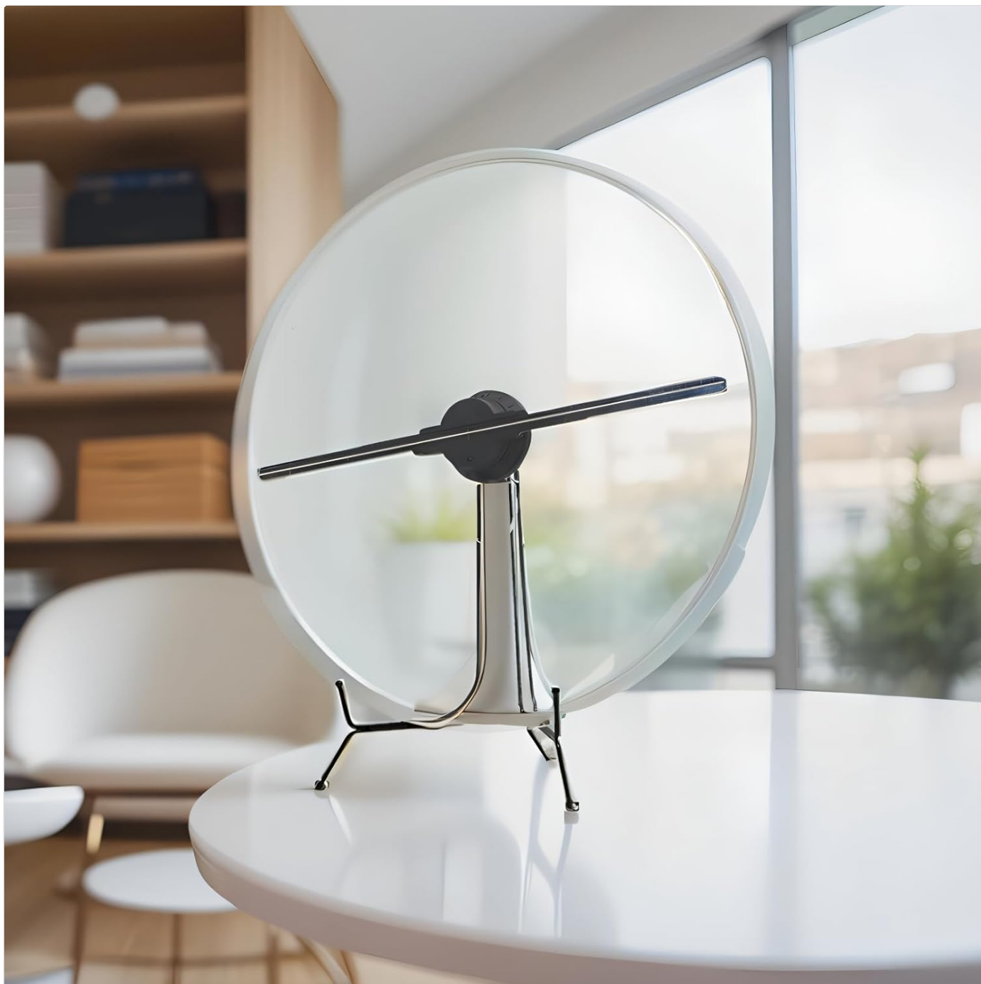
Figure 1: Missyou 3D Hologram Fan with protective cover.