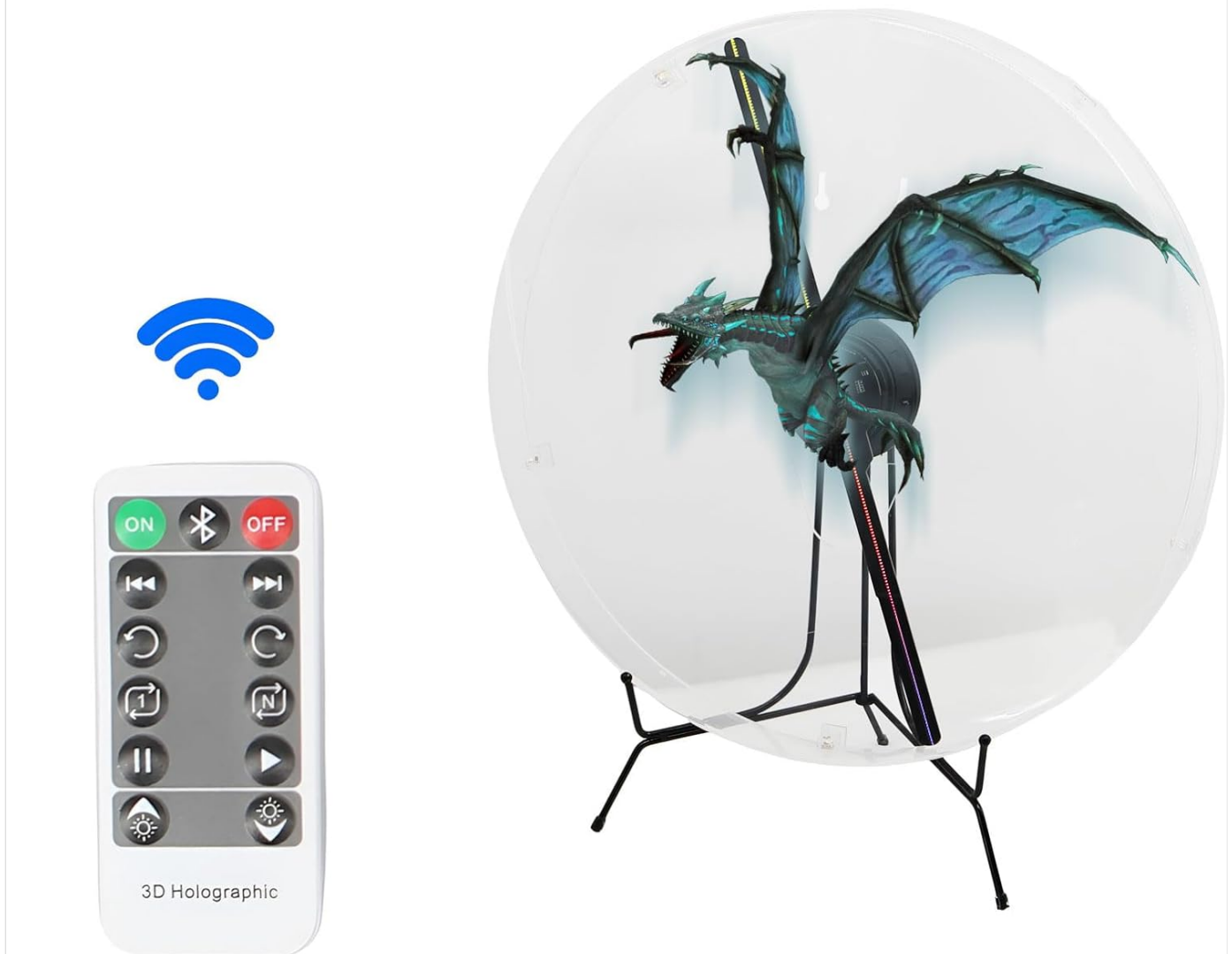
Figure 6: Remote control functions.

The operation is simple and saves time and effort