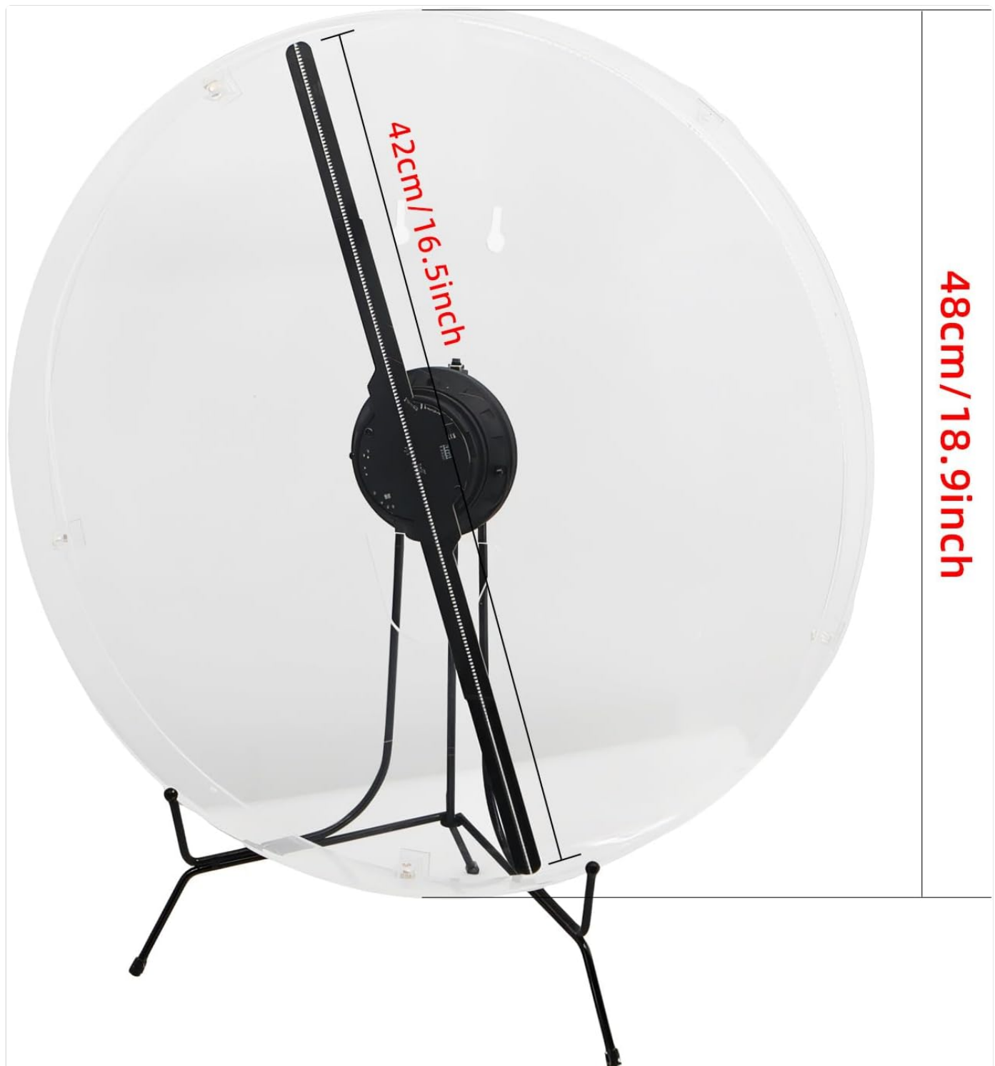
Figure 7: Product dimensions.