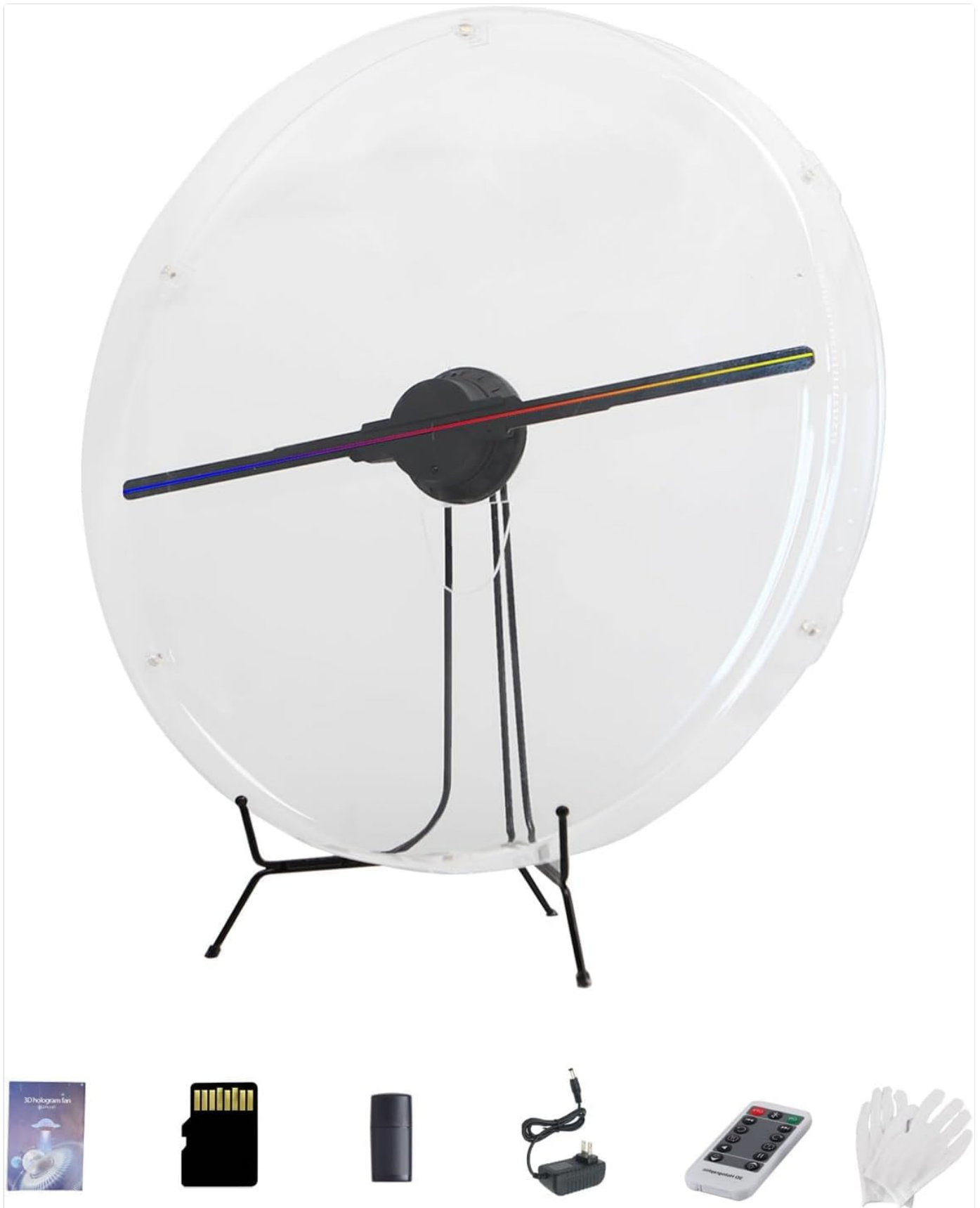
Figure 2: Included accessories with the 3D Hologram Fan.