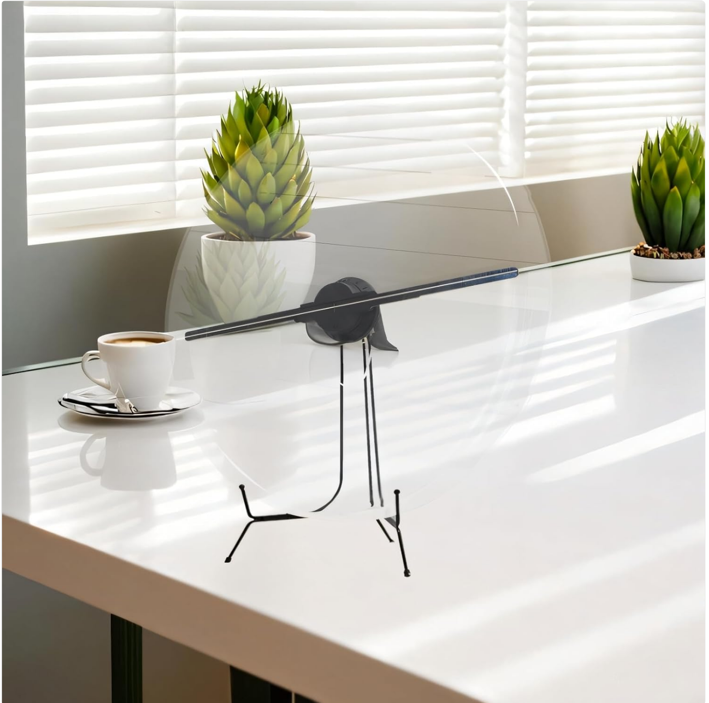
Figure 3: Tabletop placement of the 3D Hologram Fan.