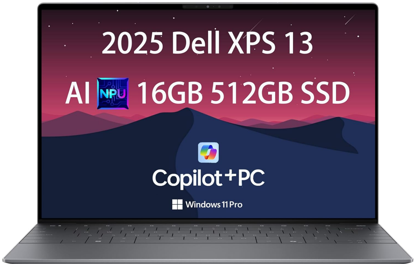
Figure 1: The 2025 Dell XPS 13 Laptop, showcasing its sleek design and key features like Copilot+ AI and Windows 11 Pro.

This manual provides essential information for setting up, operating, maintaining, and troubleshooting your new 2025 Dell XPS 13 9345 Laptop. This device is a cutting-edge Copilot+ AI PC, designed for high responsiveness, speed, and efficiency, featuring a Snapdragon X Plus processor and a long-lasting battery.