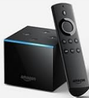
Amazon Fire TV Cube