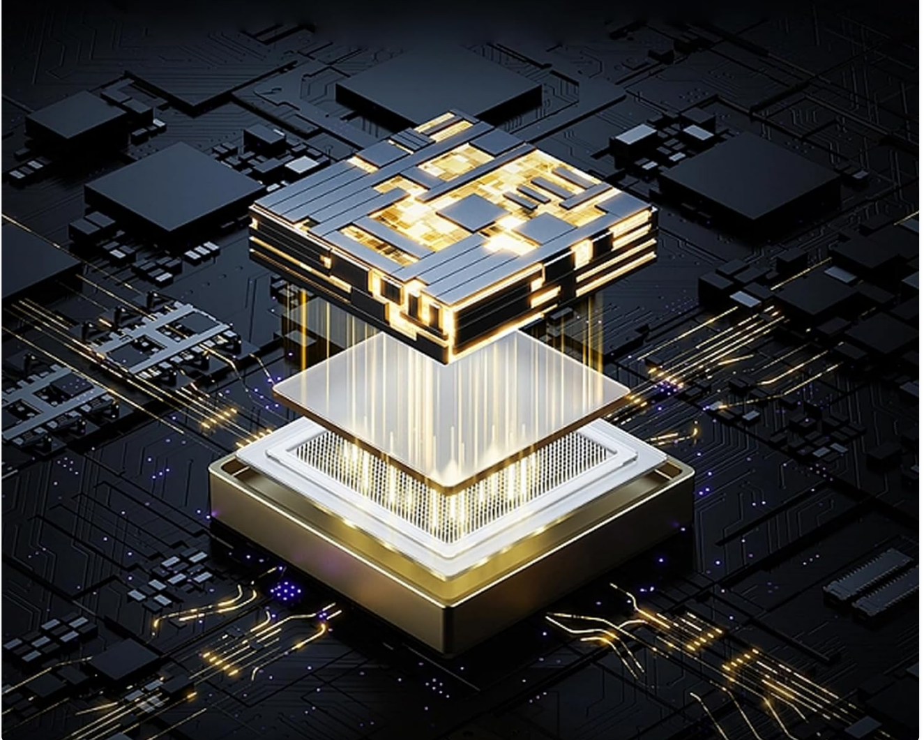
Image: Illustration of the advanced chipset ensuring stable video capture transmission.

Ensure stable video capture transmission