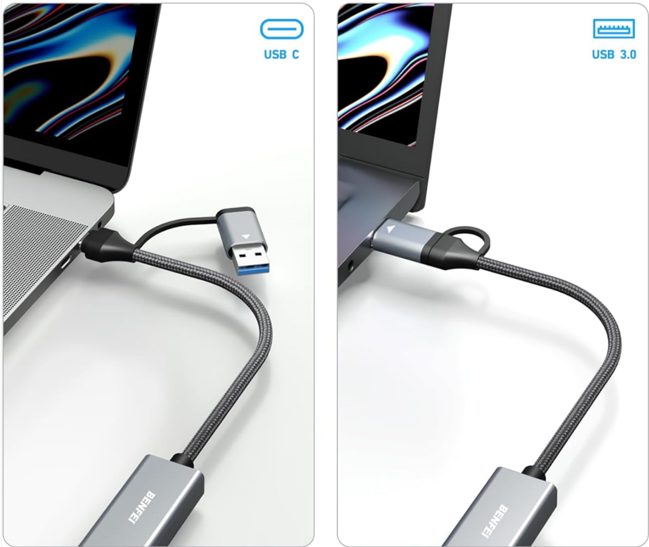
Image: The capture card's dual USB-A and USB-C connector for flexible connectivity.