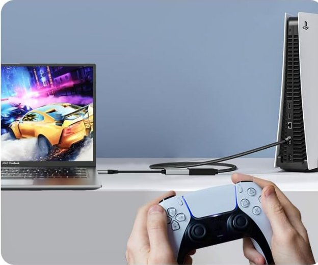
Game Video Recording