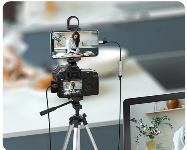
Turn Phone into Portable Monitor

Image: BENFEI Video/Audio Capture Card showing its compact design and dual USB connectivity.