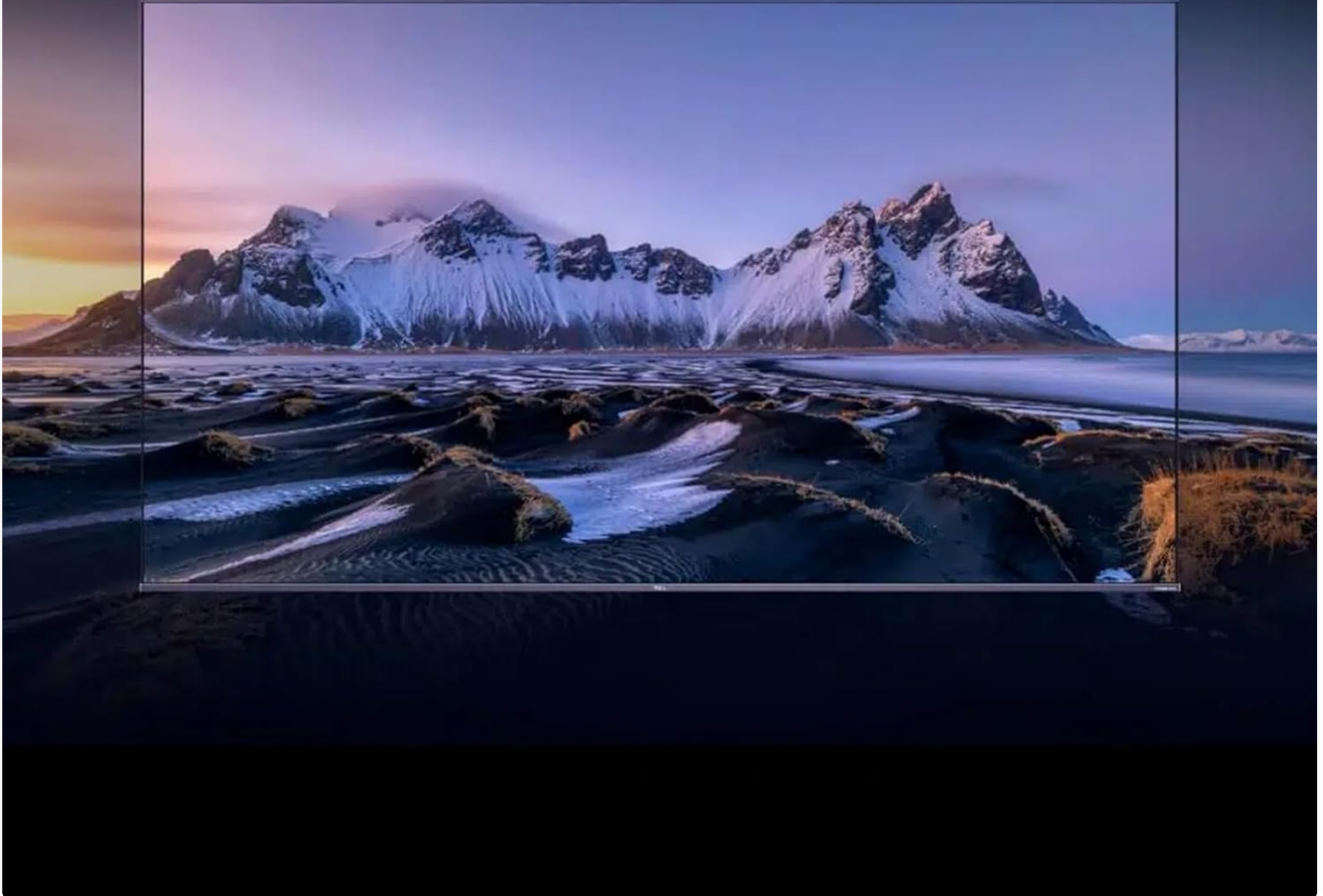
Image: Visual representation of 1080P Full HD output from a 4K@60Hz input.