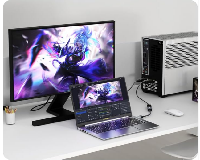
Live Game Steaming