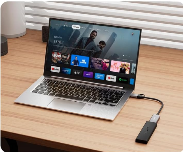
Capture Content from TV Stick to Laptop