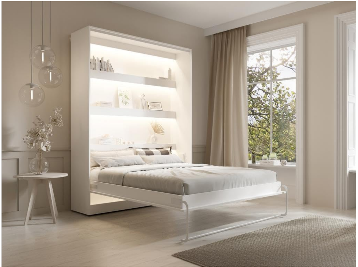
Image: The RAPILI wall bed fully open, showcasing the bed ready for use and the integrated LED-lit shelving.