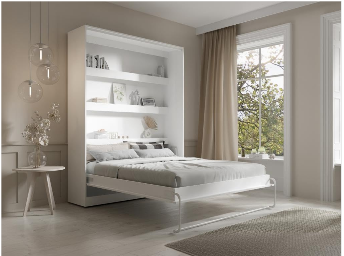
Image: The RAPILI wall bed in an open position, illustrating the bed frame and shelving.