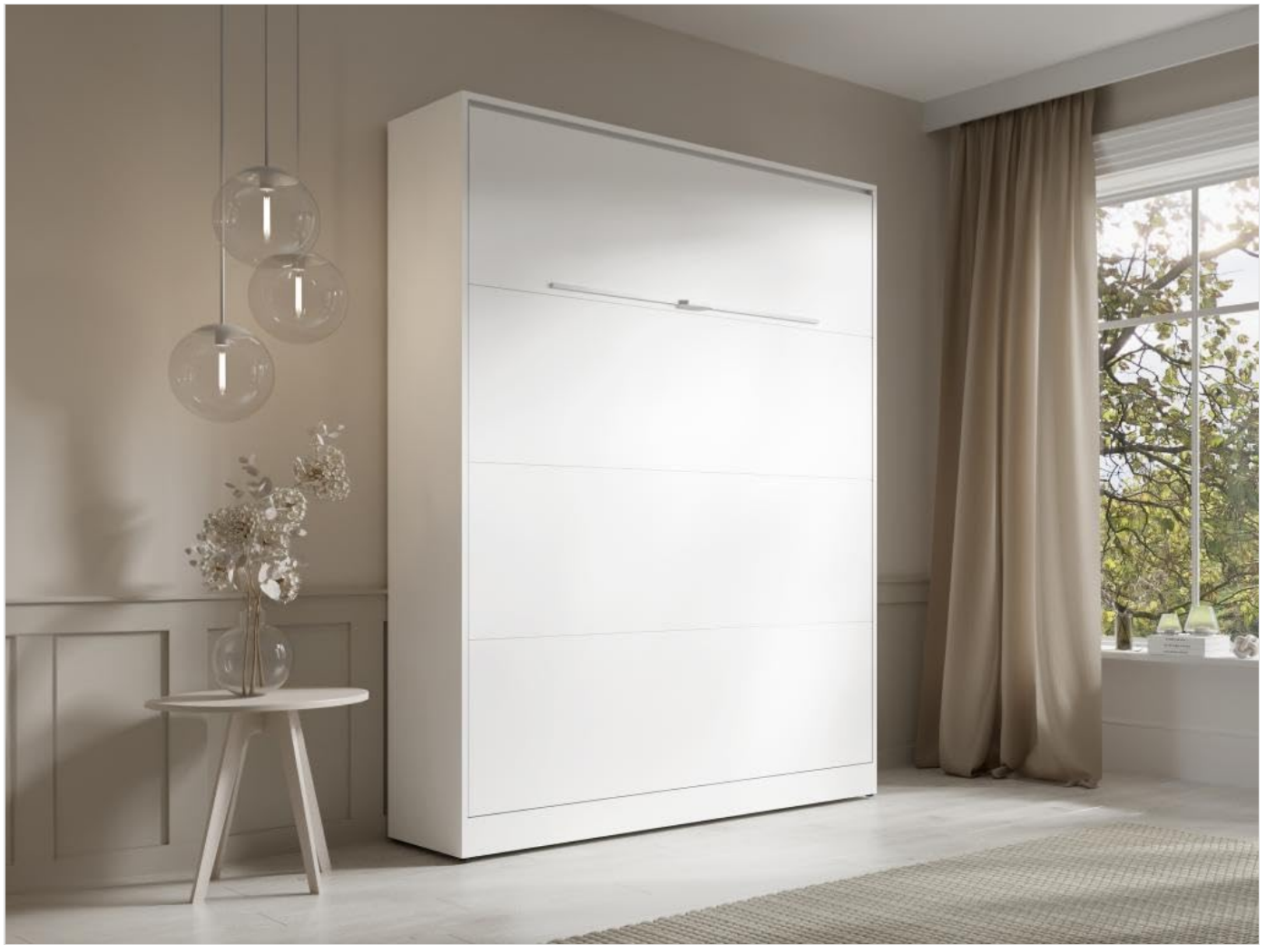
Image: The RAPILI wall bed in its fully closed state, appearing as a compact cabinet.