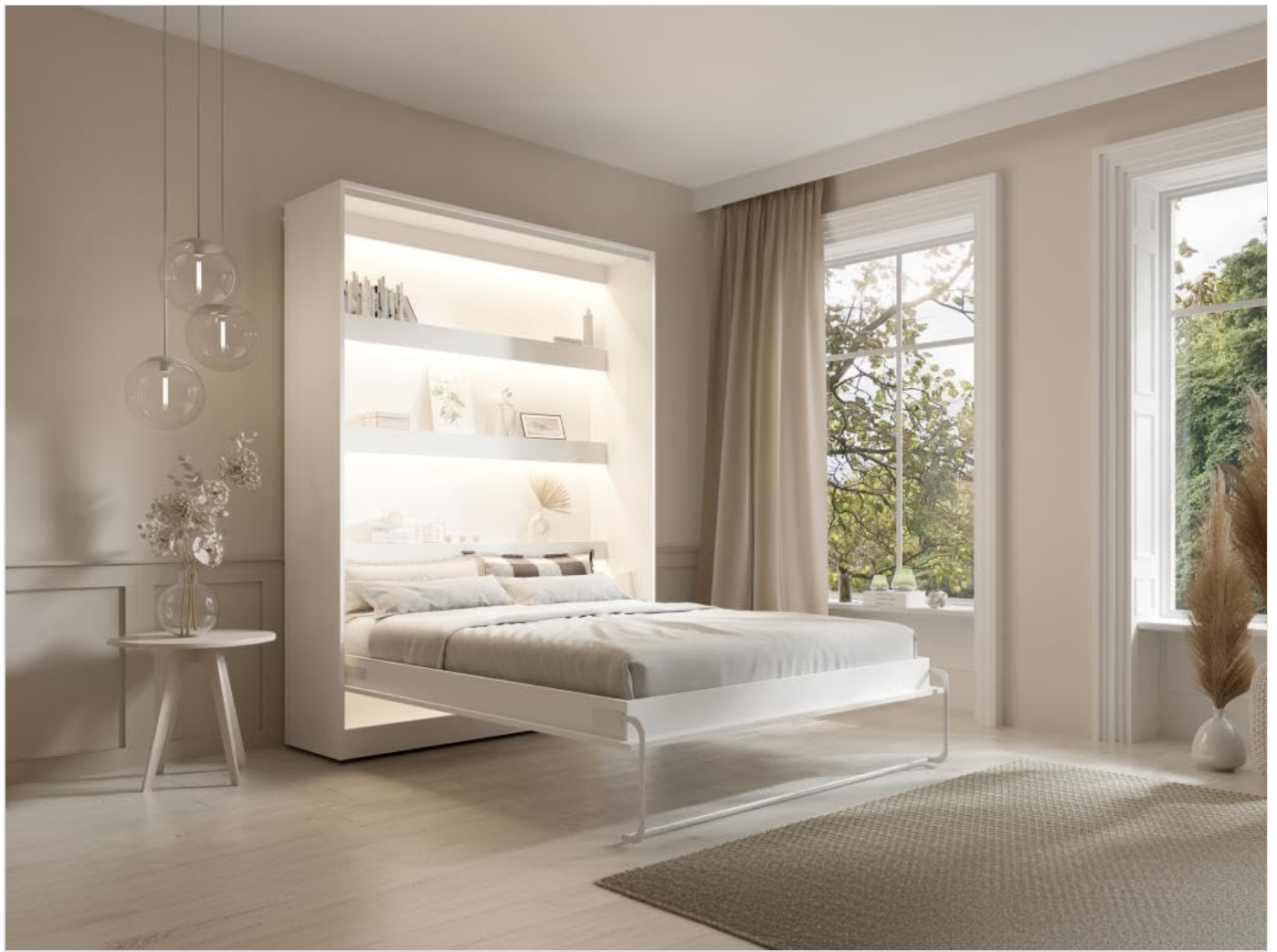
Image: The RAPILI wall bed in its closed, cabinet configuration, blending seamlessly into the room.