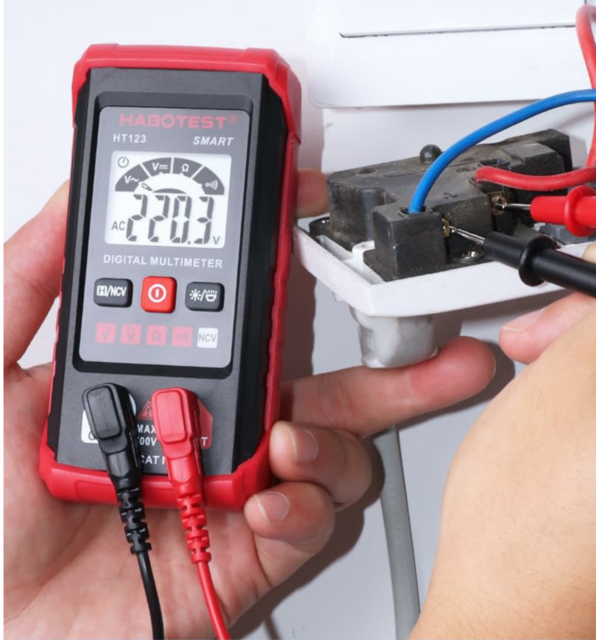
Figure 4: The multimeter in automatic identification mode, ready for various measurements.

Home voltage range: 198V~240V is the normal value, when the measured value is 220V, its measurement is accurate