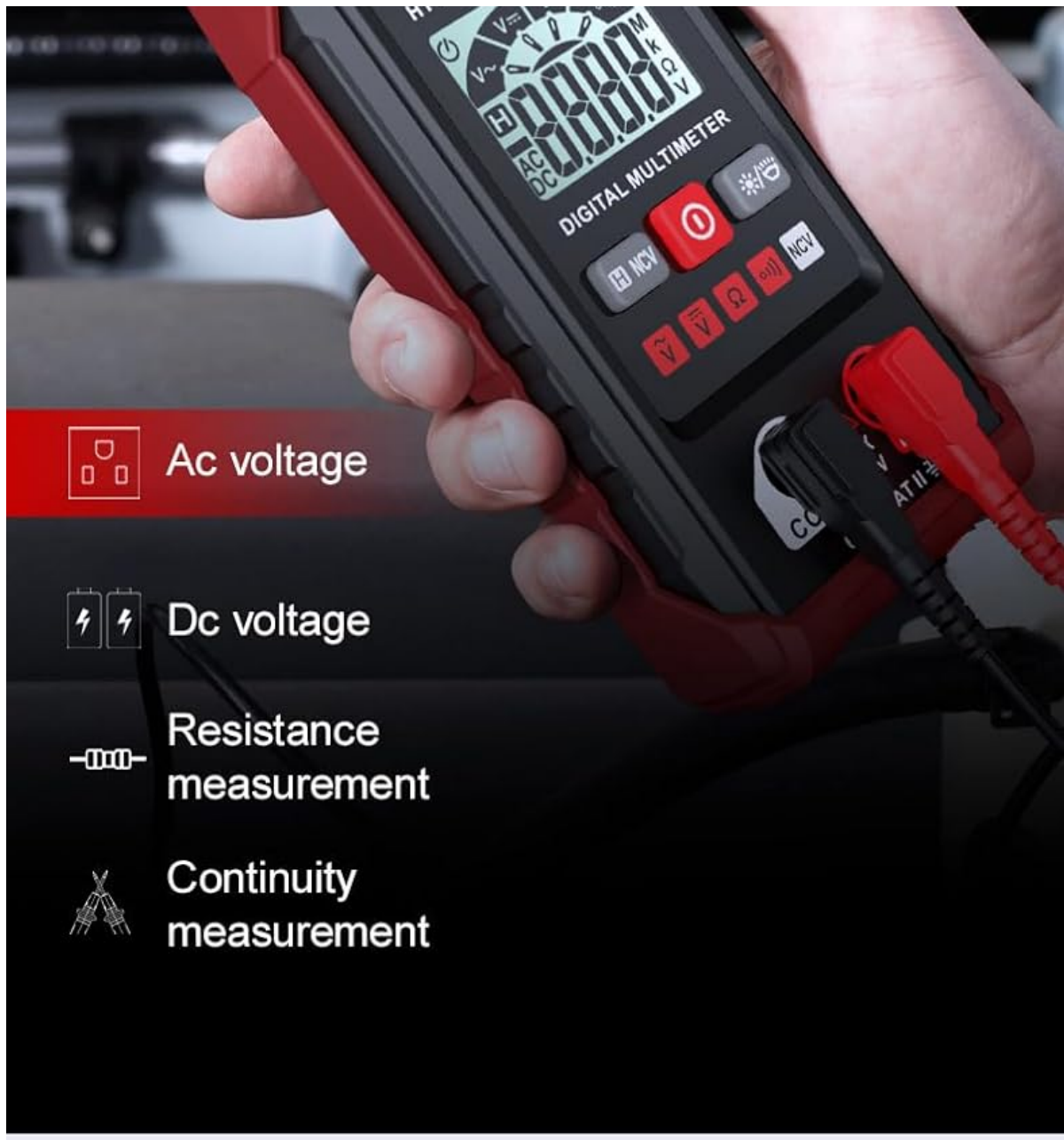
Figure 2: Front view of the HT123 Digital Multimeter, highlighting the display, function buttons, and input jacks.

The multimeter features a clear LCD display, function buttons for NCV, power, backlight, and mode selection, and input jacks for test leads.