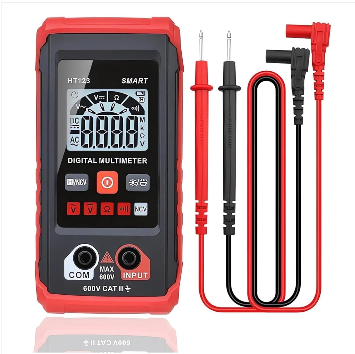
Figure 8: The multimeter's LCD display with backlight activated, enhancing readability in low-light conditions.