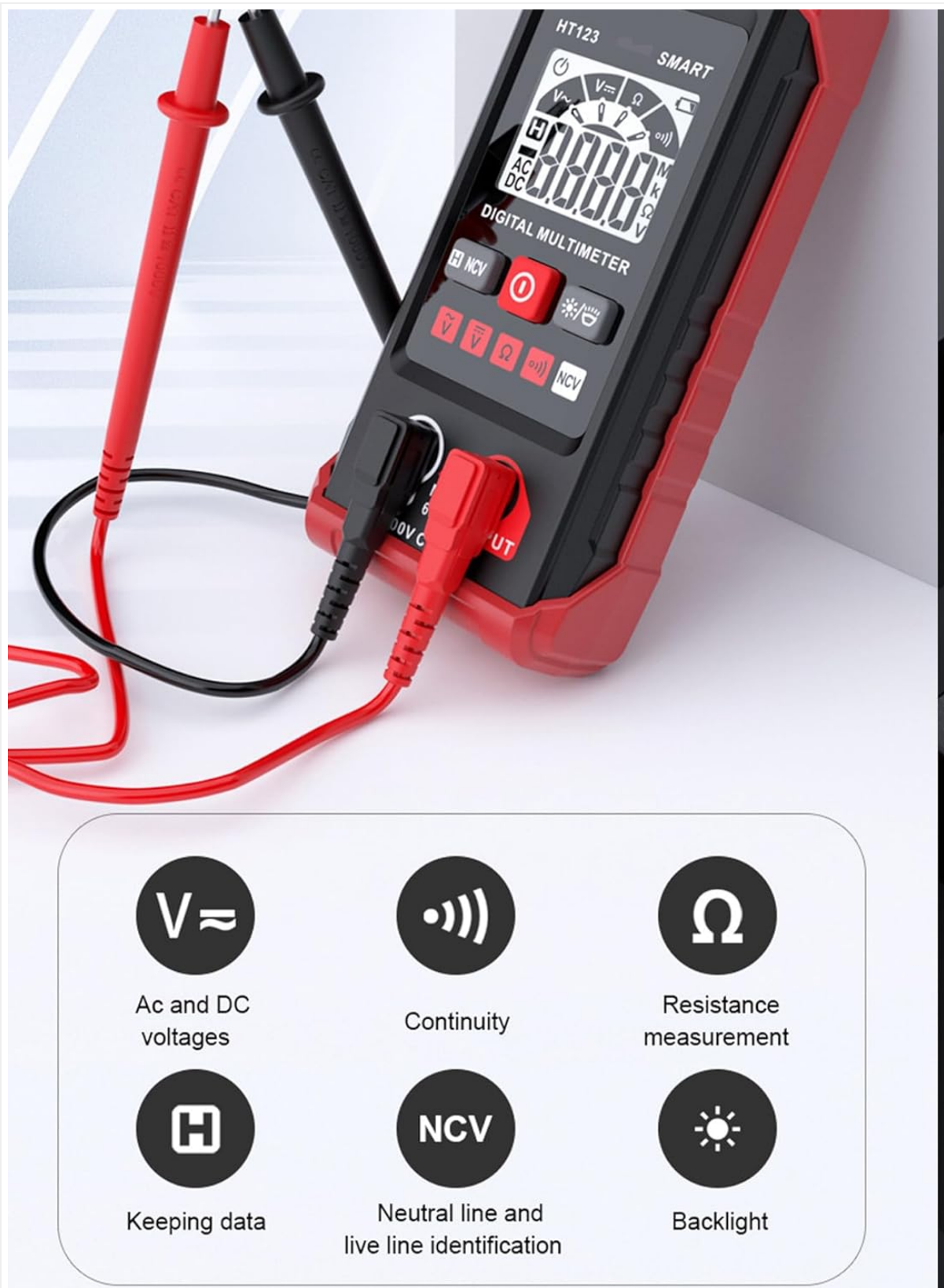
Figure 3: Visual representation of the multimeter's core functions, including AC and DC voltages, continuity, resistance, data hold, non-contact voltage detection, and backlight.