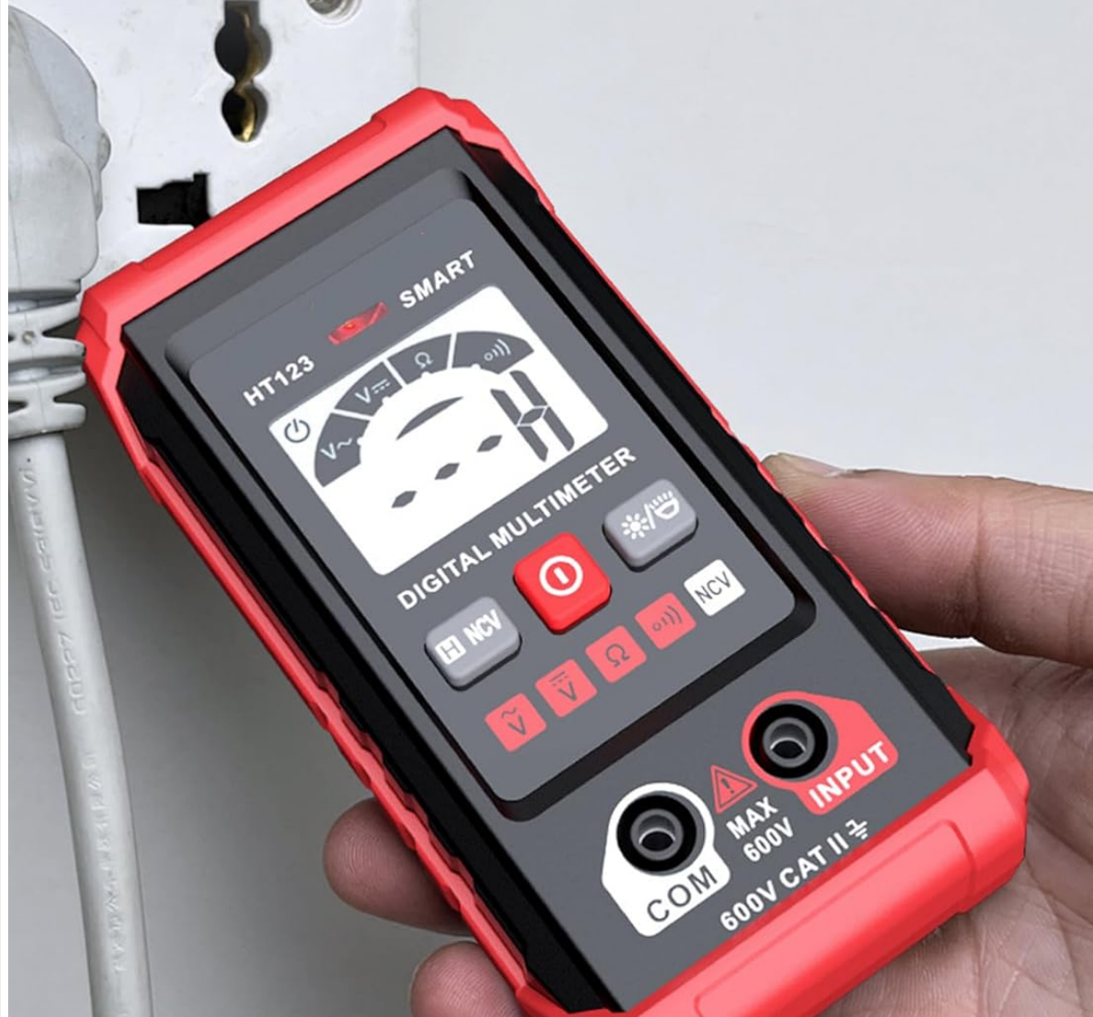
Figure 6: Measuring AC voltage from a wall outlet. The display shows an AC voltage reading.

When the NCV probe is near the AC power supply, it will sound and light alarm