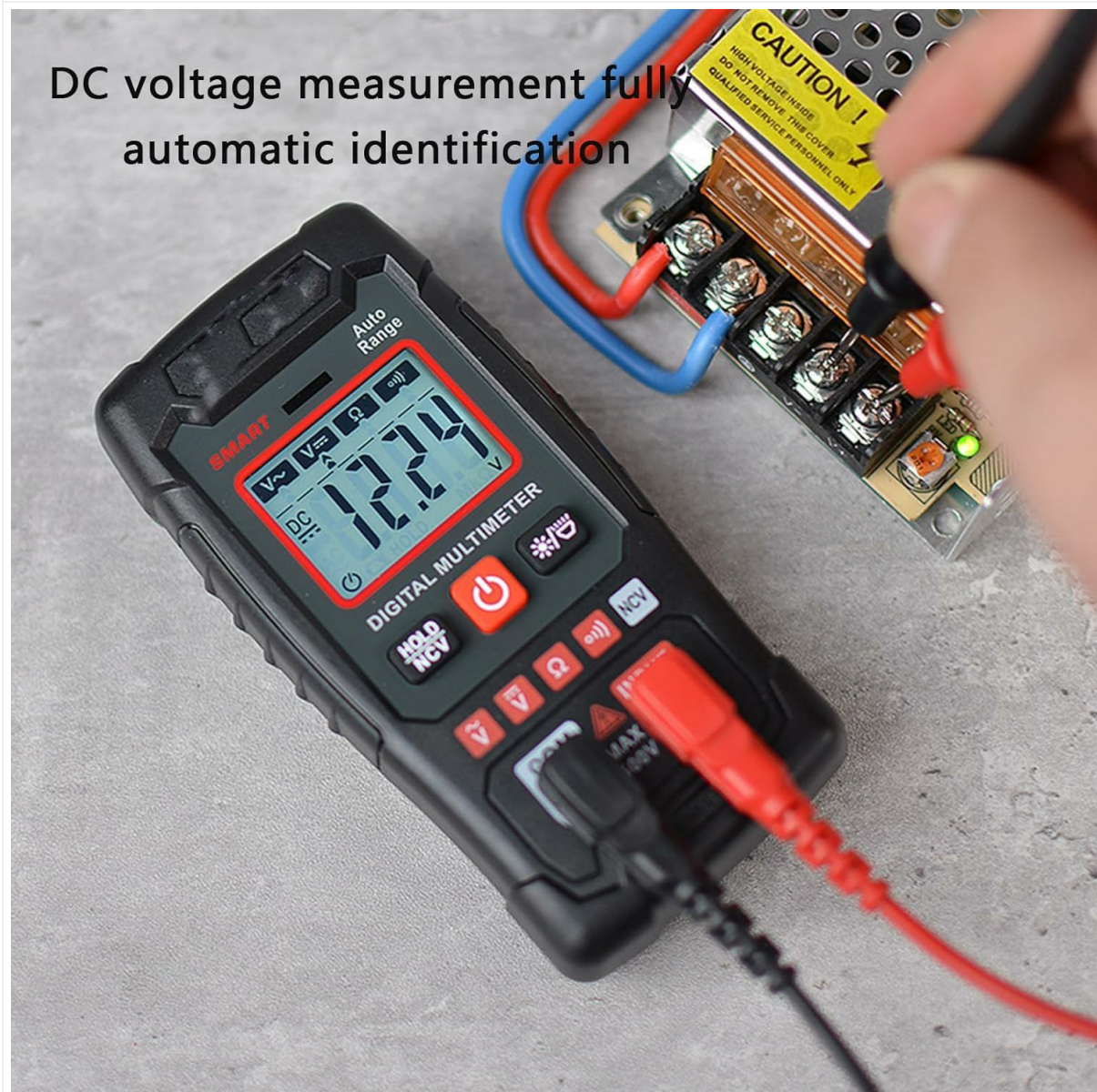
Figure 5: Measuring DC voltage on a circuit board. The display shows a DC voltage reading.