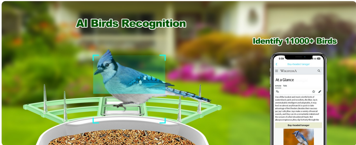
Image: A visual representation of the AI bird recognition feature, showing a Blue Jay being identified by the camera system.