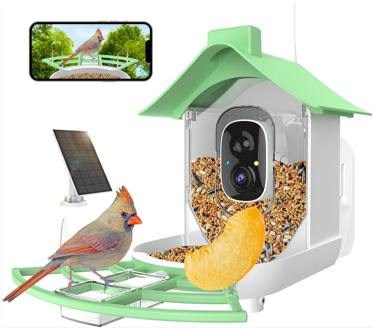
Image: The Vatjubi Smart Bird Feeder with Camera, featuring a cardinal perched on the feeding tray and a smartphone screen displaying a live feed from the camera.