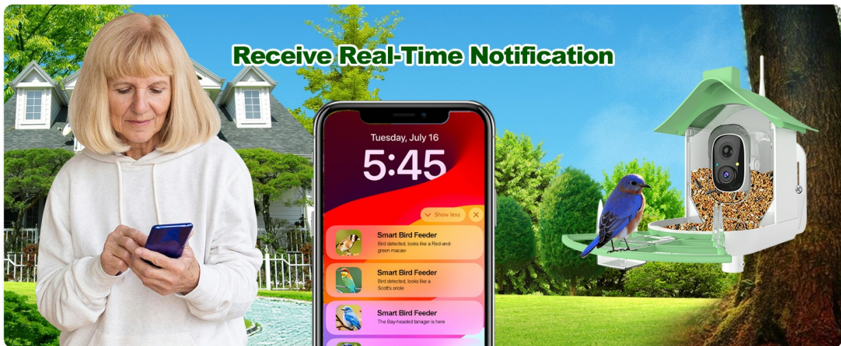
Image: A smartphone screen showing an instant notification of a detected bird, along with a live image from the feeder camera.