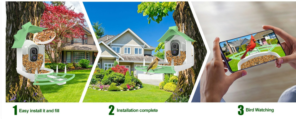
Image: A sequential visual guide showing the process of installing the feeder, filling it with seed, and then viewing birds through the connected smartphone app.