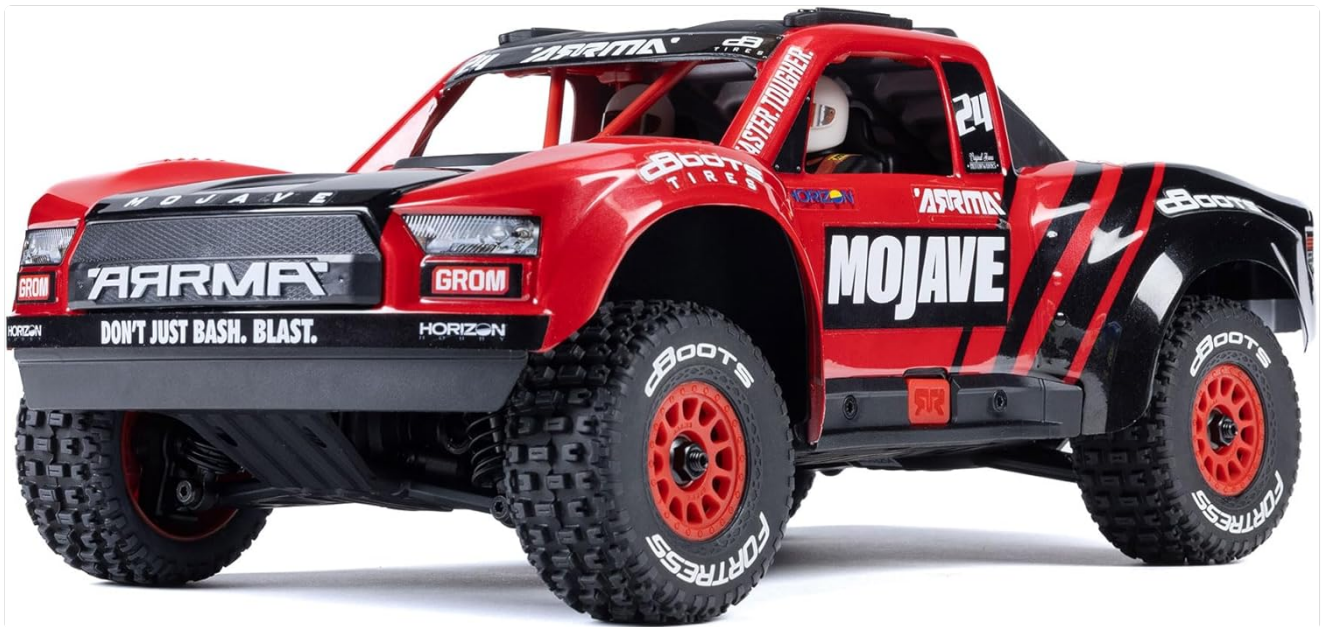
Image: The ARRMA MOJAVE GROM 4x4 Smart Small Scale Desert Truck in red and black, ready to run.