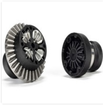
Image: Close-up view of the differential gears, highlighting components that may require inspection or maintenance.