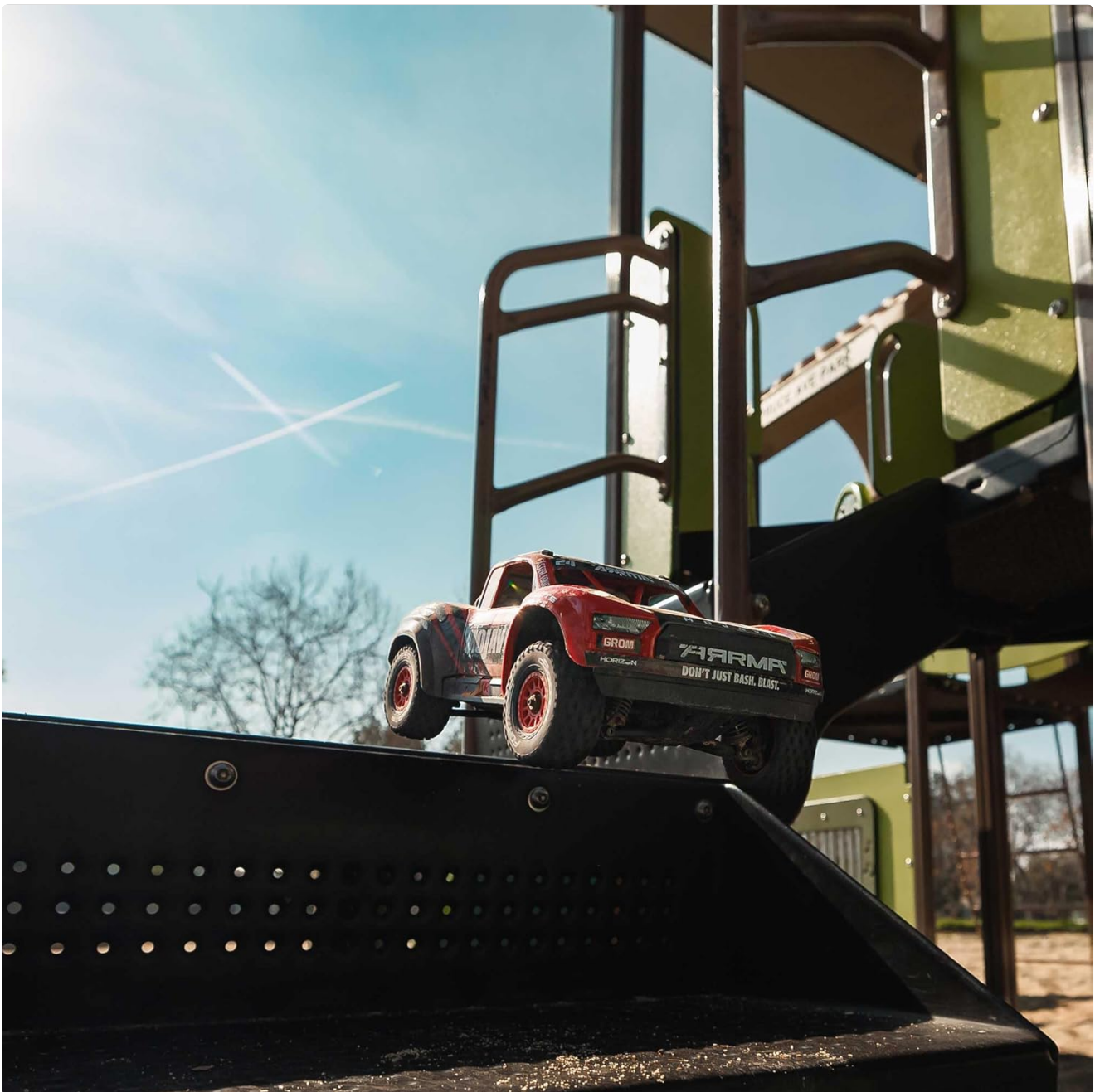
Image: The ARRMA MOJAVE GROM captured mid-air, showcasing its robust suspension and ability to handle jumps.