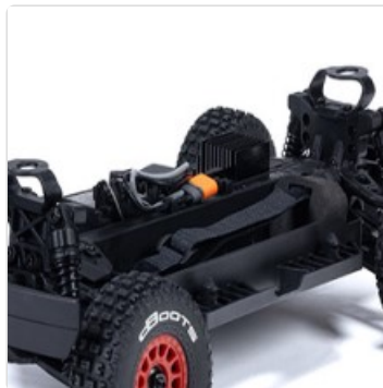
Image: A view of the ARRMA MOJAVE GROM chassis with the body removed, showing the internal components and battery tray.