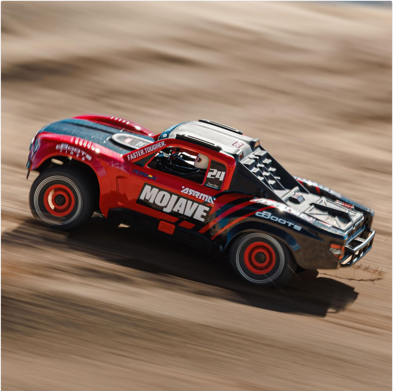
Image: The ARRMA MOJAVE GROM desert truck speeding across a sandy terrain, demonstrating its off-road capability.