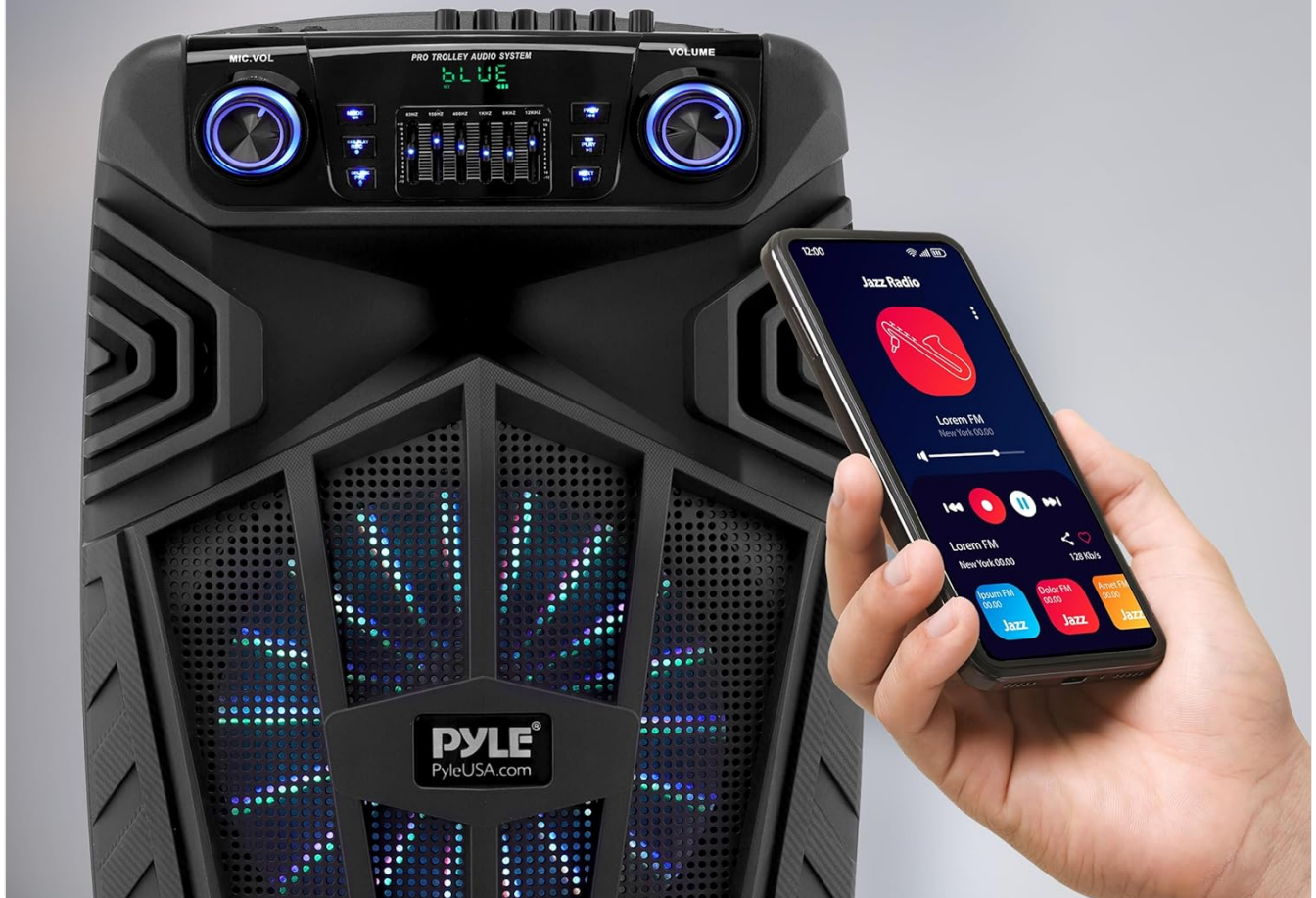
Image: The control panel features various inputs and controls for wireless music streaming and other functions.