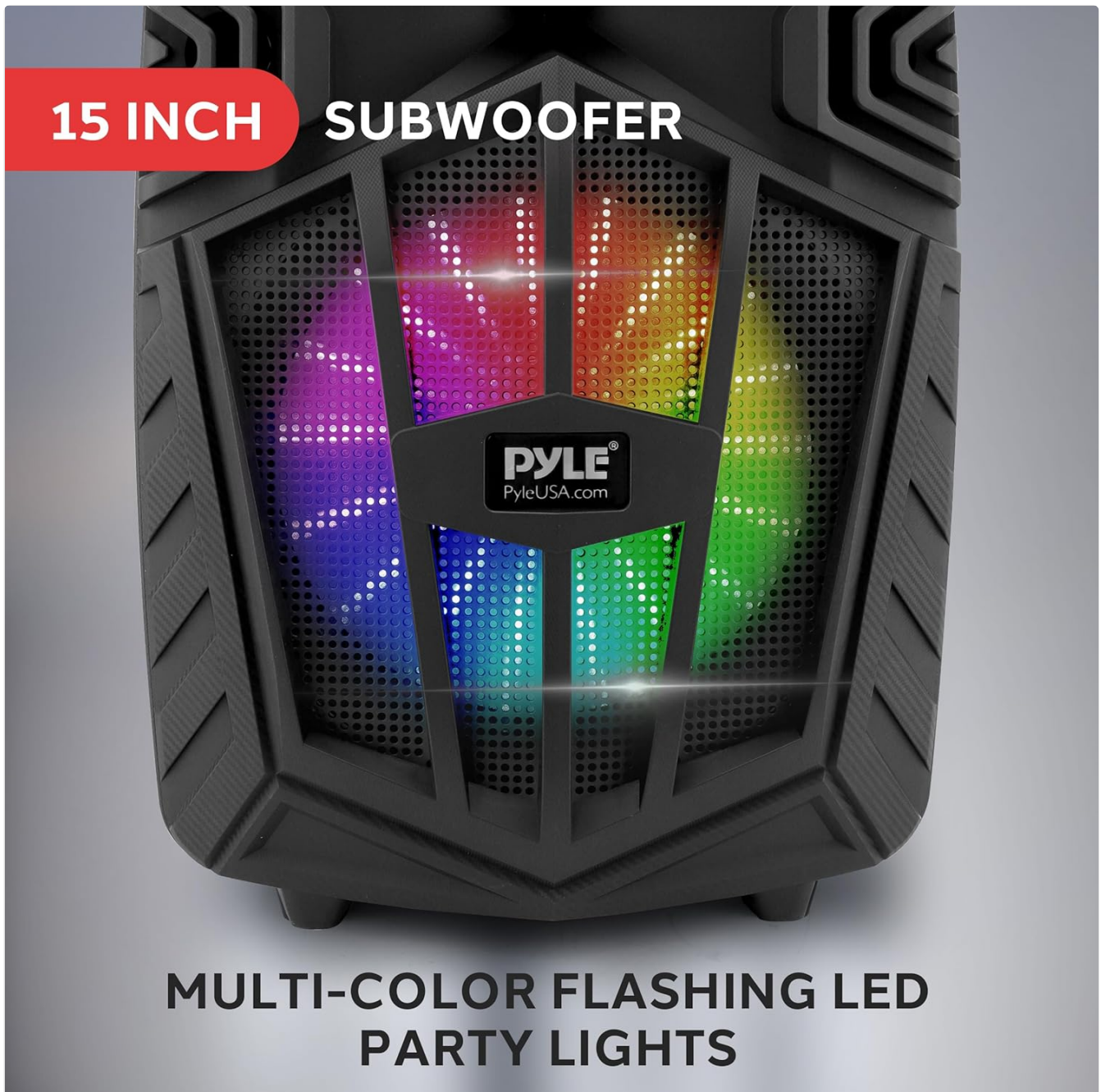
Image: The speaker features multi-color flashing LED lights integrated into the subwoofer grille.

The multi-color flashing LED party lights activate automatically when the speaker is powered on. There may be a dedicated button to toggle these lights on or off, depending on the specific model revision. Refer to the control panel for a light control button if available.