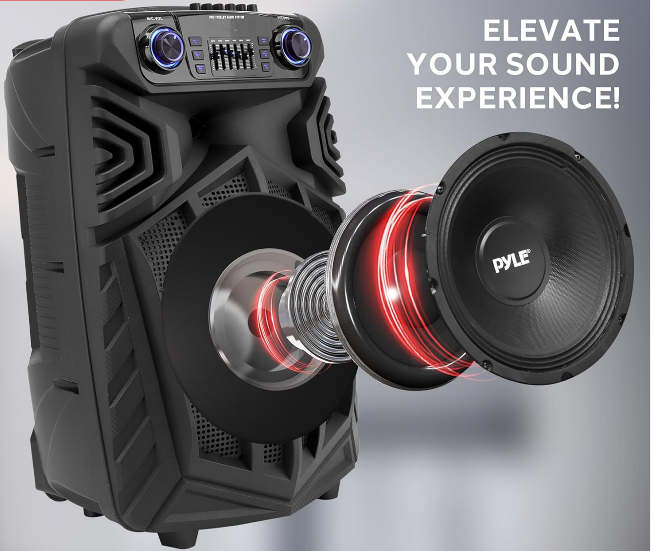
Image: The speaker's internal components highlight its 1680W power output and 15-inch subwoofer.