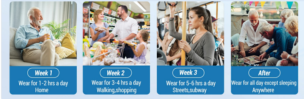
Image 3.3: Recommended 21-day adaptation schedule for new hearing aid users.