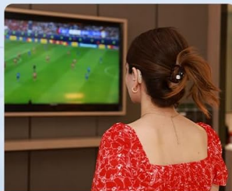
Indoor Mode Fixed Noise Reduction