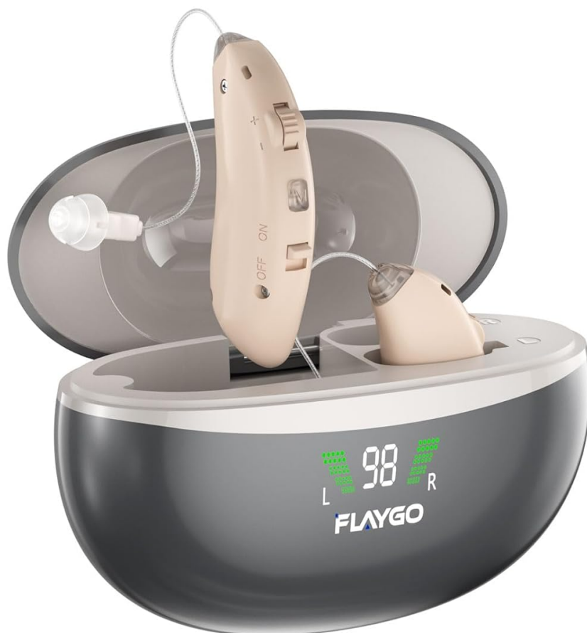
Image 1.1: Flaygo GM-353T Digital Hearing Aids in their portable charging case.