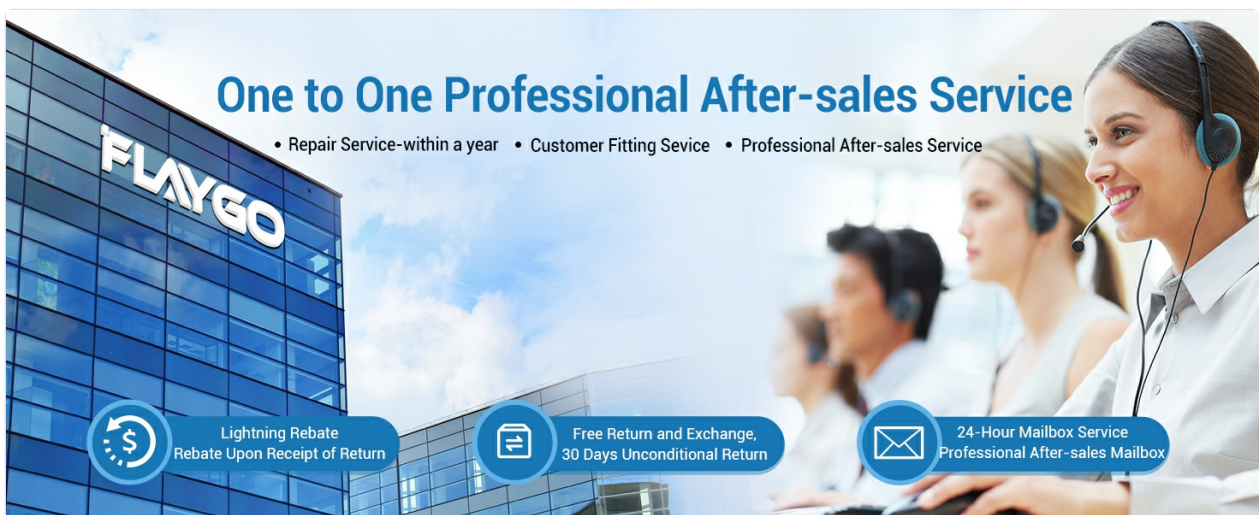
Image 8.2: Overview of Flaygo's dedicated customer support, including repair service and 24-hour mailbox service.