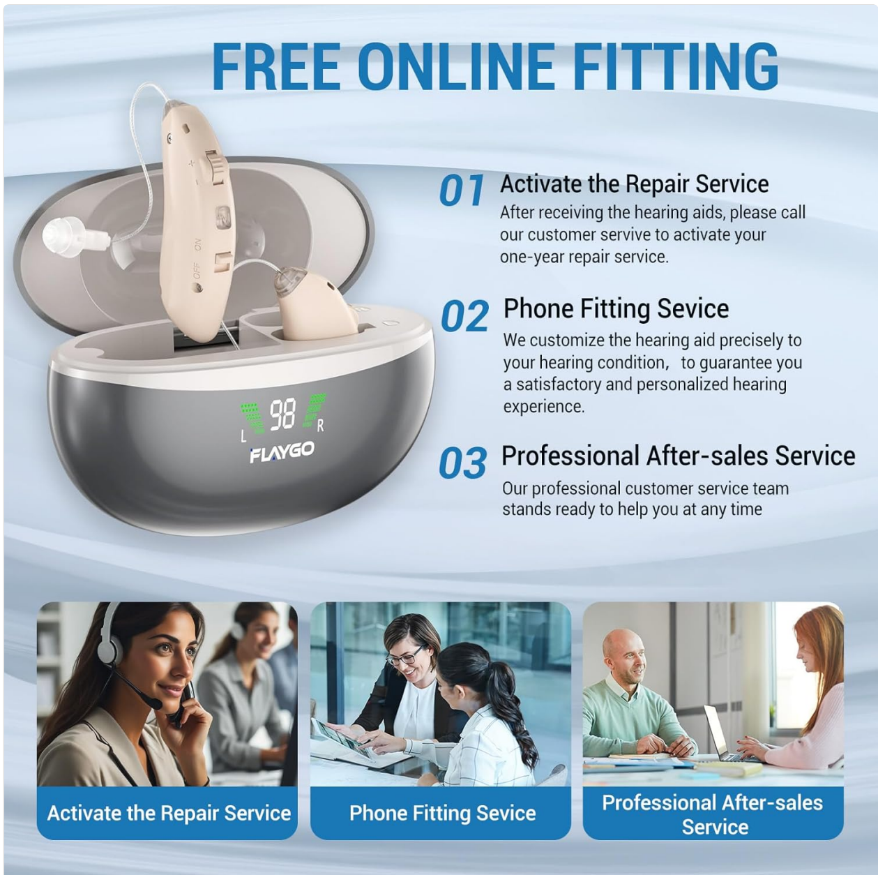
Image 8.1: Information on Flaygo's online fitting and professional after-sales support services.