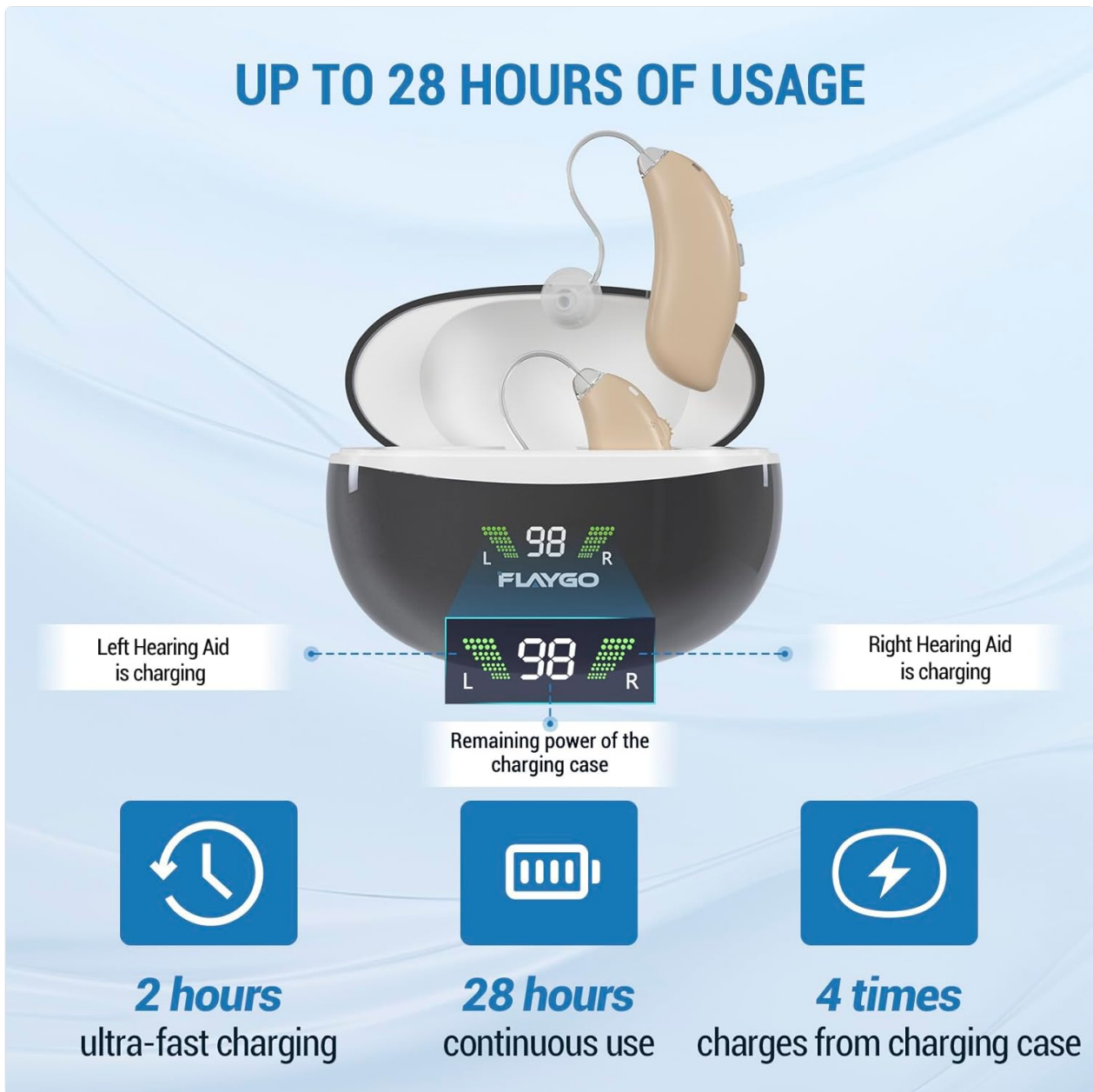
Image 3.1: Illustration of the charging process and battery life for the Flaygo GM-353T hearing aids and charging case.