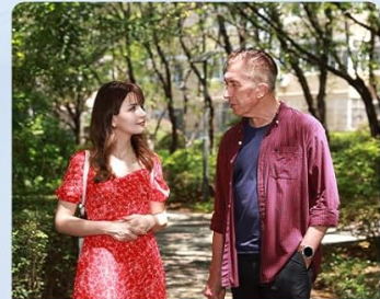
Outdoor Mode Directional Noise Reduction