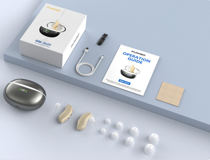
Image 2.1: Contents of the Flaygo GM-353T package, including hearing aids, charging case, and accessories.