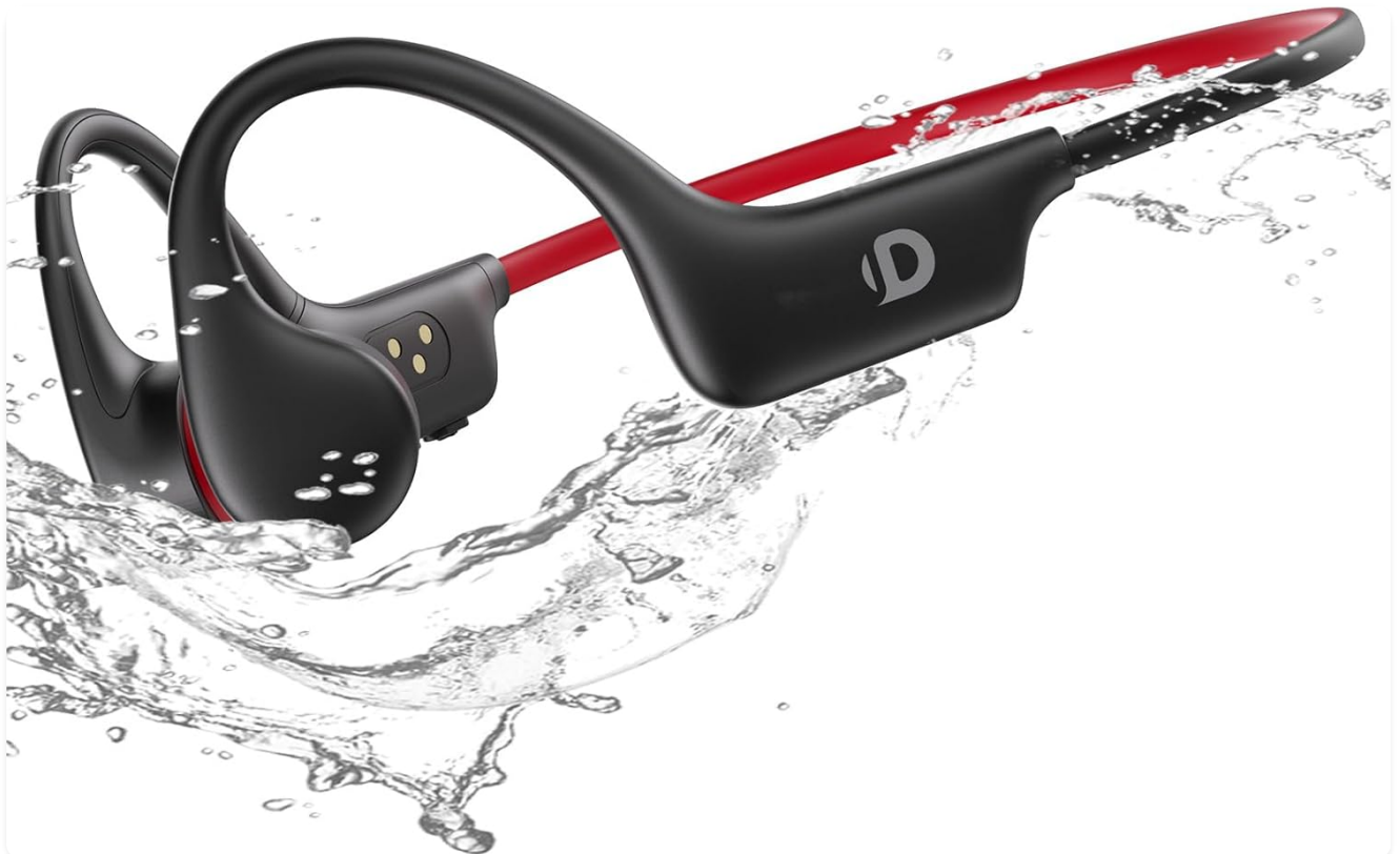
Image: The DEMICEA Open Ear Sport Headphones, showcasing their water-resistant design.

The DEMICEA Open Ear Sport Headphones (Model X6) are designed for active lifestyles, offering bone conduction technology for open-ear comfort, a built-in 32GB MP3 player, IP68 waterproof rating, and Bluetooth 5.3 connectivity. These headphones allow you to enjoy music while remaining aware of your surroundings, making them ideal for running, workouts, swimming, and other outdoor activities.