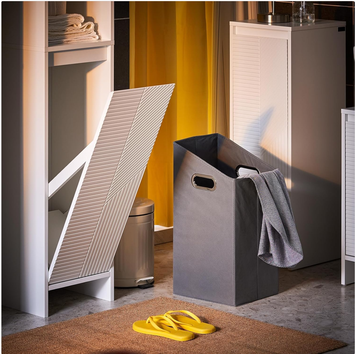
Image 5.2: The integrated laundry basket, accessible by opening the bottom door, designed to keep dirty laundry discreetly stored.