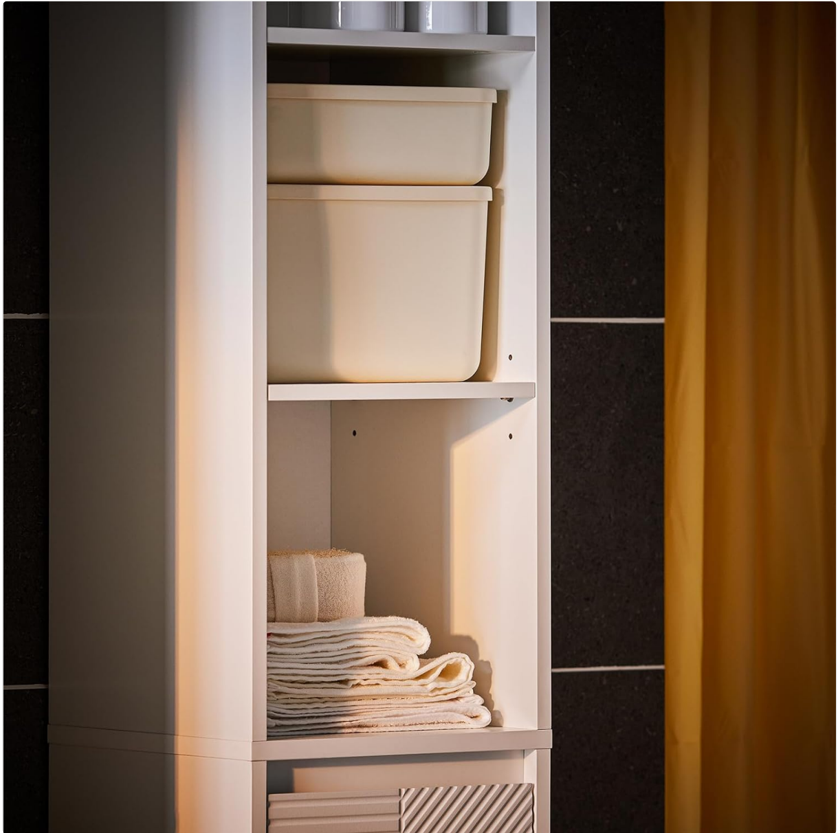
Image 5.1: A detailed view of the open compartments, showing how items can be stored and displayed.