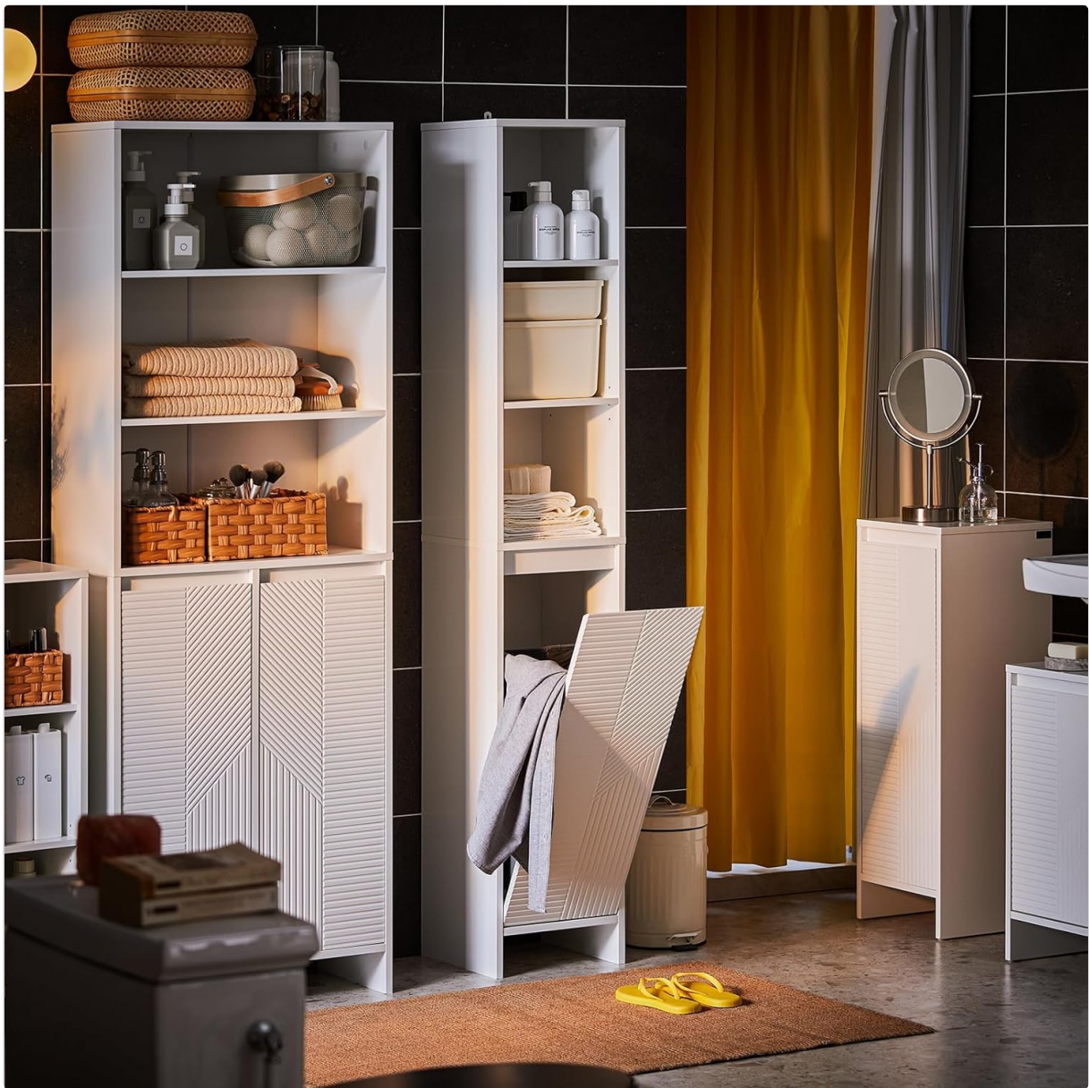
Image 1.1: The SoBuy BZR158-W Bathroom Column Cabinet, showcasing its design and storage capabilities within a bathroom environment.