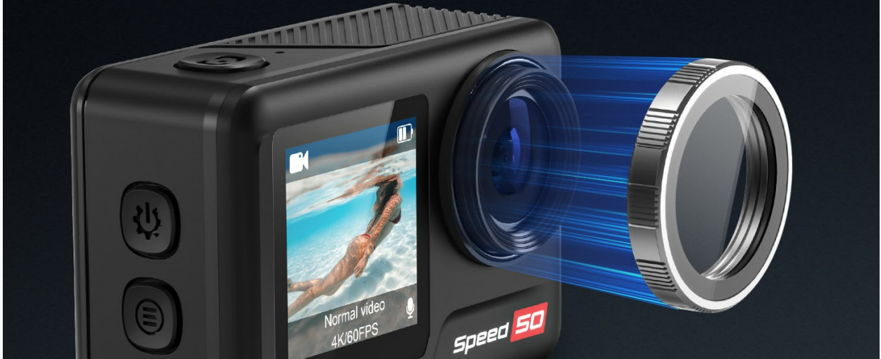
Figure 9: The camera features a clear lens with a removable anti-fog protector.