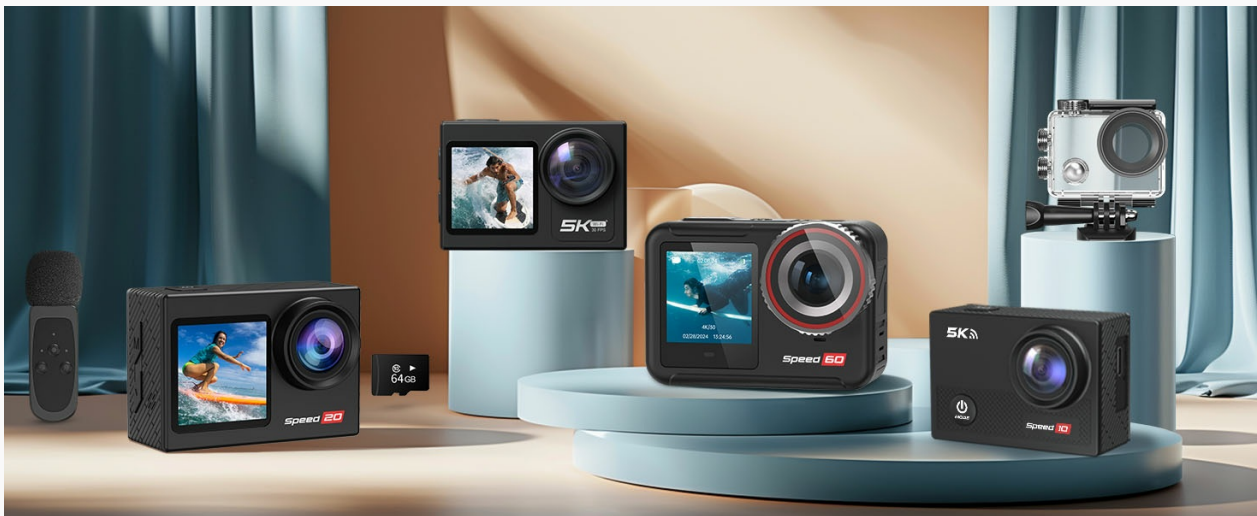
Figure 8: Seamless connectivity with the mobile application.