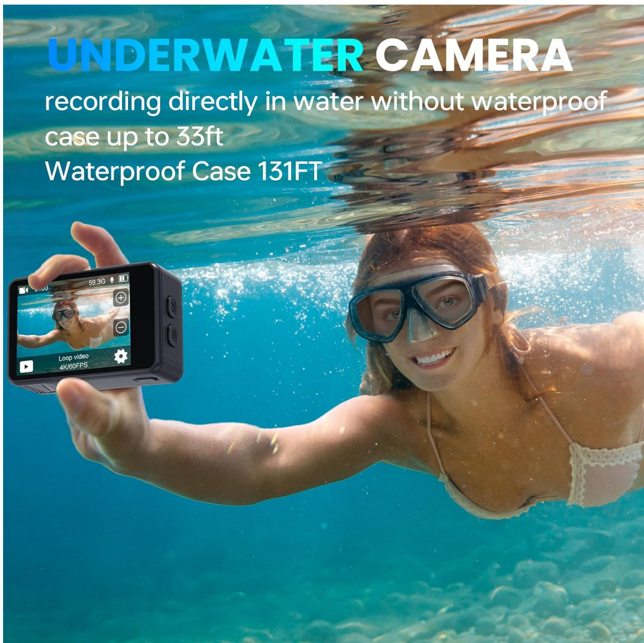
Figure 5: The camera is designed for underwater use with its waterproof case.