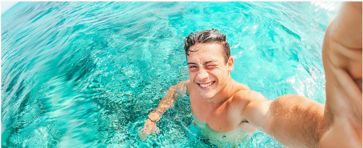
Figure 6: Dual screens for versatile shooting, including selfies.