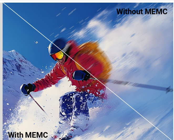
Image: A split image illustrating the effect of MEMC technology, showing a clear, sharp image of a skier on one side (with MEMC) and a blurred image on the other (without MEMC).

Motion Estimation and Motion Compensation smooths out fast action on TV screens by adding extra frames, reducing blur for a clearer picture.