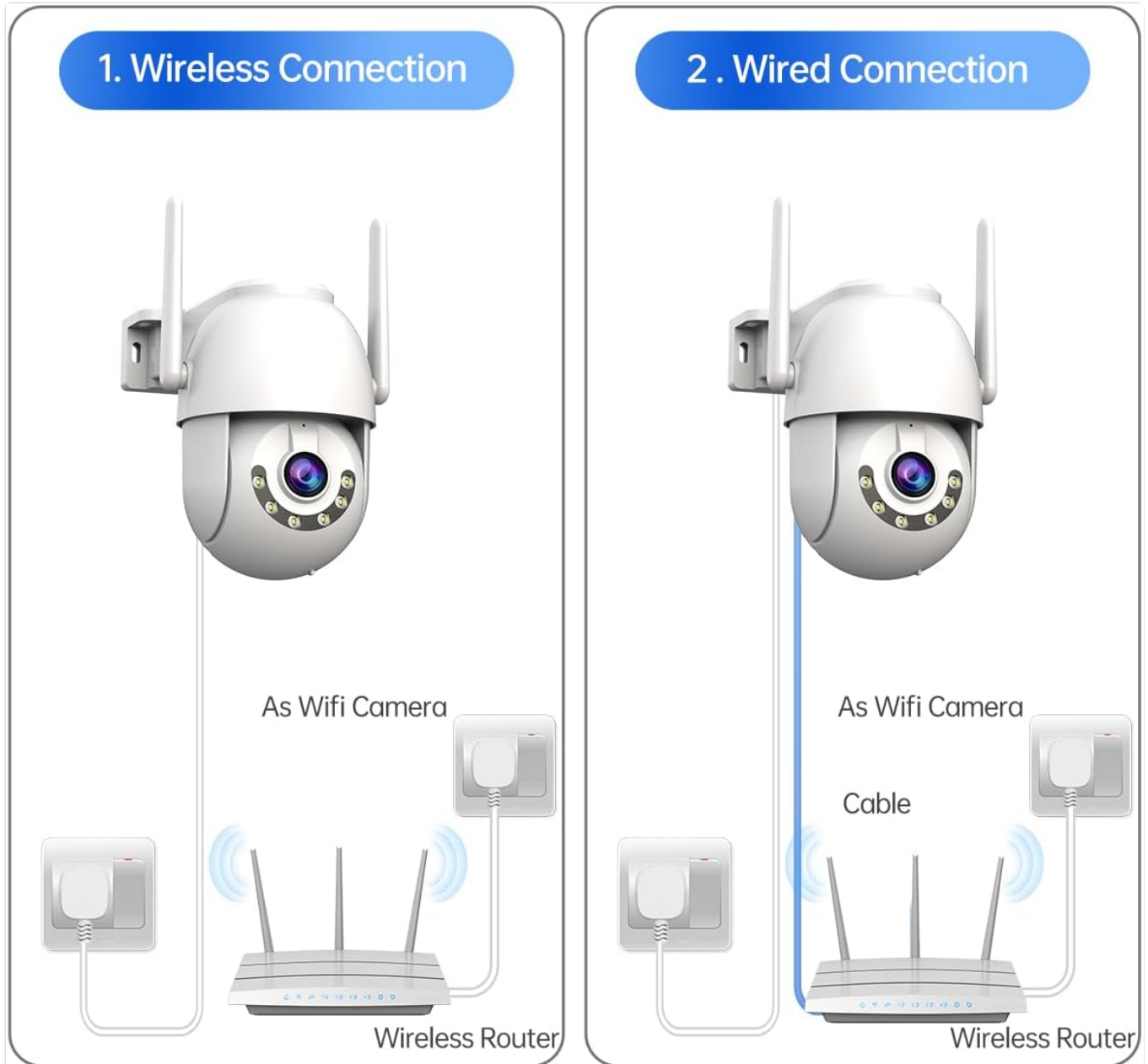
Image: Illustrates the two primary connection methods: wireless via WiFi and wired via an Ethernet cable to a router.

The camera supports both wireless (2.4GHz WiFi) and wired connections.