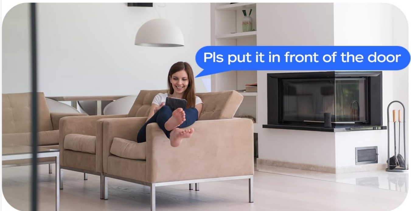
Image: Shows the two-way audio feature in action, allowing communication between someone at the door and a person viewing through the app.