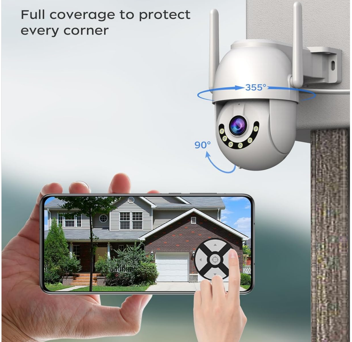
Image: Demonstrates remote control of the camera's pan and tilt functions via a smartphone app, highlighting its 360° viewing capability.

Your browser does not support the video tag.