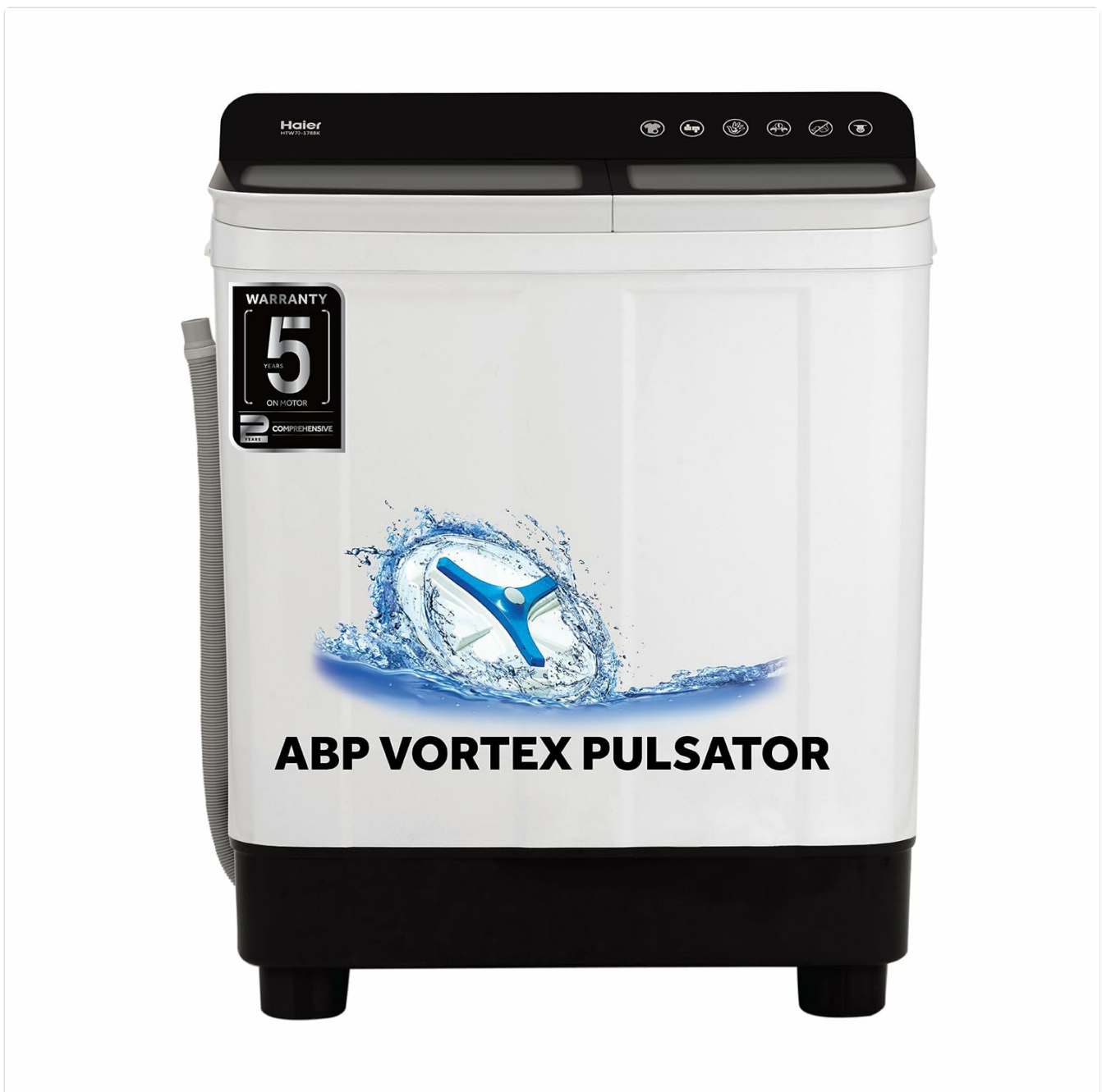
Image: Anti-Bacterial Vortex Pulsator. This image highlights the pulsator design, which creates a strong water vortex for thorough cleaning and features anti-bacterial properties.