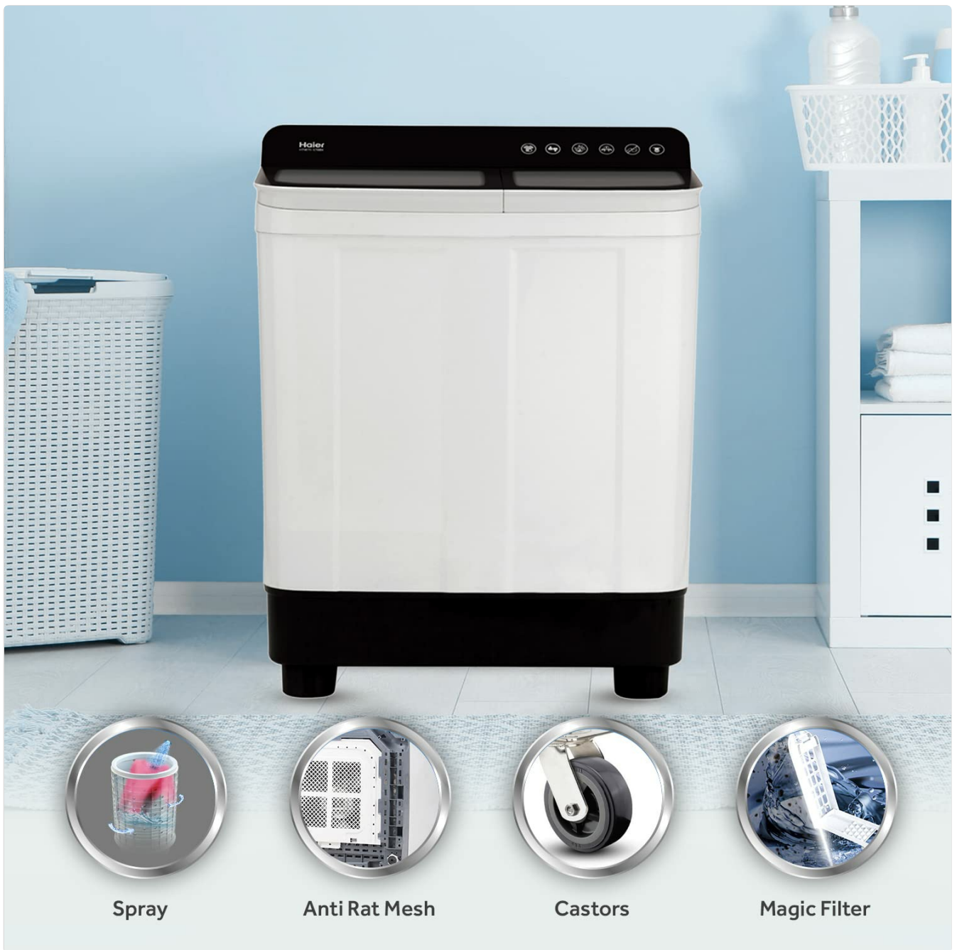
Image: Key Features Overview. This image displays the front of the washing machine and points out several important features: the spray function, anti-rat mesh, castors for easy movement, and the magic filter for lint collection.