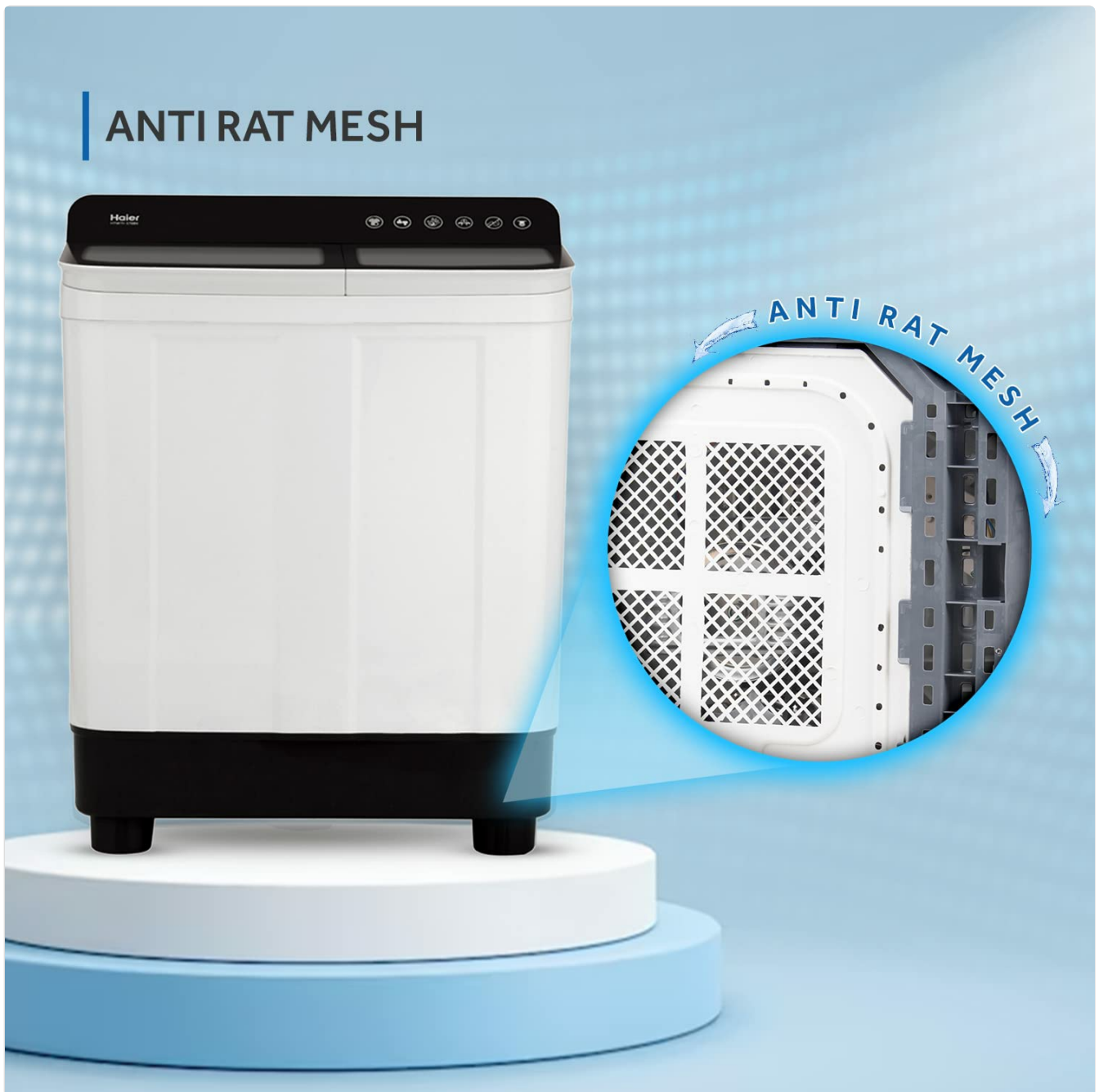
Image: Anti-Rat Mesh. This image provides a close-up of the protective anti-rat mesh located at the bottom of the washing machine, designed to prevent rodents from entering and damaging internal components.