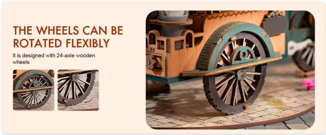
Image: Close-up of the rotatable wheels.