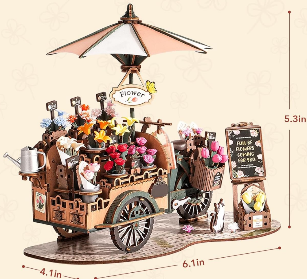
Image: Visual representation of the product dimensions.