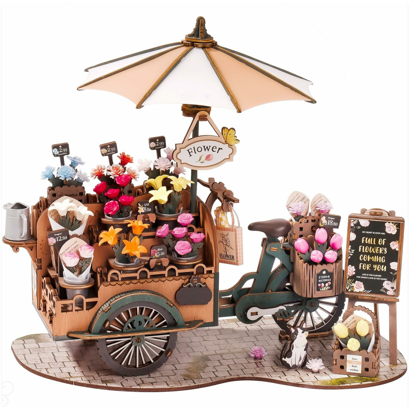
Image: The fully assembled ROBOTIME Floral Cart 3D Wooden Puzzle Kit.