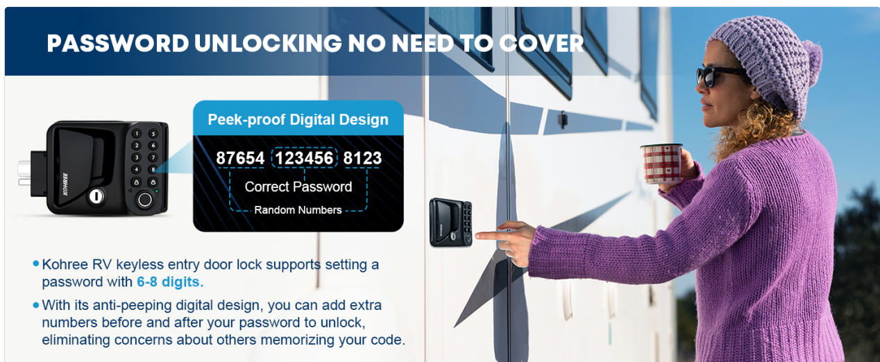
Image 5.1: The anti-peeping virtual password feature allows adding random digits before or after your actual code for enhanced security.