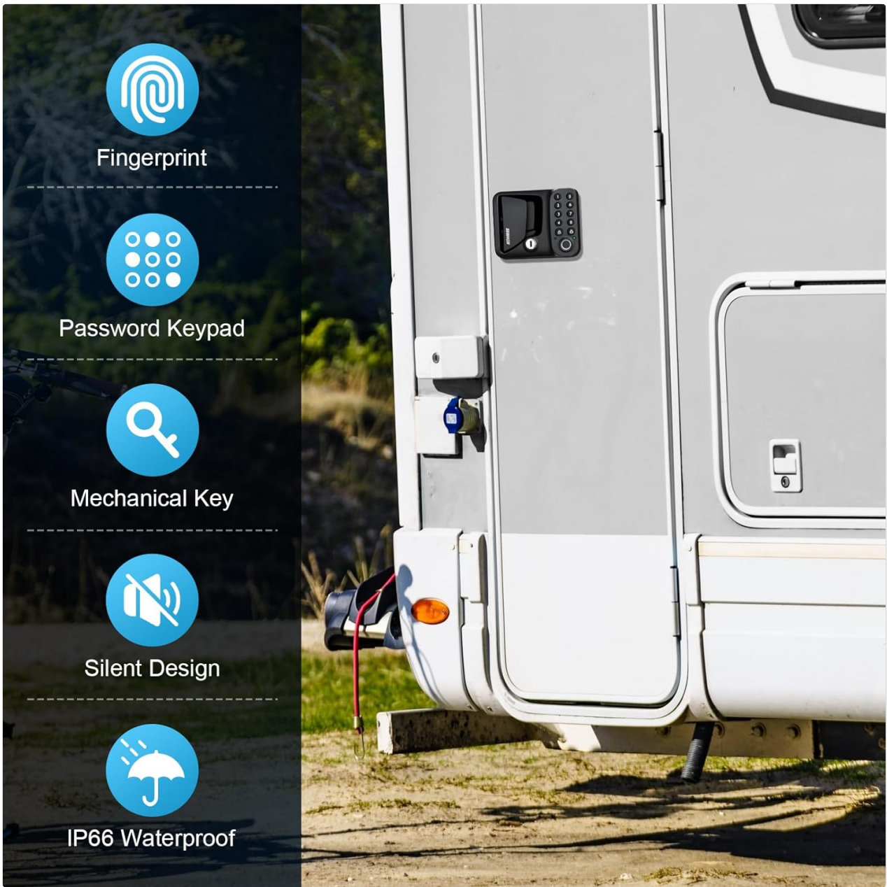
Image 1.1: Overview of the Kohree RV Door Lock's multiple entry methods and durable features.