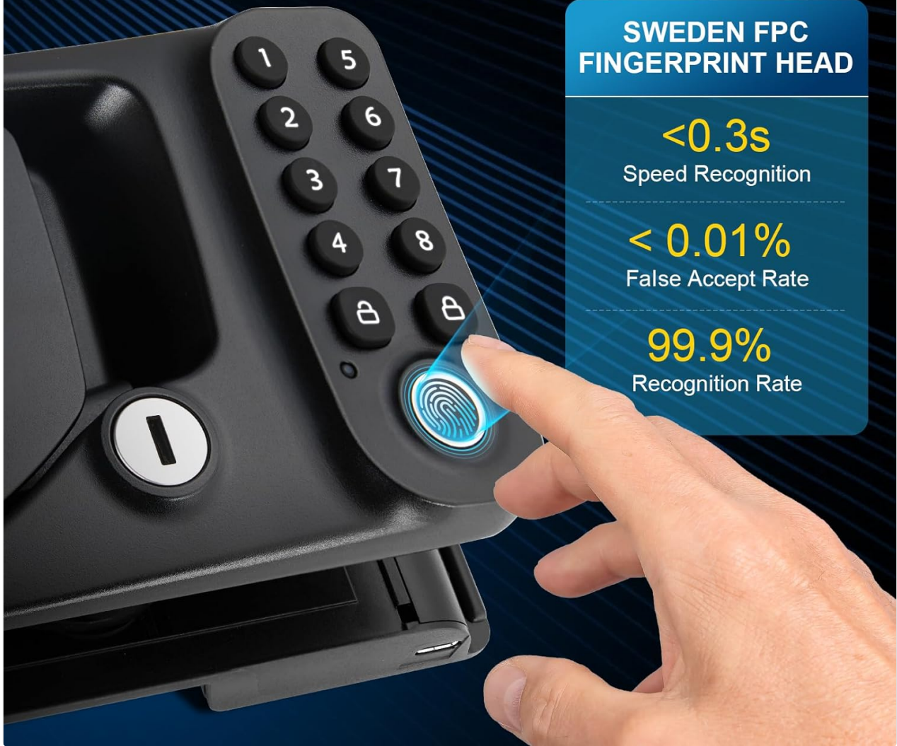
Image 5.2: The fingerprint sensor offers fast and accurate recognition for convenient access.

Your browser does not support the video tag.