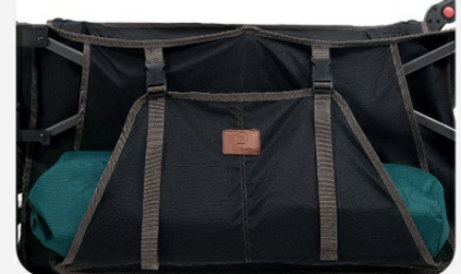
The wagon provides ample storage with cup holders and side pockets.