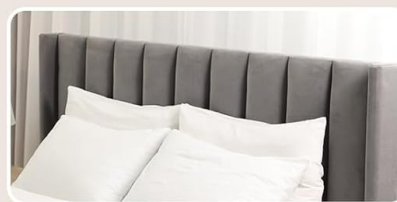
Image 4.3: Headboard compatibility feature with pre-drilled holes.