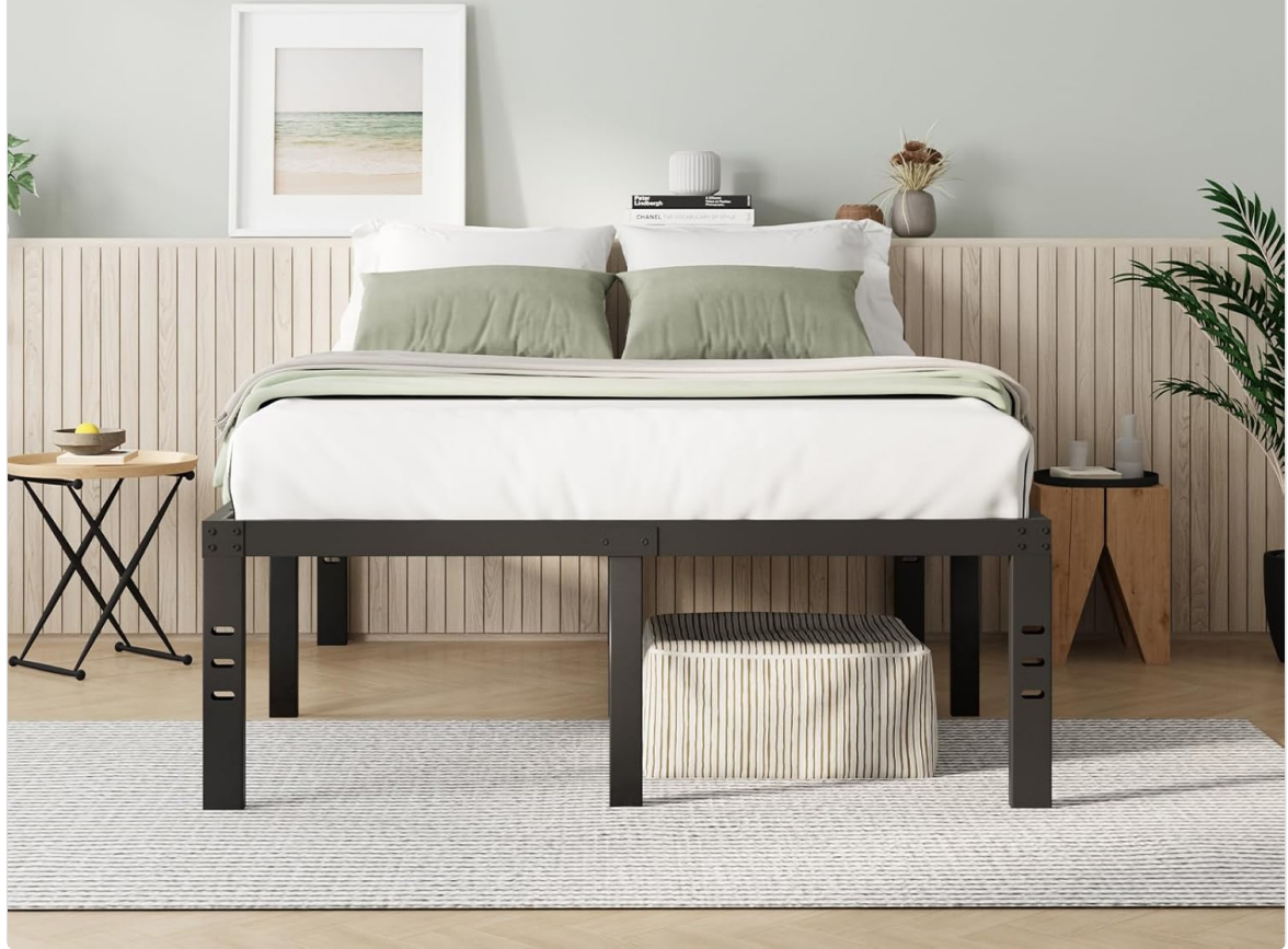
Image 4.4: Mattress placed directly on the bed frame, no box spring required.