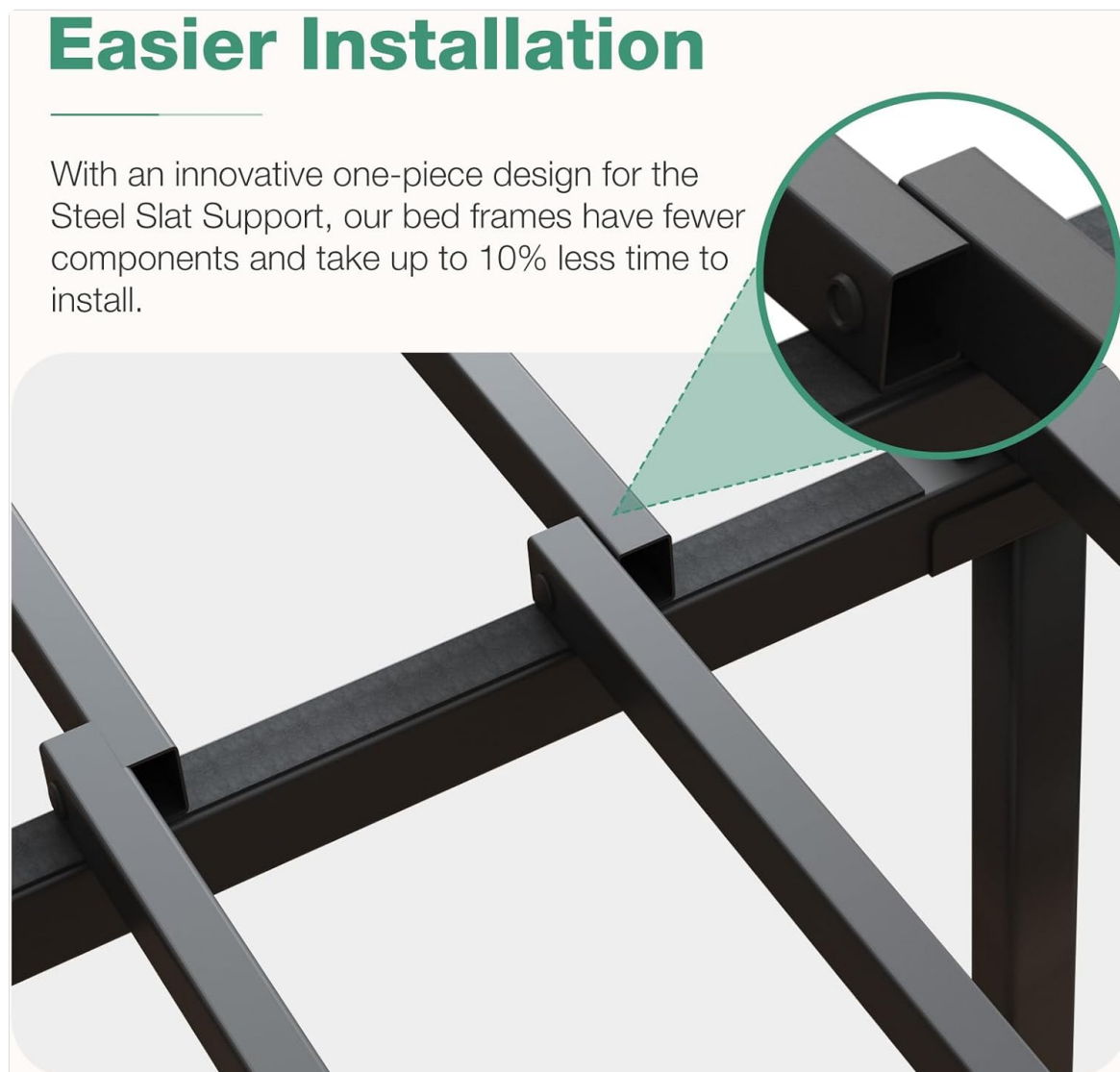
Image 4.2: Detail of the integrated slat design for simplified assembly.