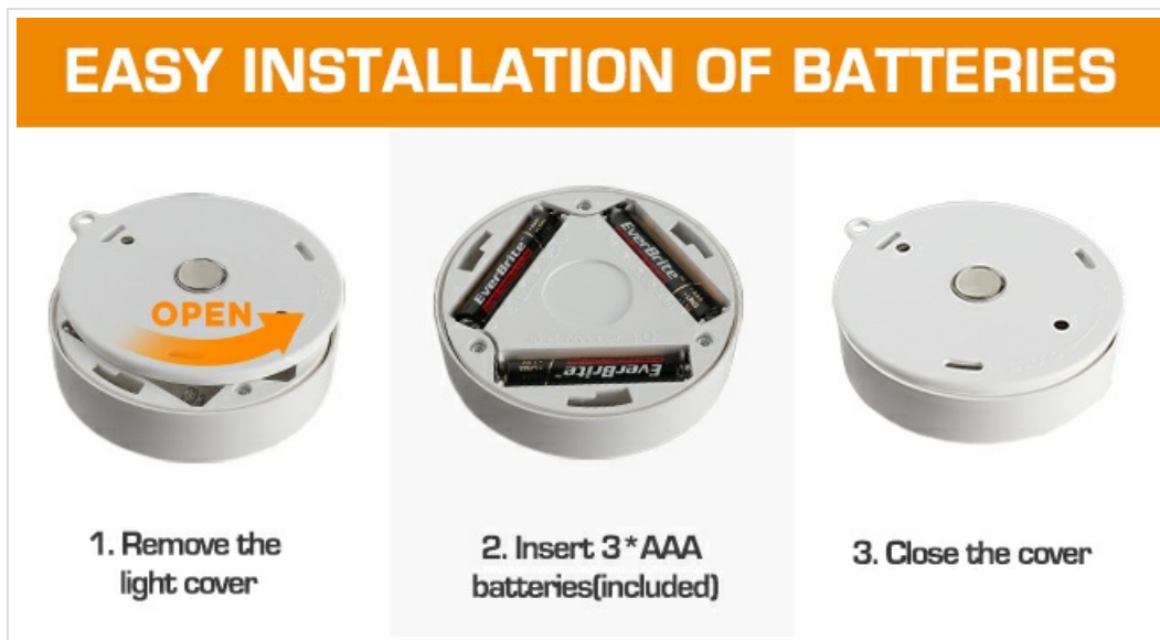
Image: Visual instructions for installing AAA batteries into the night light.