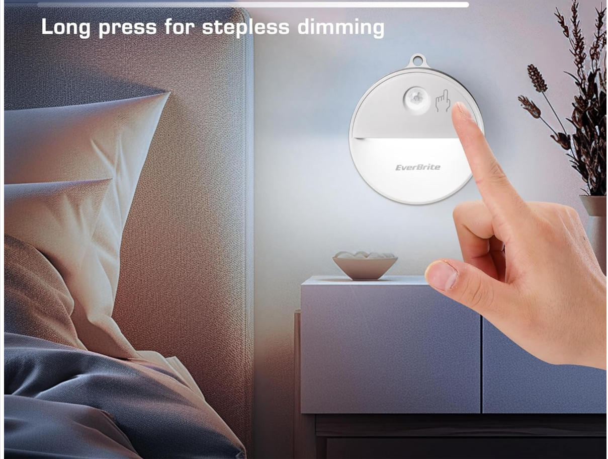
Image: Instructions for changing colors and dimming the night light using the touch sensor.