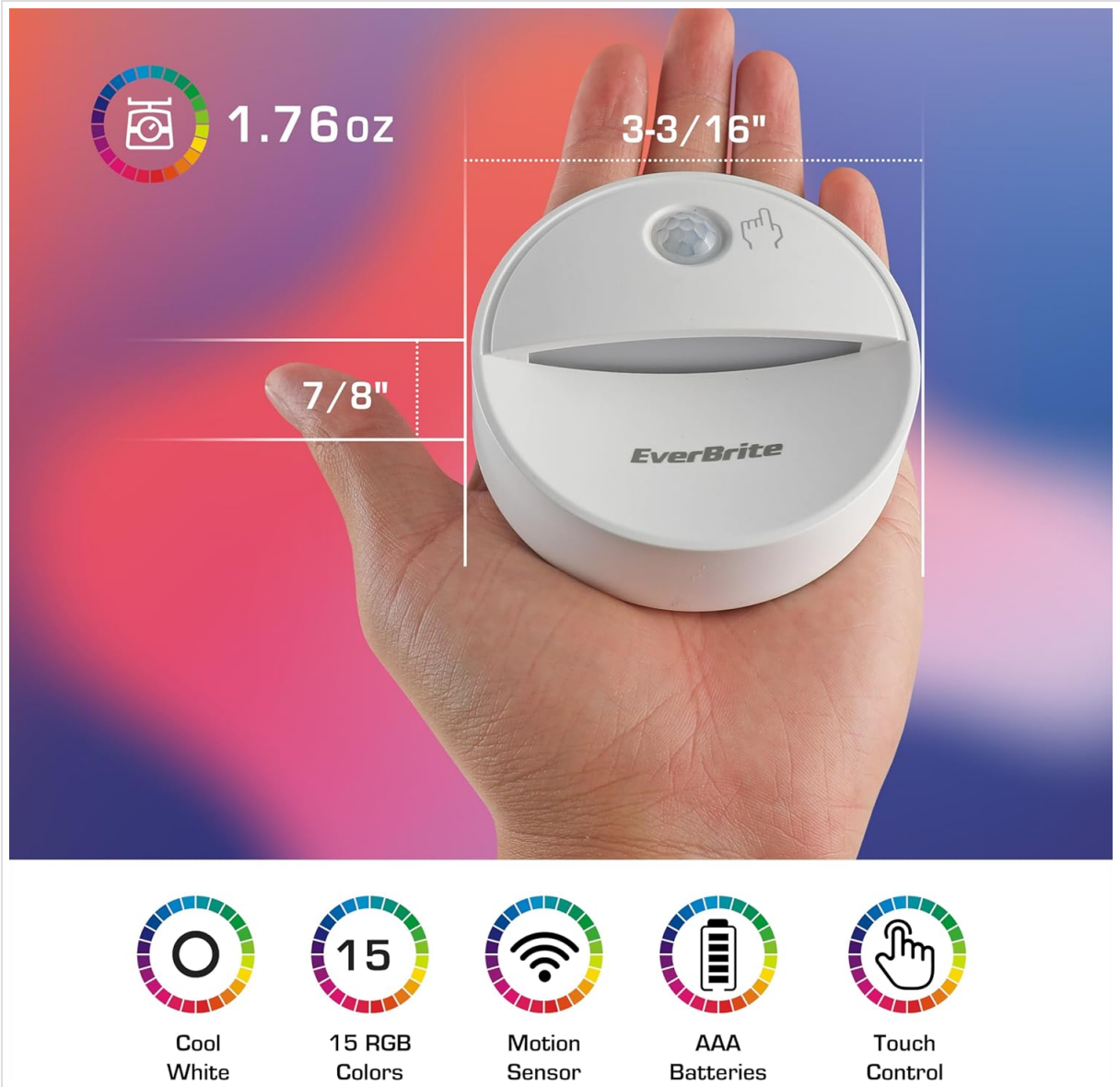
Image: Detailed dimensions and key features of the EverBrite night light.