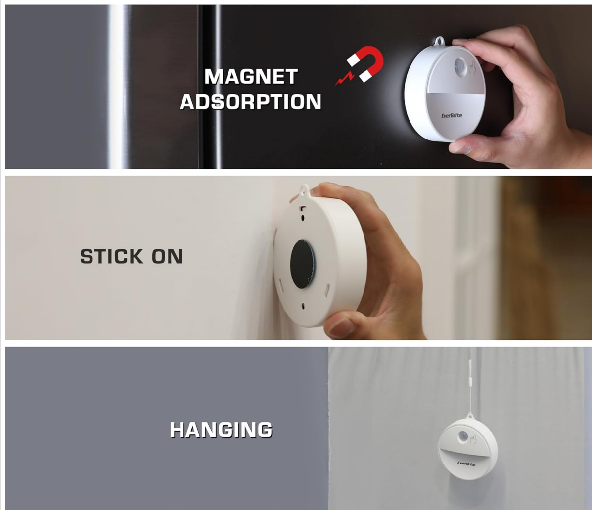
Image: Visual guide for the three installation methods: magnetic, adhesive, and hanging.

Multiple installation methods provide more convenience