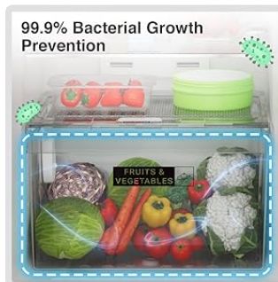
Vegetable crisper highlighting the 99.9% bacterial growth prevention feature.