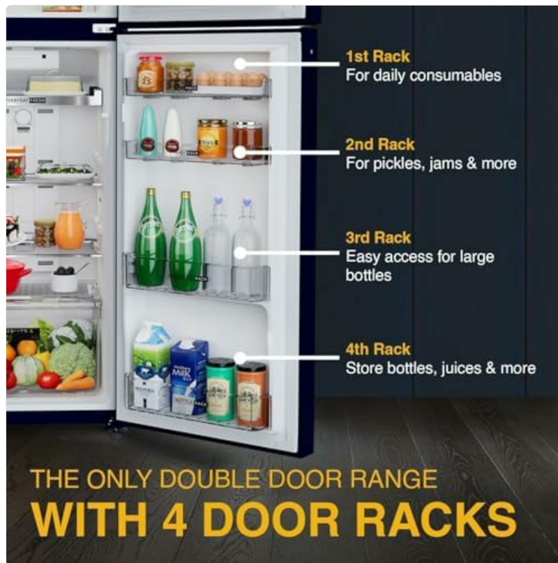
Interior view of the refrigerator, showcasing shelves and storage compartments.