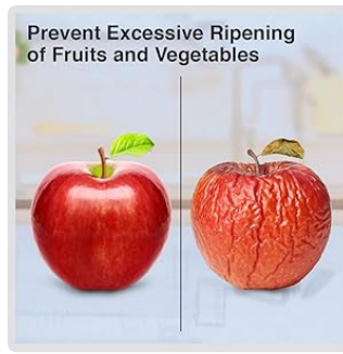
Comparison of apples illustrating the prevention of excessive ripening.