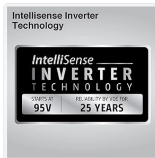
Illustration of Intellisense Inverter Technology for efficient cooling.