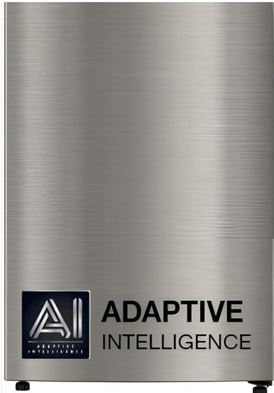
Front view of the Whirlpool 308 L Convertible Frost Free Double Door Refrigerator.