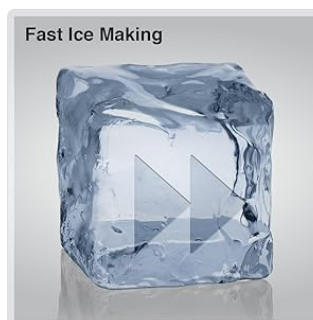
Visual representation of the fast ice making capability.