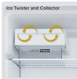
Diagram of the ice twister and collector system.