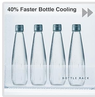
Bottles in a rack demonstrating 40% faster cooling.