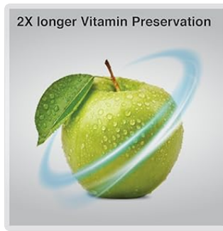
An apple illustrating the 2X longer vitamin preservation feature.