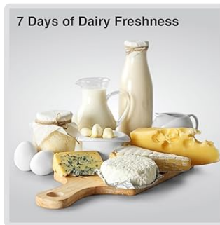
Assortment of dairy products illustrating the 7 days of dairy freshness feature.