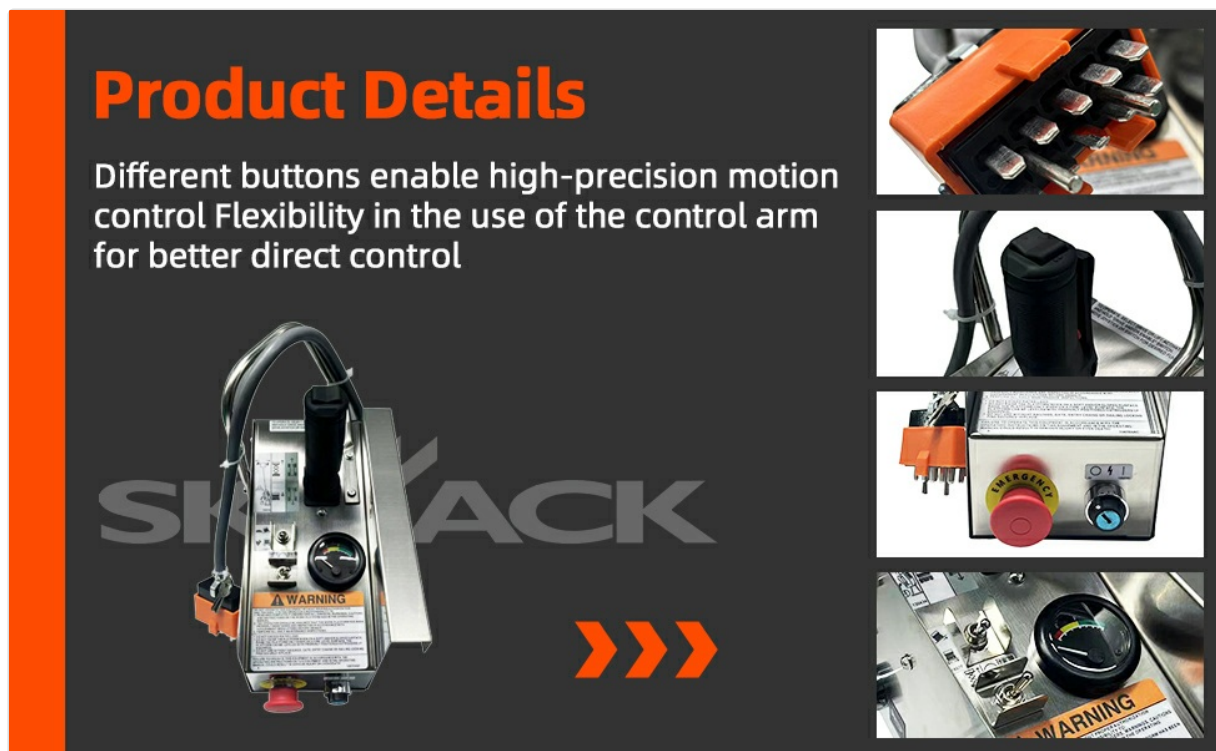
Image 4.1: Close-up views of the control box components for installation reference.