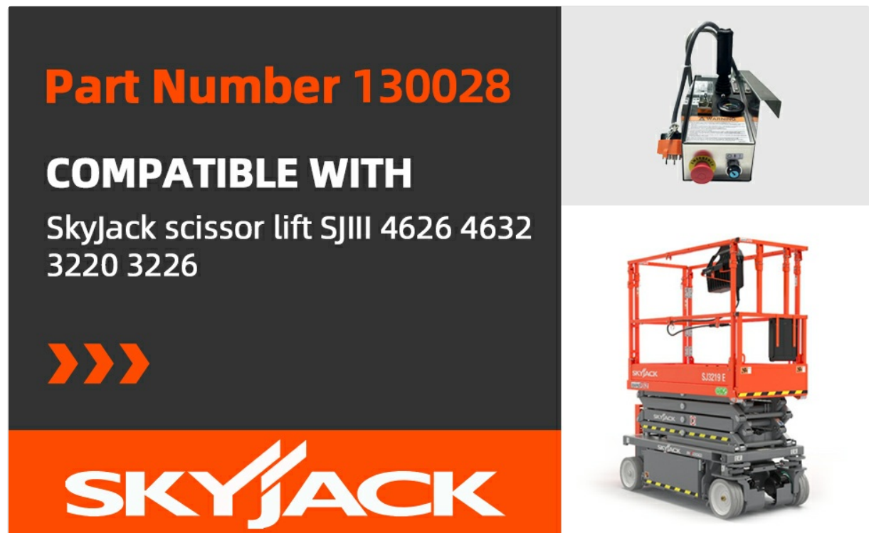
Image 3.2: Verification of part number 130028 and compatible SkyJack scissor lift.