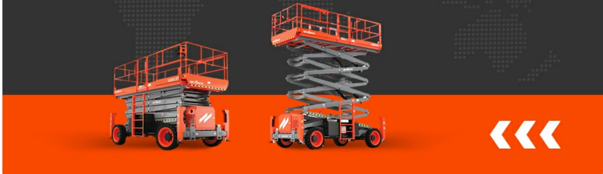
Image 8.1: The EZSUNSWAY 130028 Control Box compatible with various SkyJack scissor lifts.

We are committed to providing you with the best possible controller components