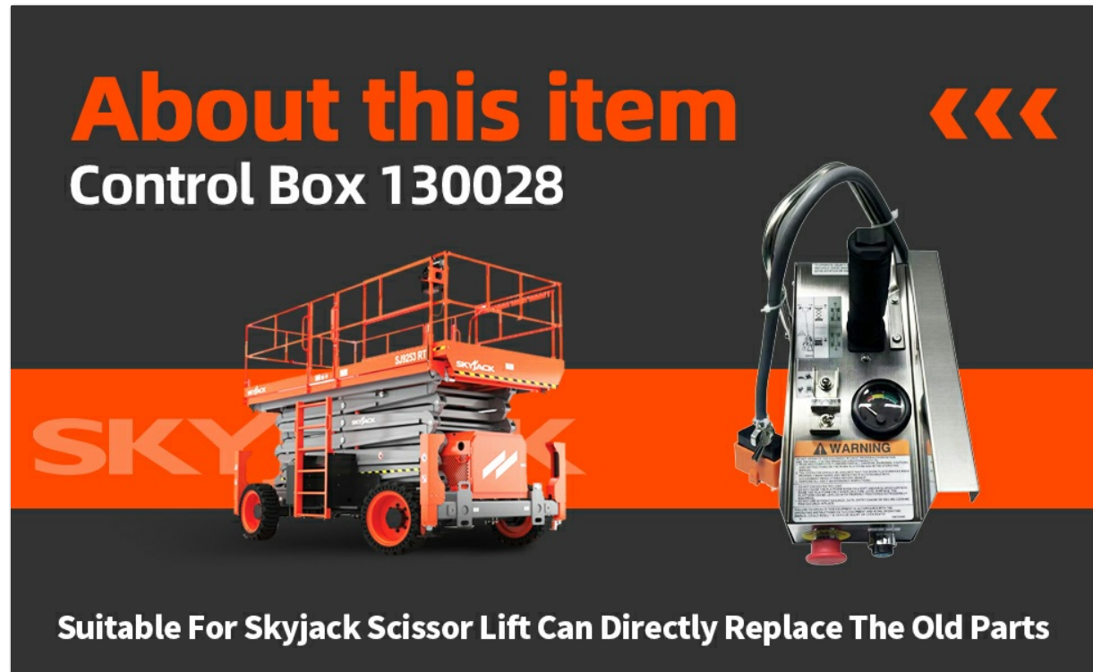
Image 3.1: EZSUNSWAY 130028 Control Box with highlighted features.