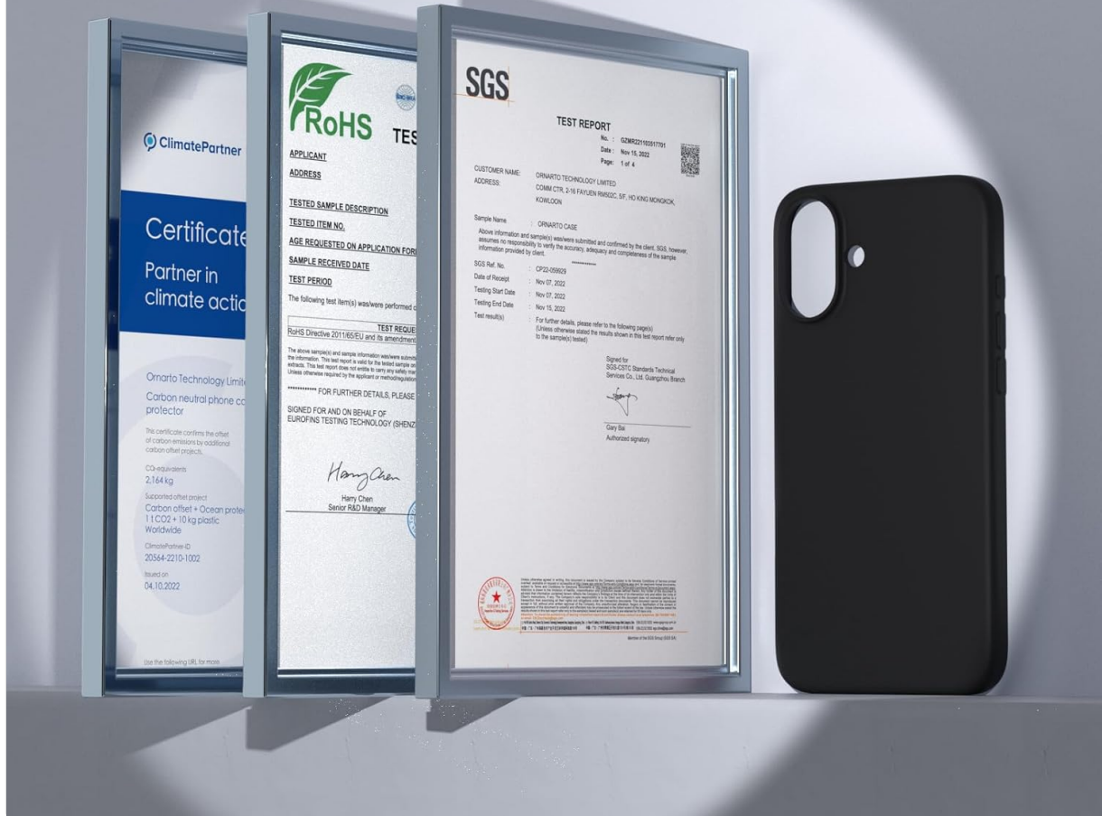
Image: SGS, RoHS, and CPF authorization certificates for quality and health material.