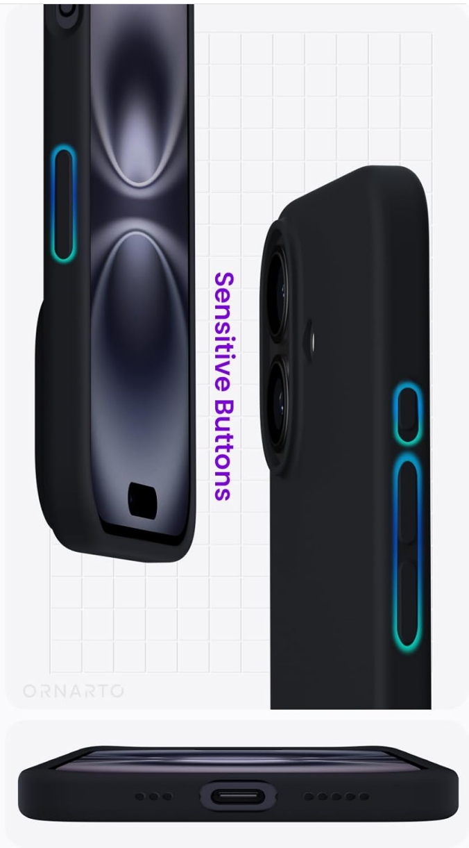
Image: Illustration of sensitive buttons and precise cutouts for optimal user experience.