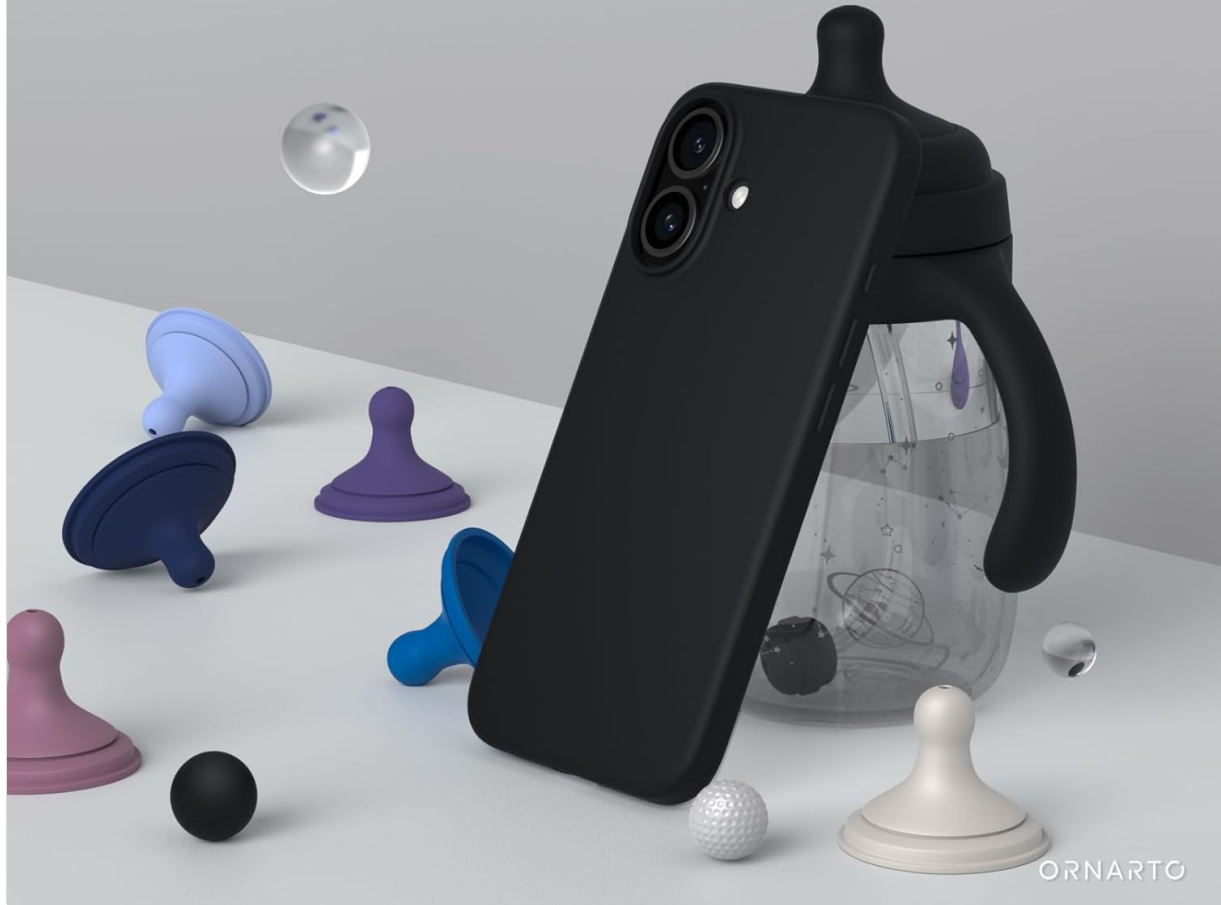
Image: Features of the liquid silicone material, including skin-friendly, easy to clean, and anti-fingerprint properties.