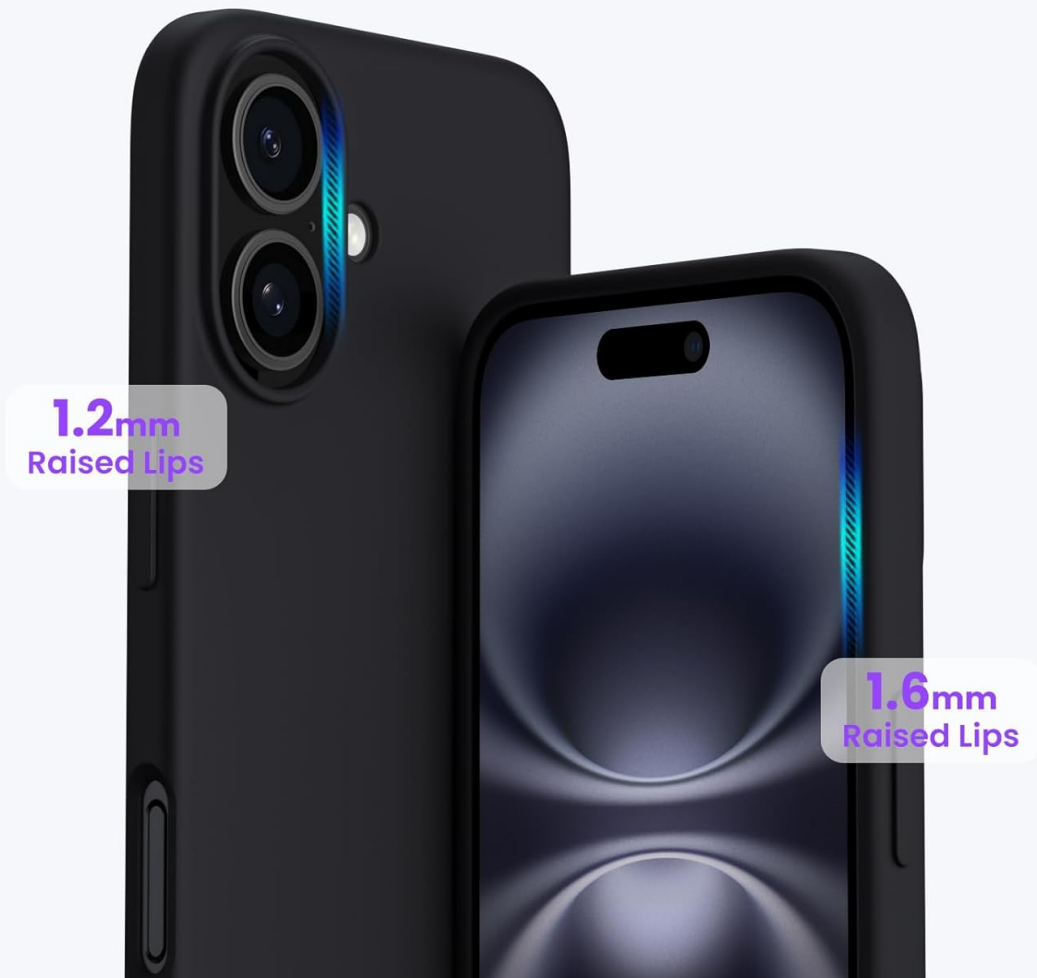
Image: Detailed view of raised edges for camera and screen protection.

Raised lips for better screen and camera protection