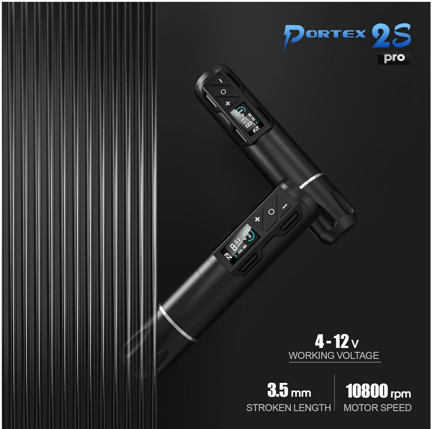
Figure 5: P2S Pro Key Specifications