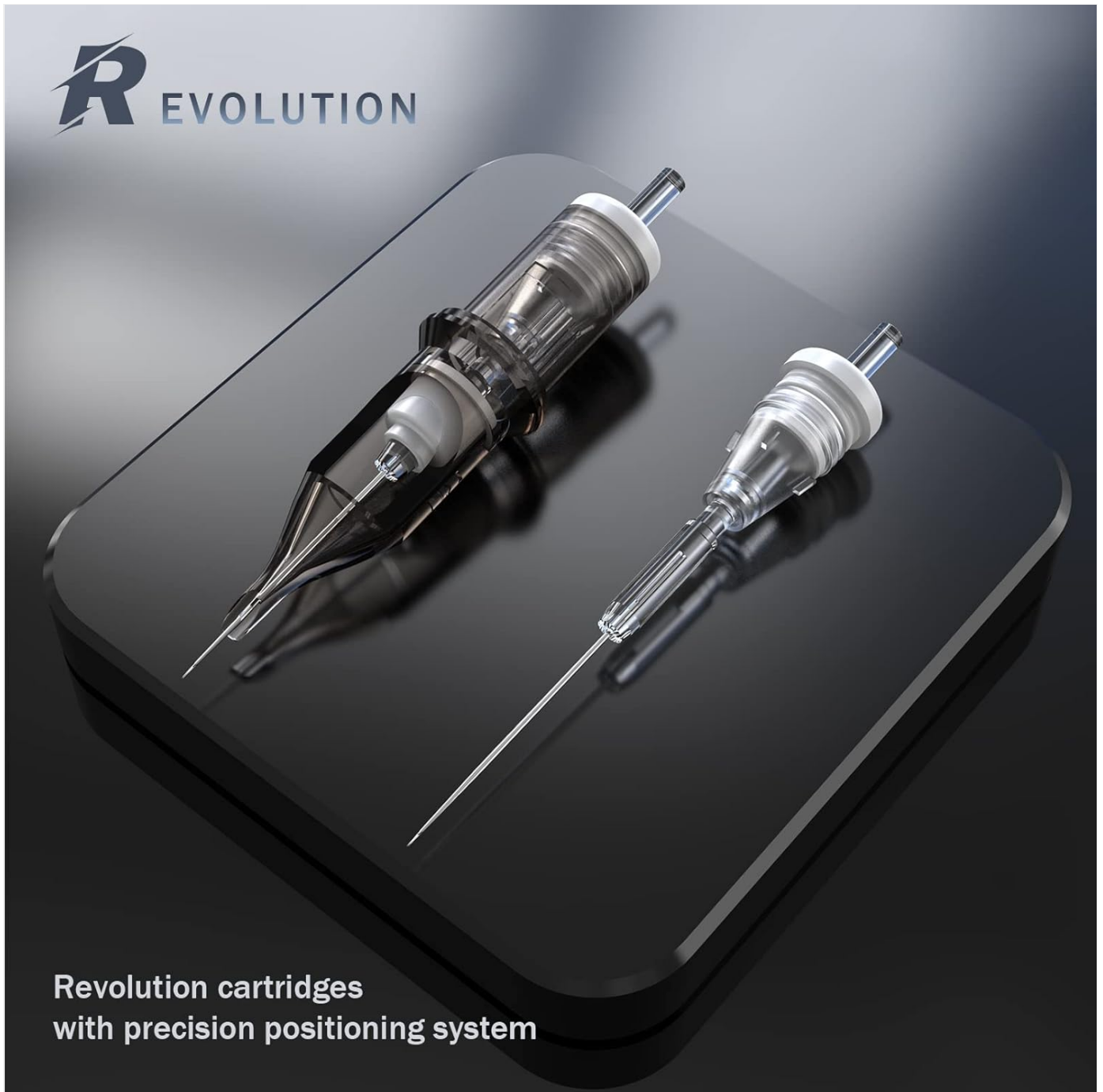
Revolution cartridges with precision positioning system