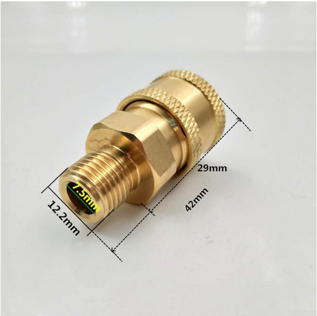
Figure 3.1: Main adapter with key dimensions. This brass adapter measures 42mm in length and 29mm in width, featuring a 7.5mm inner diameter and 12.2mm outer thread diameter.