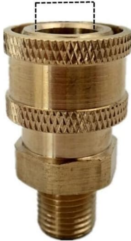
Figure 3.3: Detailed view of the G1/4 inch quick connect, highlighting its 12mm inner diameter.