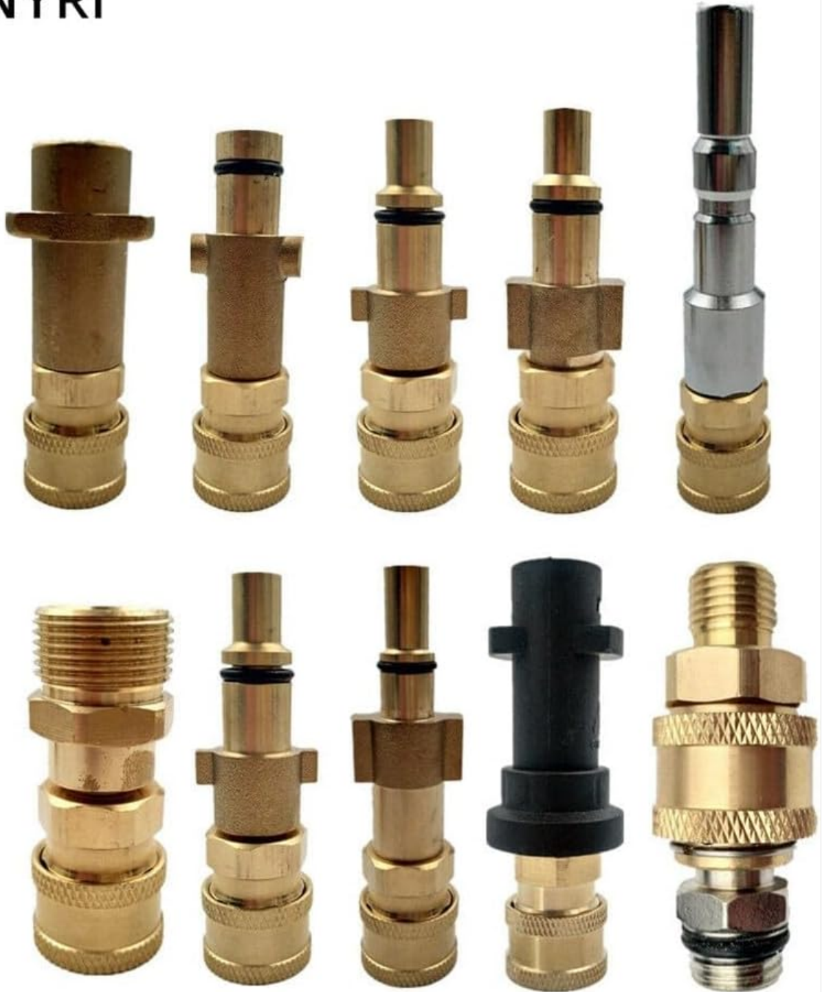
Figure 3.5: A collection of various pressure washer adapters and quick connectors, illustrating the range of available types.