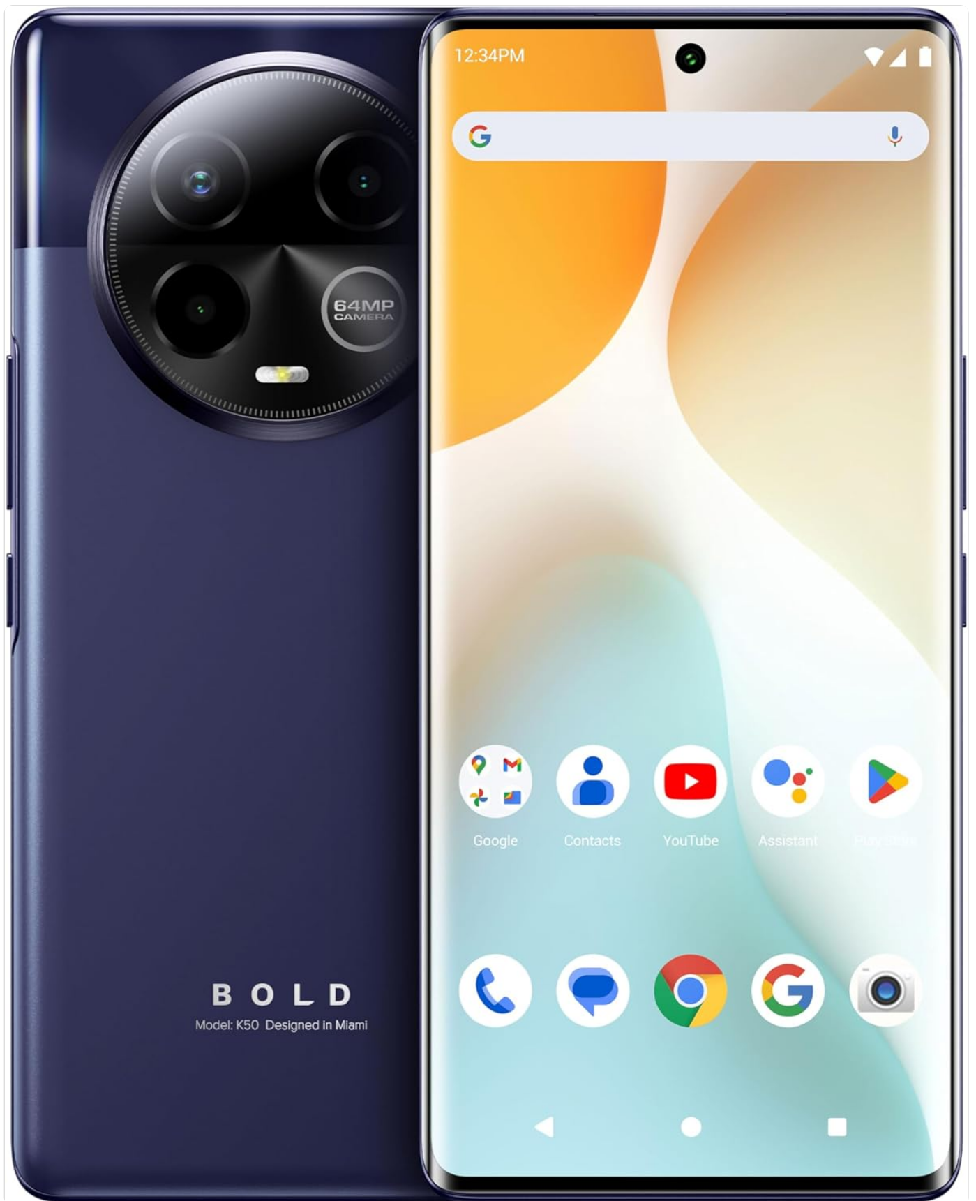
Figure 3.1: Front and rear view of the BLU Bold K50.