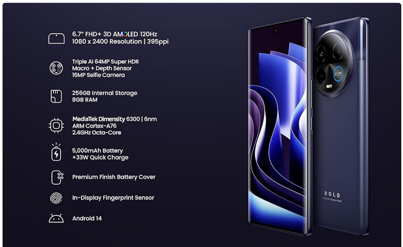
Figure 5.1: The 6.7" FHD+ 3D AMOLED 120Hz display.