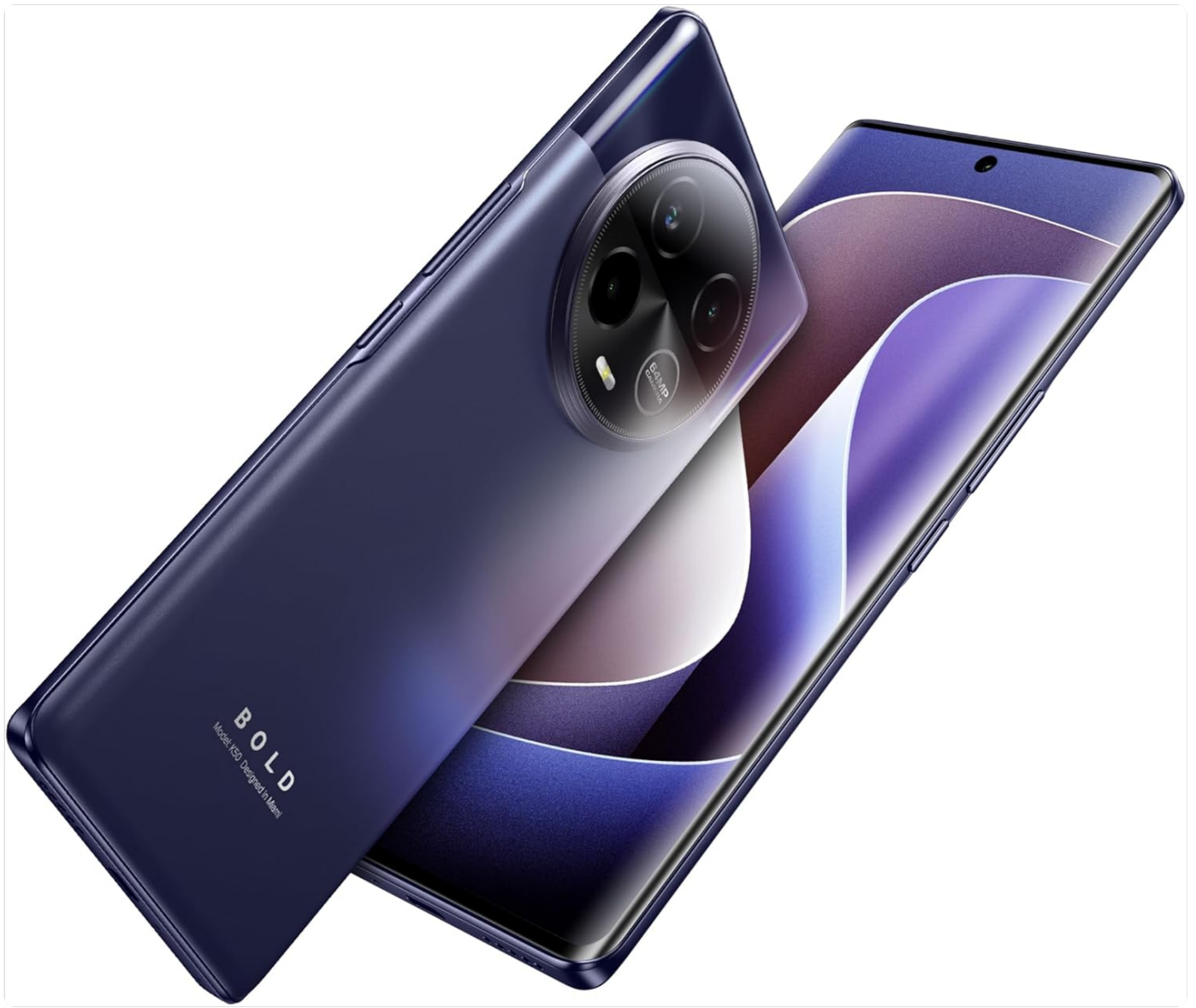
Figure 3.2: Angled view of the BLU Bold K50, emphasizing the design.