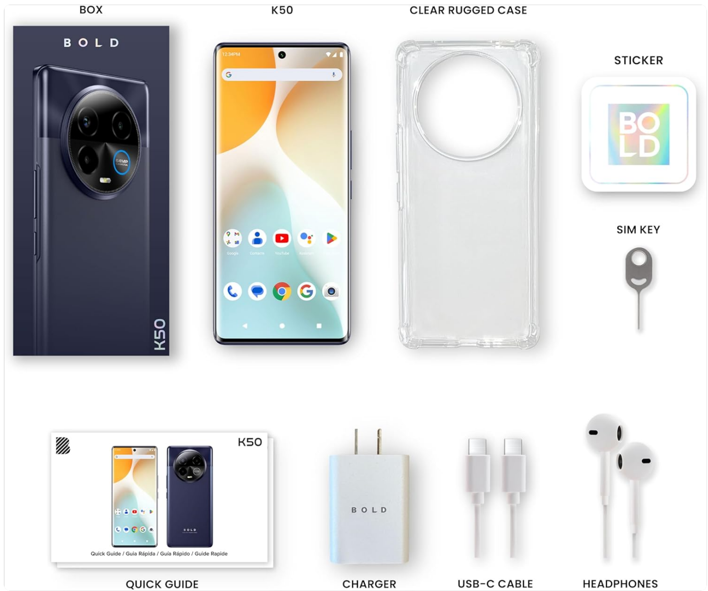
Figure 2.1: Included accessories and phone in the BLU Bold K50 retail box.