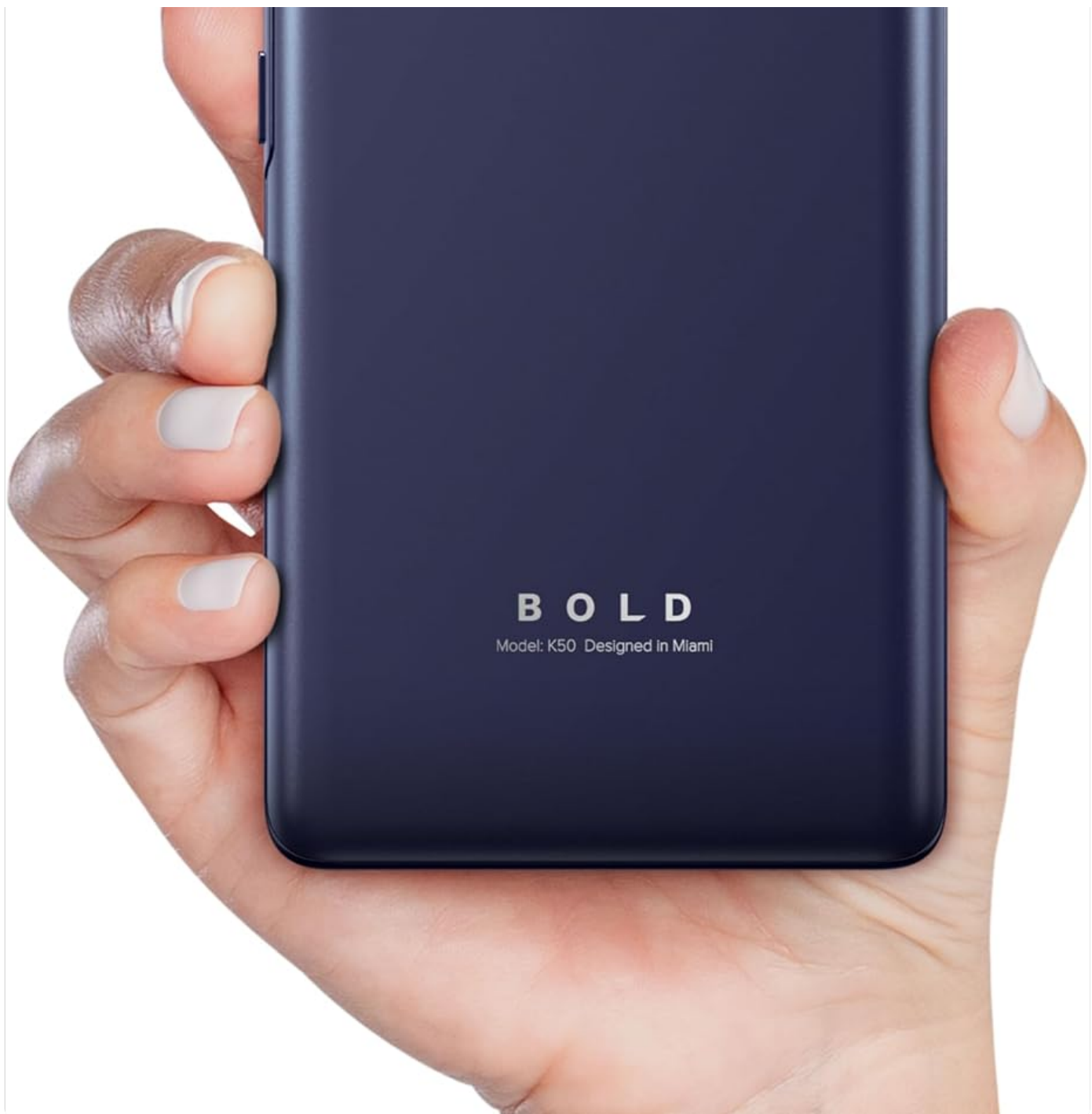
Figure 3.3: Ergonomics of the BLU Bold K50 in hand.