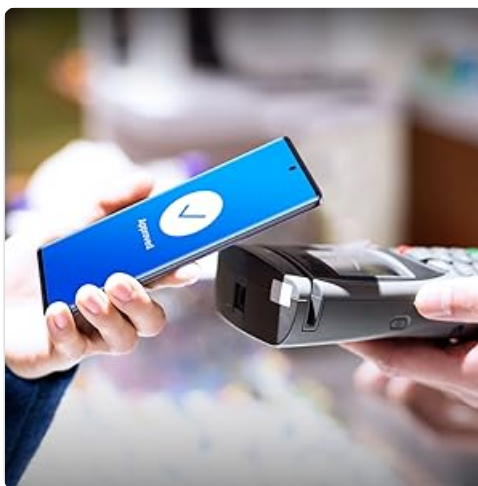
Figure 5.4: NFC functionality for seamless connections.