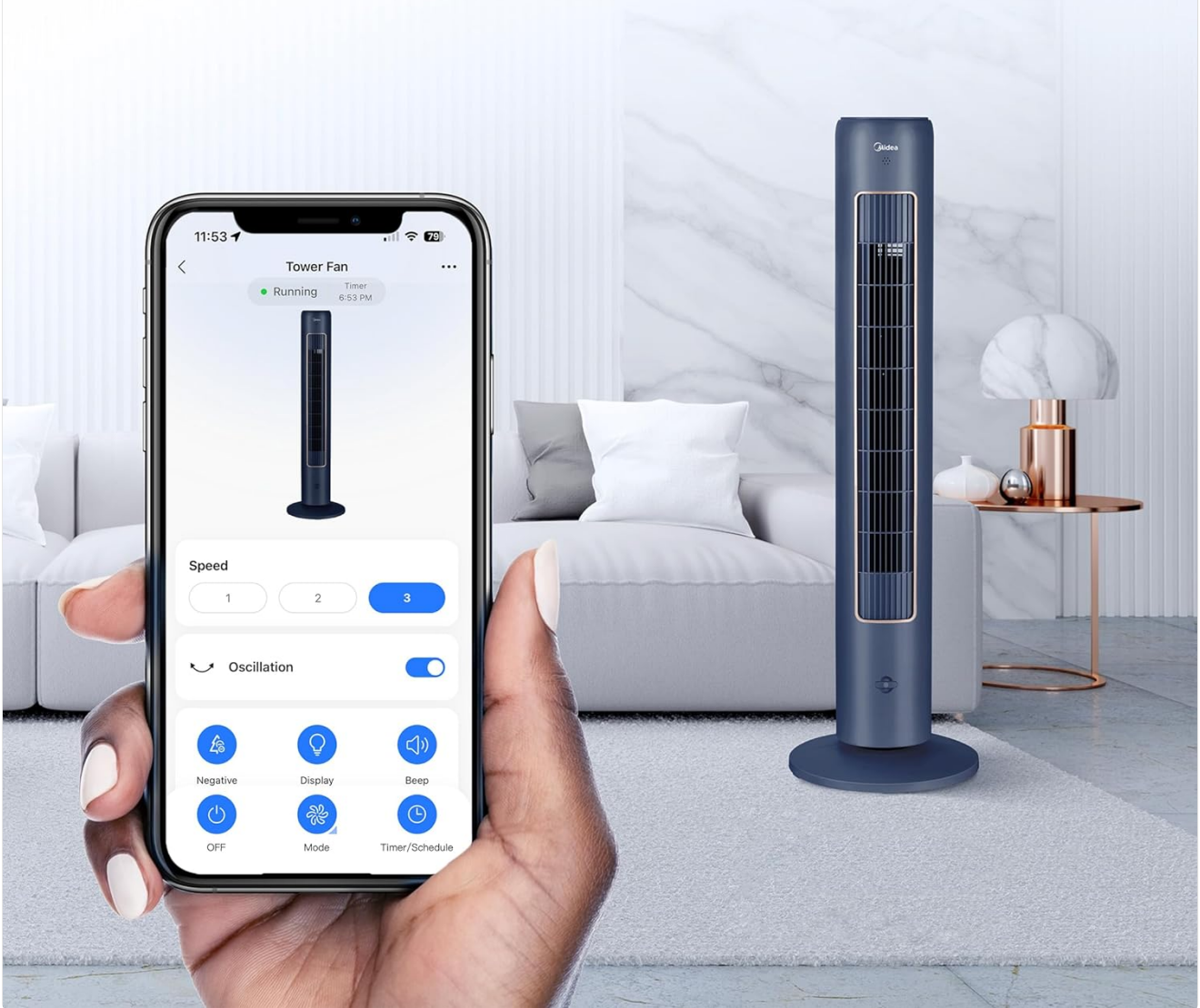
This image illustrates the Midea Tower Fan's smart control capabilities, featuring a smartphone displaying the control app interface alongside logos for Alexa, Google Home, and IFTTT, indicating voice and app control options.