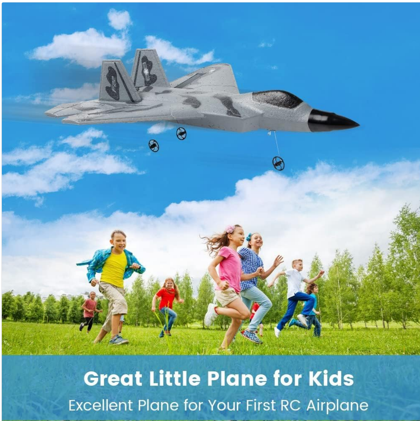
Figure 7: The F22 Raptor RC plane is an excellent choice for a child's first RC airplane, suitable for open outdoor spaces.