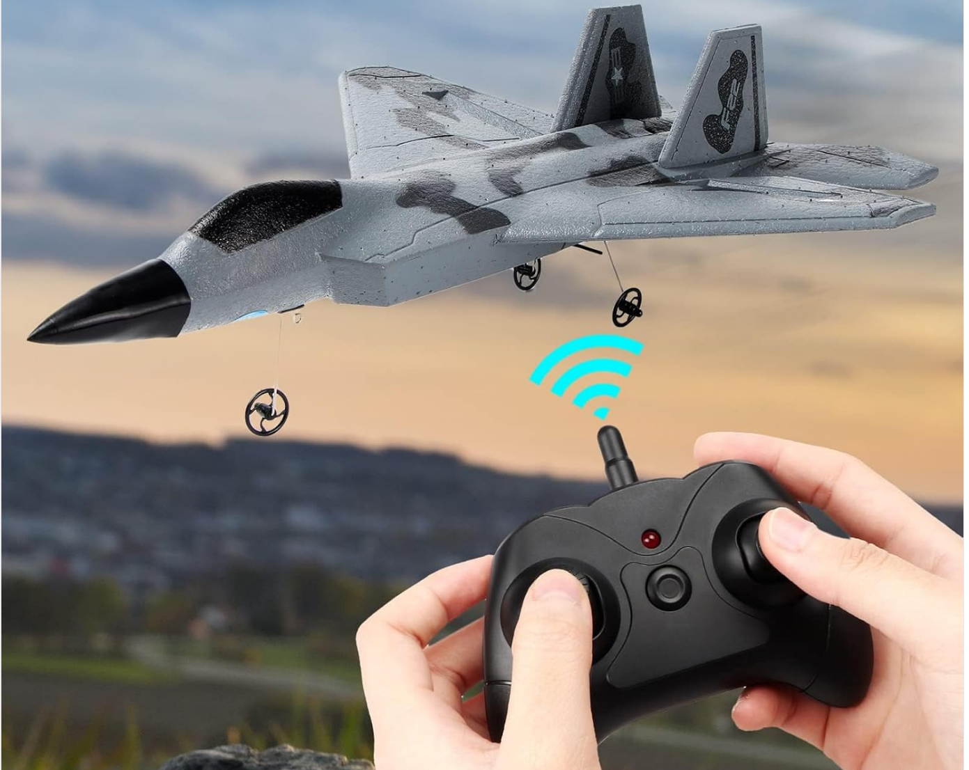
Figure 3: The 2.4GHz 2-channel remote control system in action, demonstrating ease of flight for beginners.

Easy to fly even if you have never flown a model before