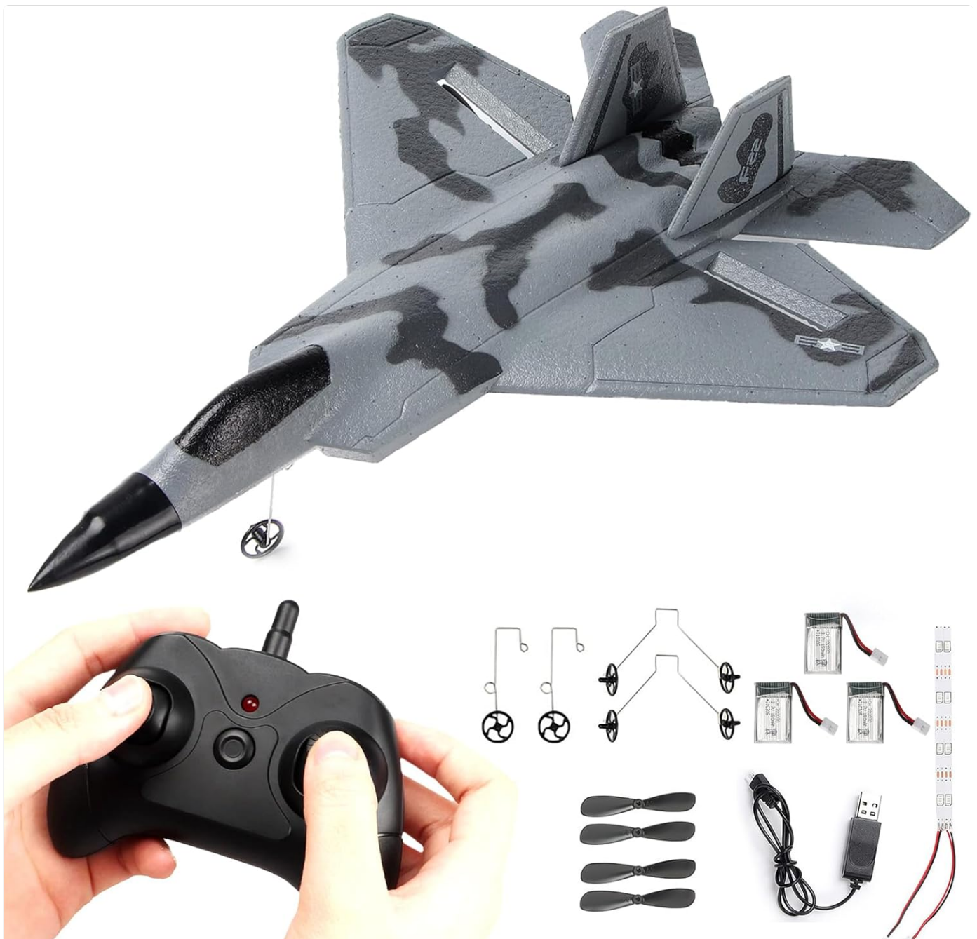
Figure 2: The F22 Raptor RC plane and its remote control, illustrating the components involved in the setup process.