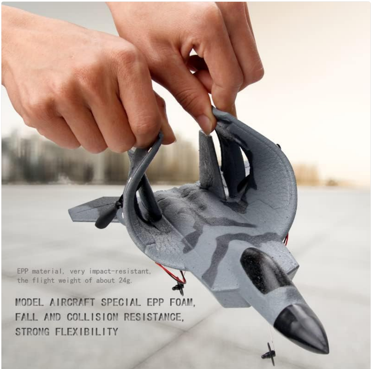
Figure 5: The durable and flexible EPP foam material used in the F22 Raptor RC plane, designed for impact resistance.