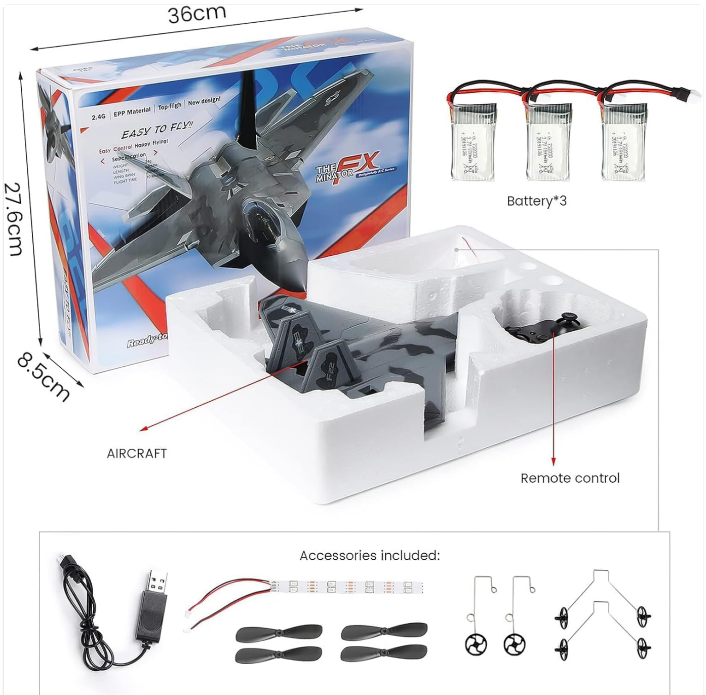
Figure 1: All components included in the BEHORSE F22 Raptor RC Plane package, including the plane, remote control, batteries, propellers, USB charging cable, landing gear, and LED light strip.