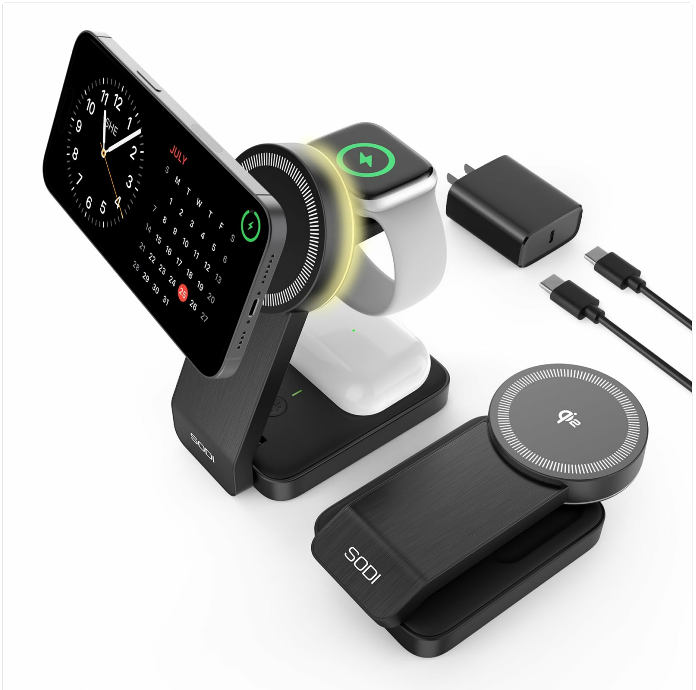
Image: An iPhone charging on the magnetic pad, highlighting the 15W Qi2 fast charging capability and its speed advantage.