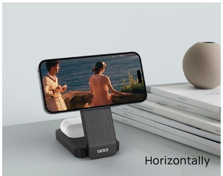
Image: Demonstrates the flexibility of the charging station, allowing a smartphone to be positioned vertically or horizontally with adjustable angles for different viewing needs.