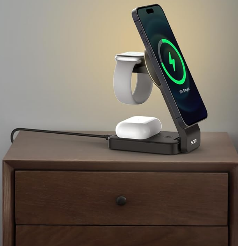
Image: The charging station actively charging an iPhone, Apple Watch, and AirPods, demonstrating its 3-in-1 capability.