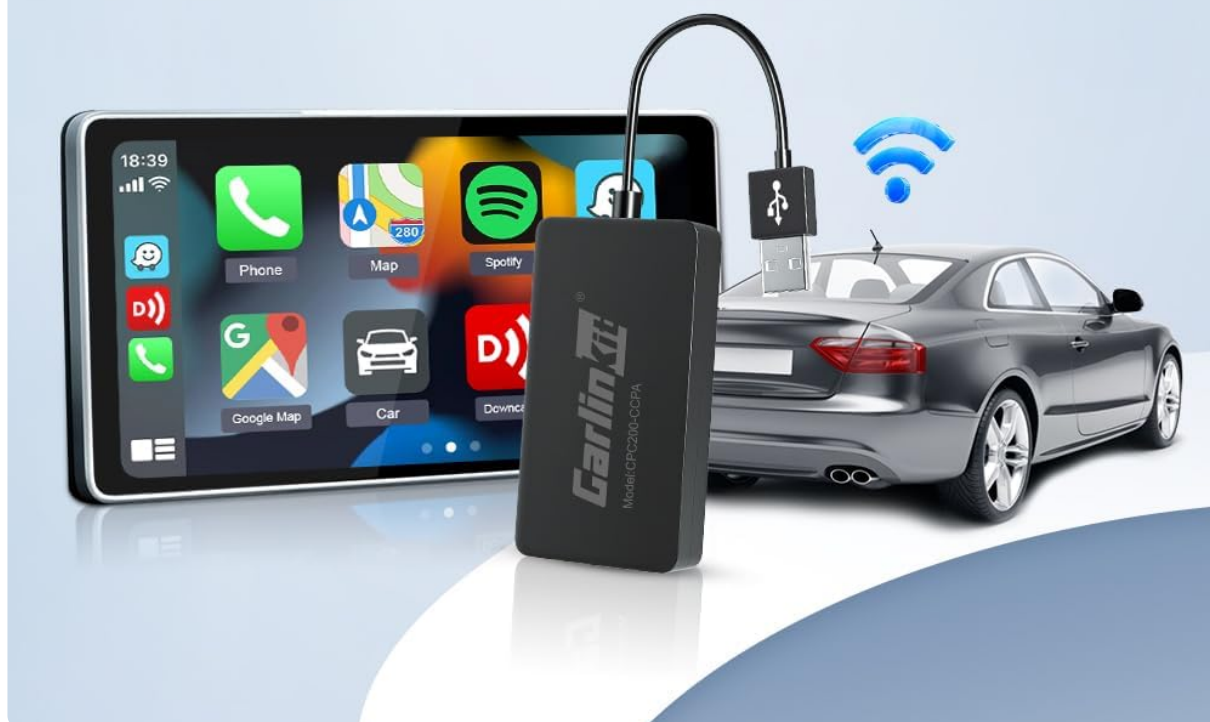
Image: Carlinkit adapter connected and displaying the CarPlay interface.

Newly upgraded USB CarPlay dongle with built-in Autokit APP, plug and play, automatically connects when you get into the car.