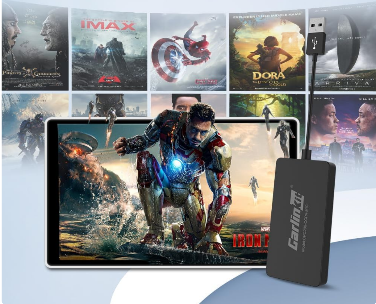
Image: Examples of screen mirroring content.

Massive amount of movies and TVs, Exclusive drive-in theaters Unlimited enjoyment of online videos and movies