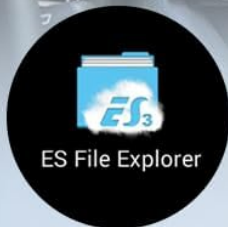
ES File Explorer