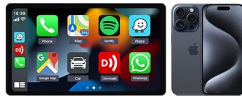
Image: Steps for installing the AutoKit APK on an Android head unit.

Video: Detailed guide on installing the AutoKit APK for the CarlinKit adapter.