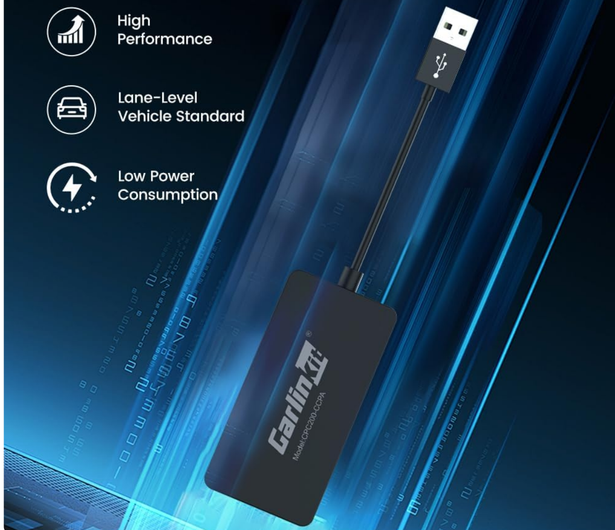
Image: Fast connection features of the CarlinKit adapter.