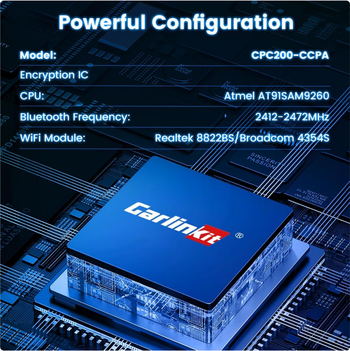
Image: Internal configuration details of the CarlinKit adapter.