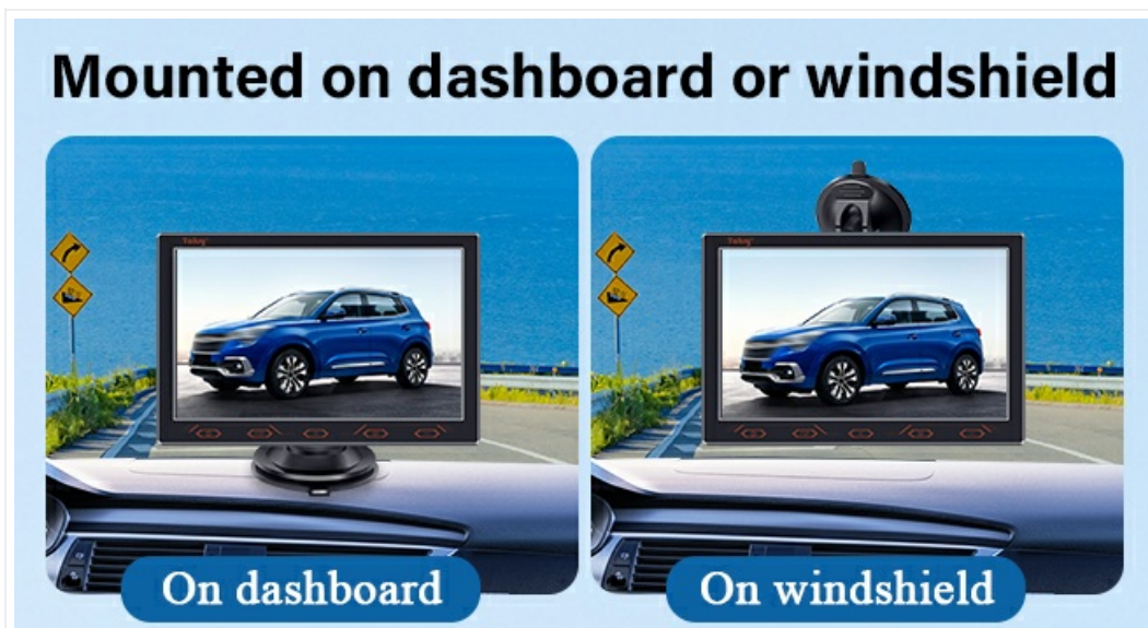
Image: Examples of monitor placement on the dashboard and windshield.