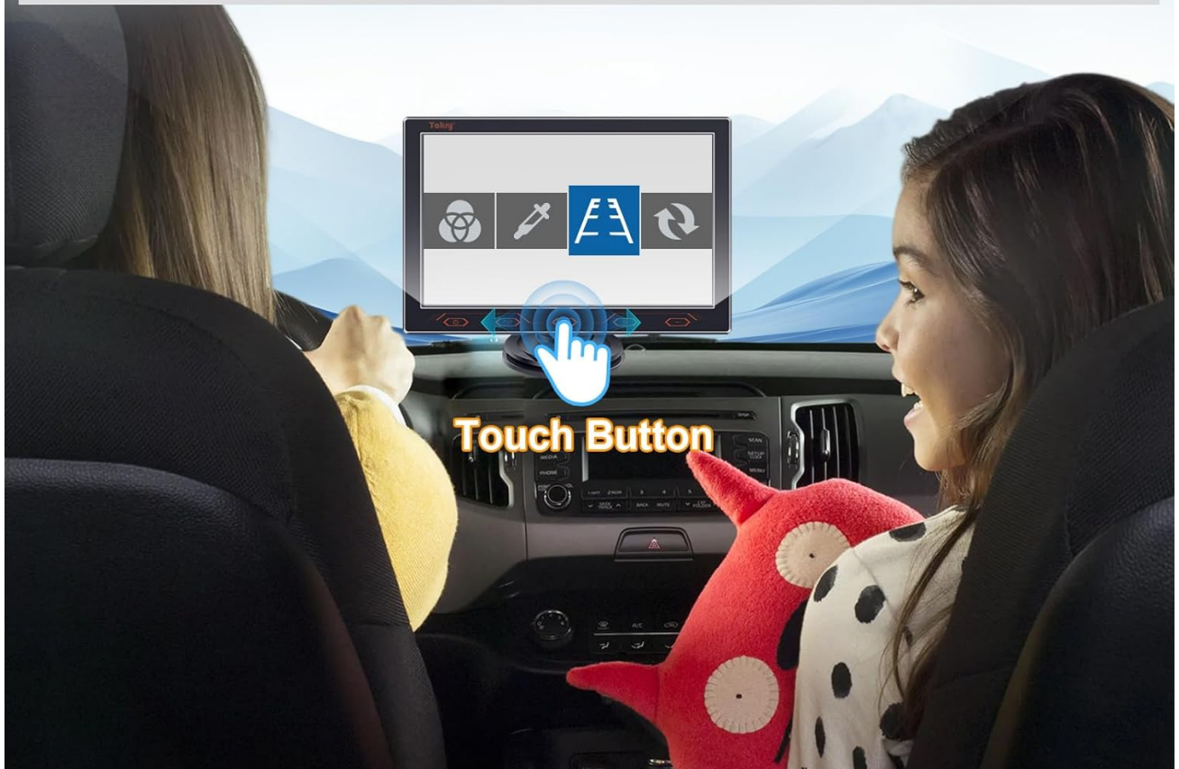
Image: User-friendly touch key interface for monitor settings.