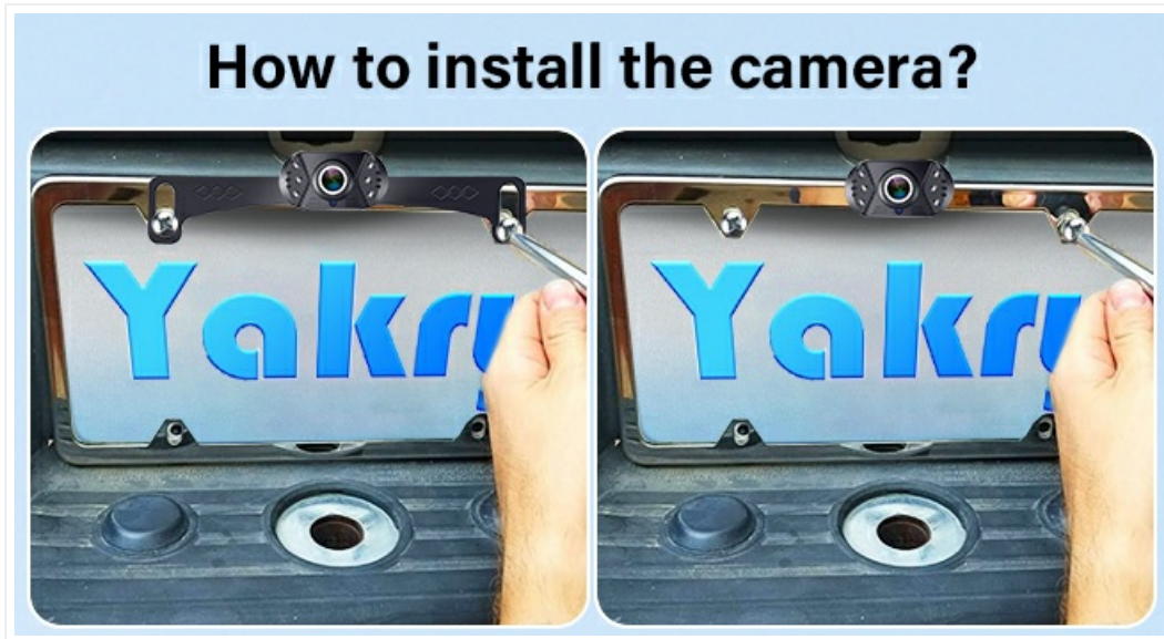
Image: Step-by-step guide for installing the camera with the license plate.