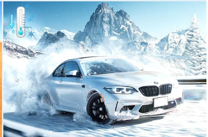
Image: The camera's IP69K waterproof and weather-resistant design.