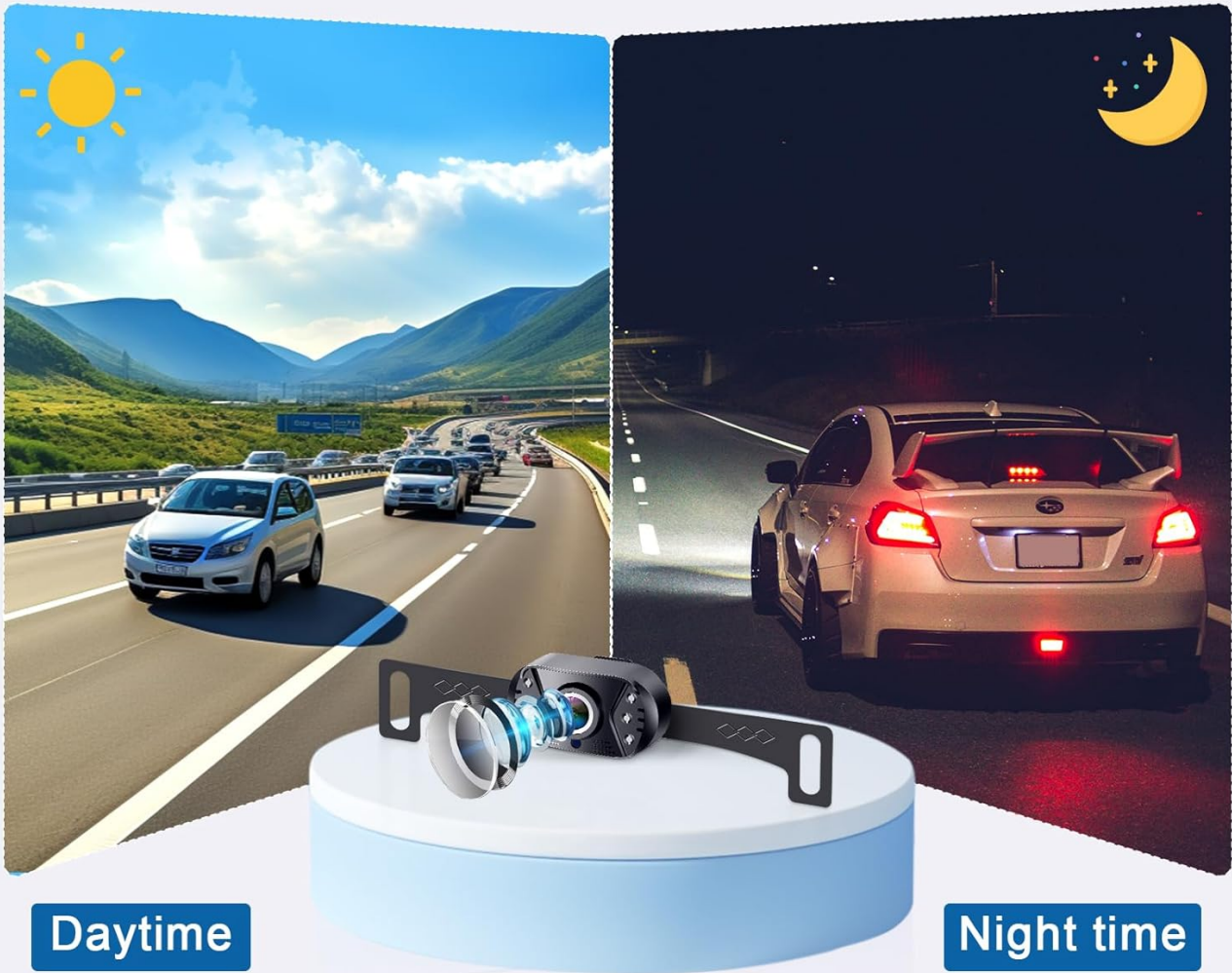
Image: Comparison of daytime and night vision clarity.

Backup camera with latest chip and sensor keep picture clear even when driving at night