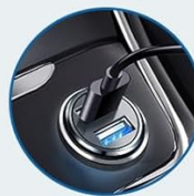
USB Cable Powered