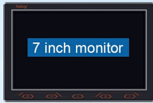
7 inch monitor