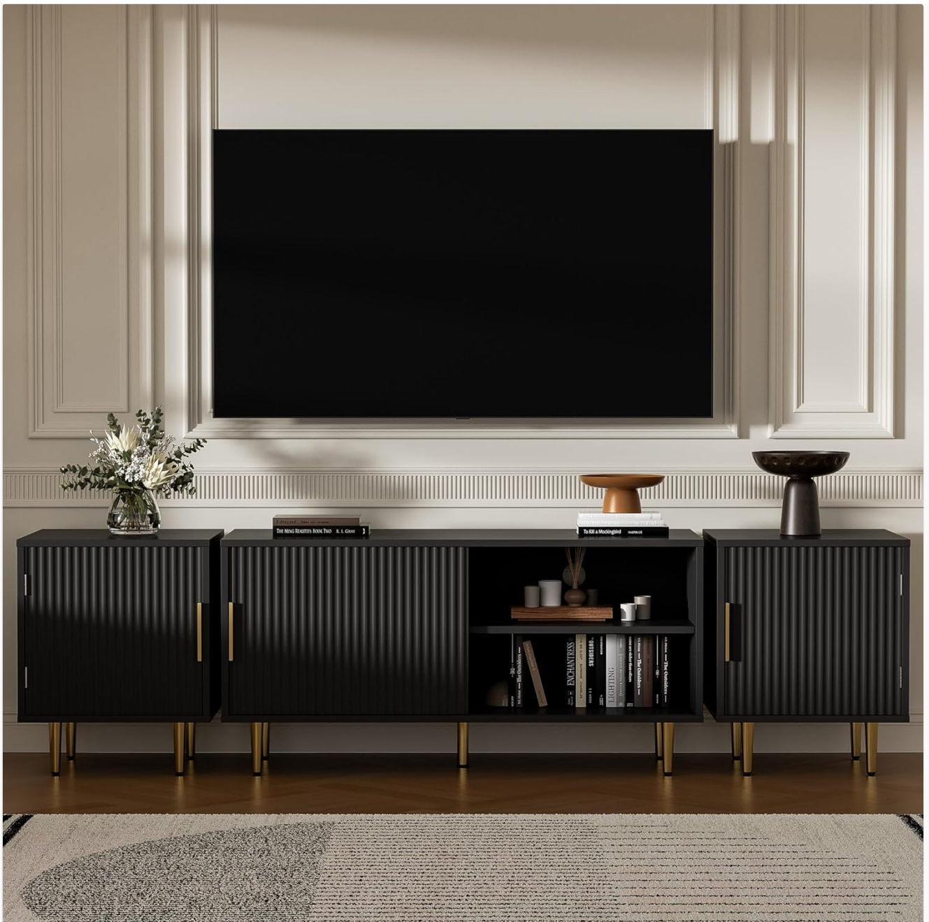
Image 2: The Housoul 71-inch TV Stand configured with its two side cabinets moved away from the central unit, demonstrating their versatility as separate end tables or nightstands. The main unit features a sliding door and open shelving, while the side cabinets have hinged doors, all with golden handles and legs.