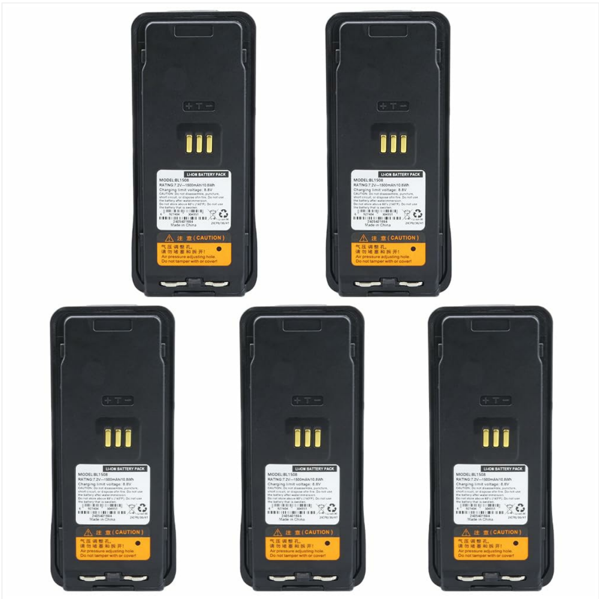
Figure 10.1: Important Notices. This image combines a visual of the battery and a user with a radio, emphasizing critical warnings and recommendations for battery use and purchase.