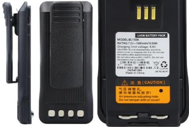
Figure 4.2: Product Dimensions and Weight. This image provides visual measurements for the battery and belt clip, along with the weight per piece.