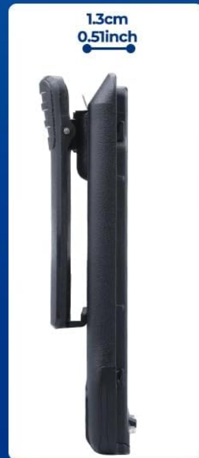
Figure 5.1: Product Details and Installation Components. This image displays various angles of the BL1508 battery and its detachable belt clip, illustrating how the components fit together.