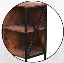
X Shape Metal Frame