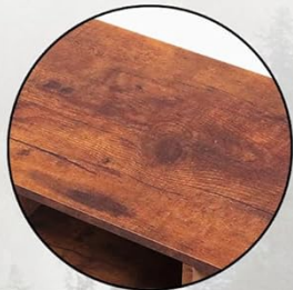
Elegant&High Quality Wood Grain