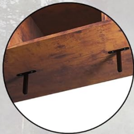
Attached Bottom Support Legs