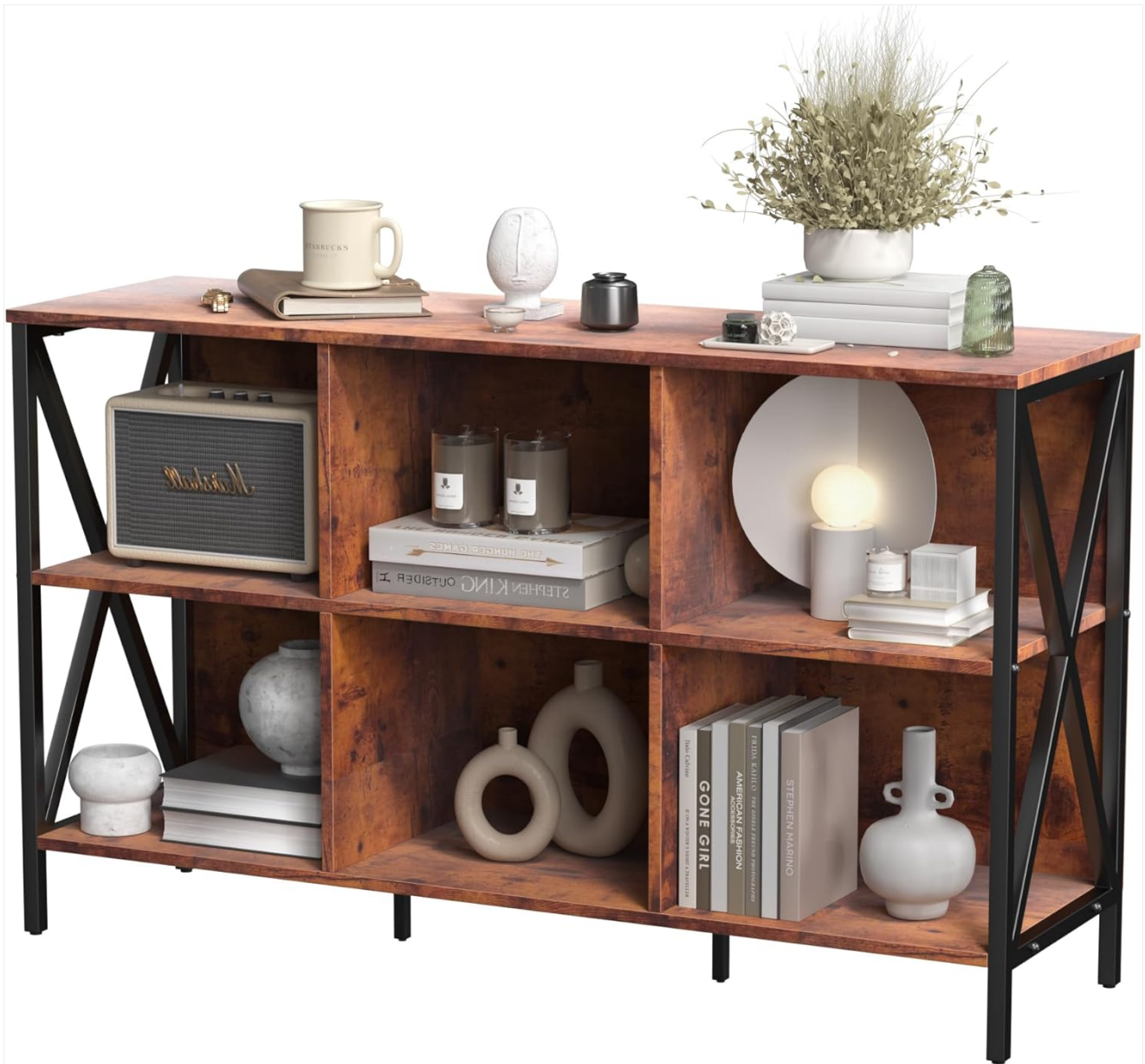
Figure 1: The Adompacat Horizontal Bookshelf Cube Storage Organizer, showcasing its design and storage capabilities.