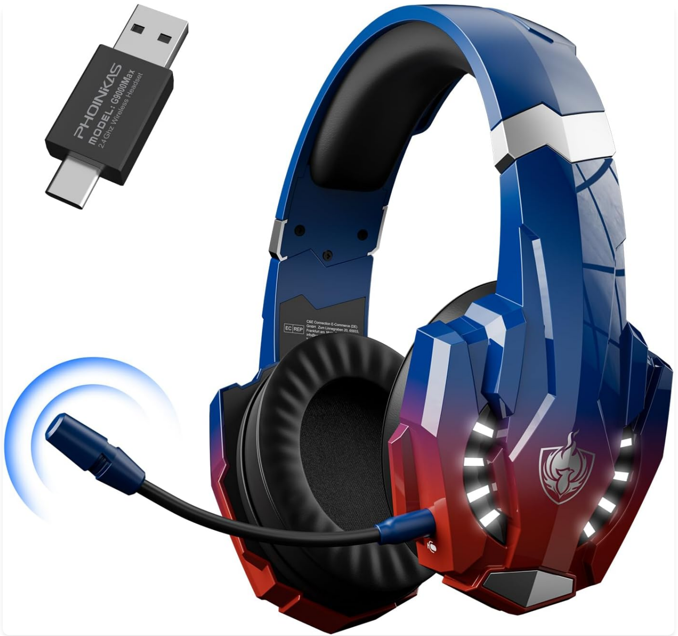
Figure 1: PHOINIKAS 2.4GHz Wireless Gaming Headset (Dazzle Blue)