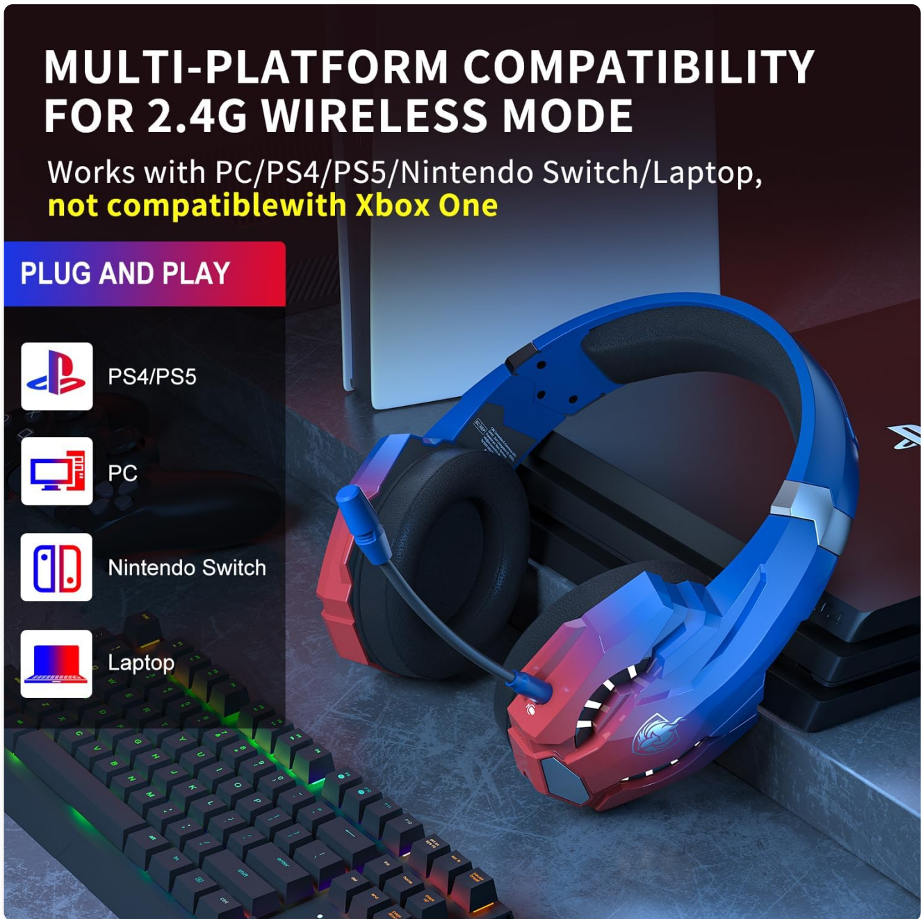
Figure 2: Multi-Platform Compatibility in 2.4GHz Wireless Mode