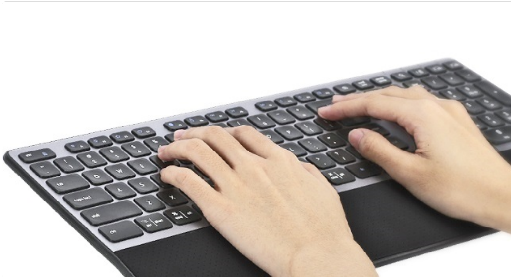
Figure 5: Keys for adjusting backlight intensity.

The keyboard includes a range of function keys (F1-F12) that perform various tasks, often in combination with the 'Fn' key. Refer to the table below for common functions: