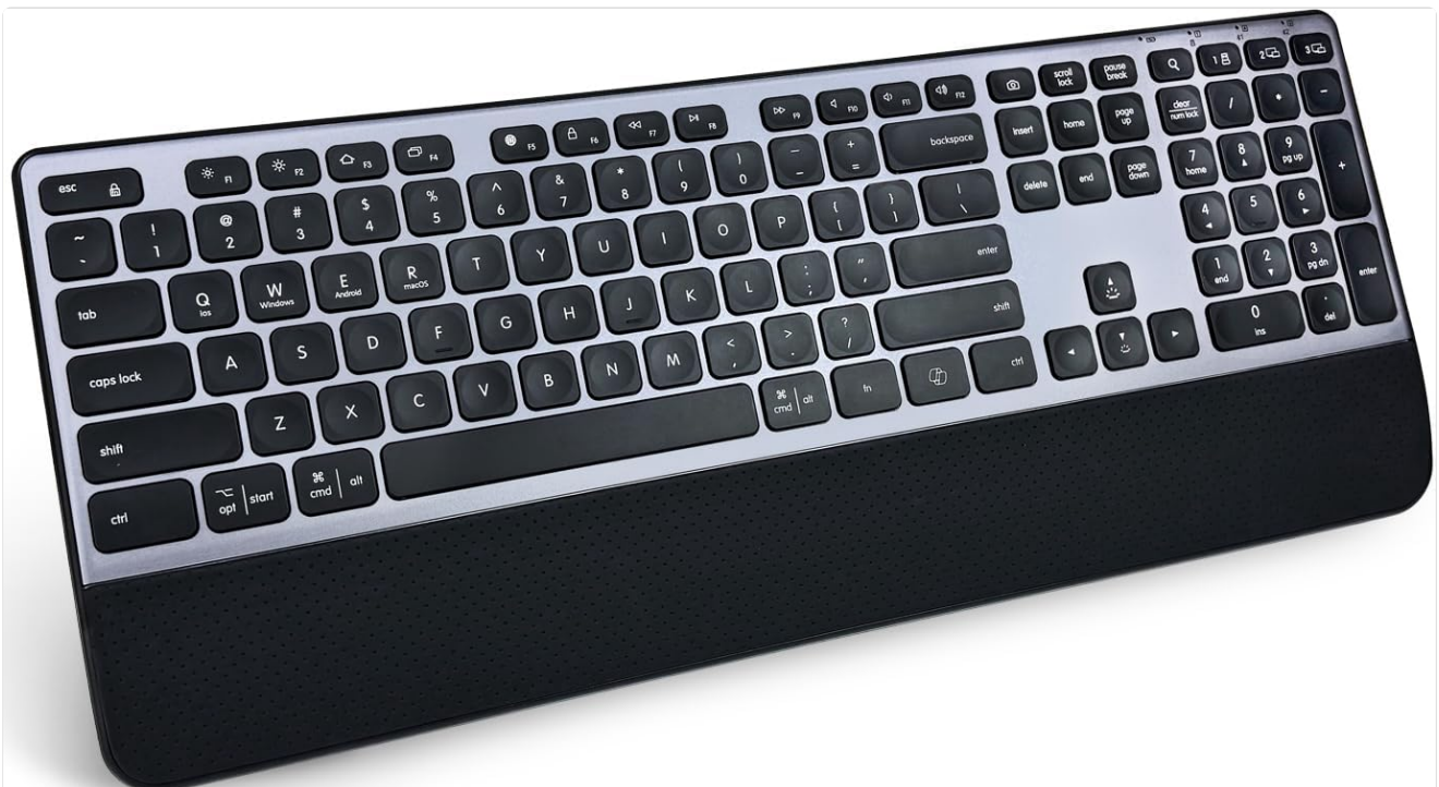
Figure 1: Top view of the CITLLA K9100 Wireless Bluetooth Keyboard.

The CITLLA K9100 is a full-size wireless Bluetooth keyboard designed for multi-device compatibility, featuring a comfortable wrist rest, 3-level adjustable backlighting, and a numeric keypad. It is rechargeable and built with quiet scissor-switch keys for an enhanced typing experience.