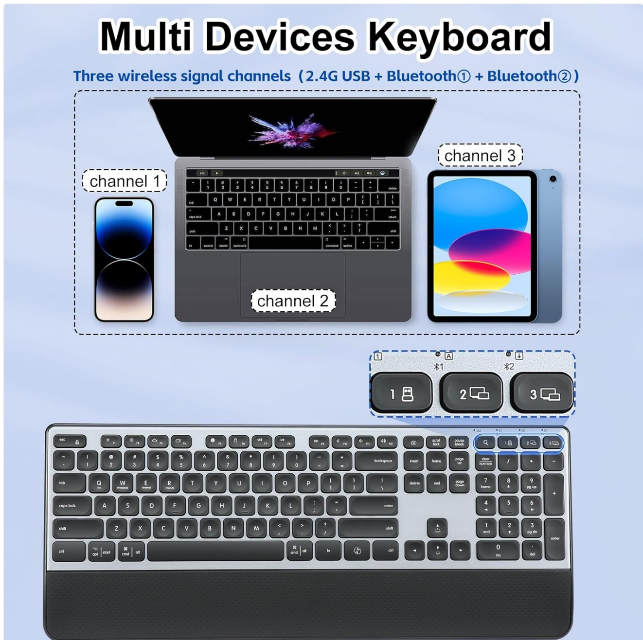
Figure 3: Illustrates the three wireless connection channels (2.4G USB, Bluetooth 1, Bluetooth 2) for connecting to various devices.

Similar to Bluetooth 1, press and hold the Bluetooth 2 key (often labeled with a Bluetooth icon or '2') for 3-5 seconds. Connect to "BT Keyboard" from your second device's Bluetooth settings.