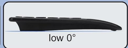
Figure 4: The keyboard's 3-level adjustable stand for ergonomic comfort.