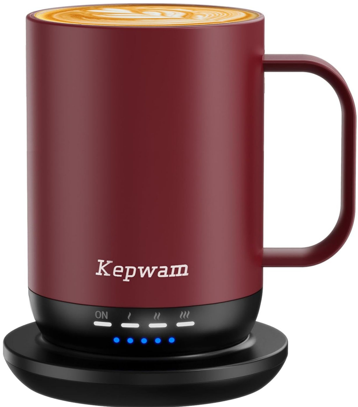
Image: Kerpwam Self Heating Coffee Mug T1-16oz in Burgundy on its charging coaster.