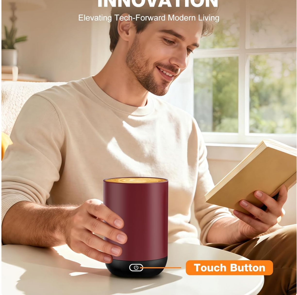
Image: Dual control modes for the Kepam mug, illustrating both manual button operation and smartphone app control.