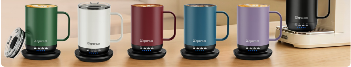
Image: Unboxing the Kepwam Self Heating Coffee Mug, showing the mug, lid, and charging coaster.