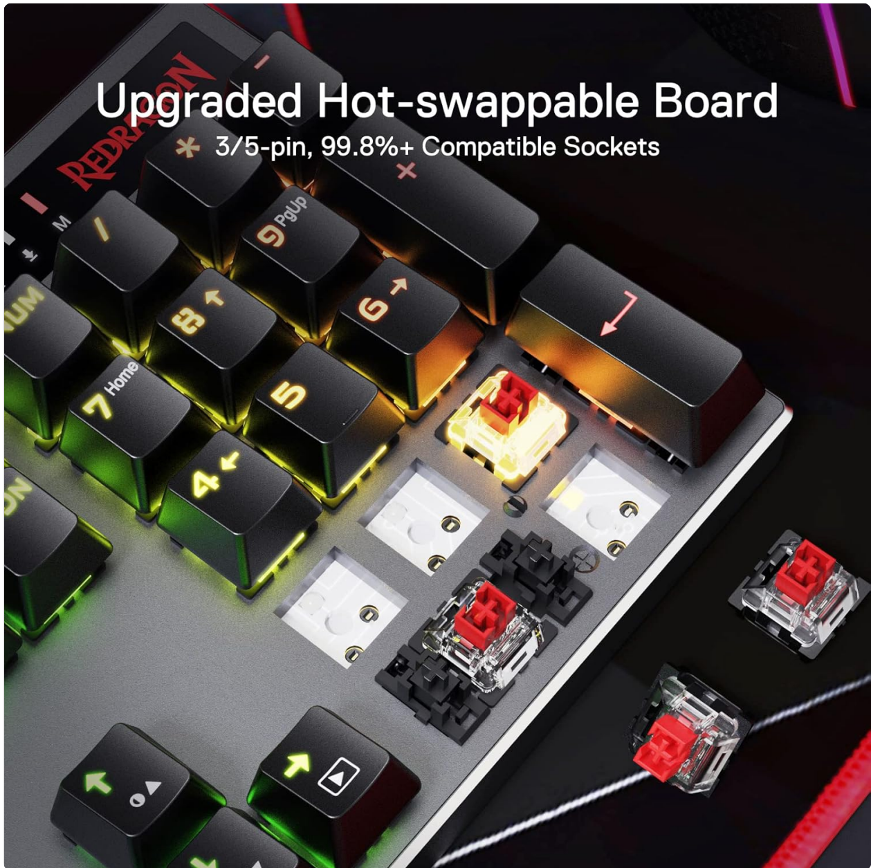
Image: Close-up view of the Redragon K556 PRO keyboard's hot-swappable sockets, showing switches being inserted and removed.