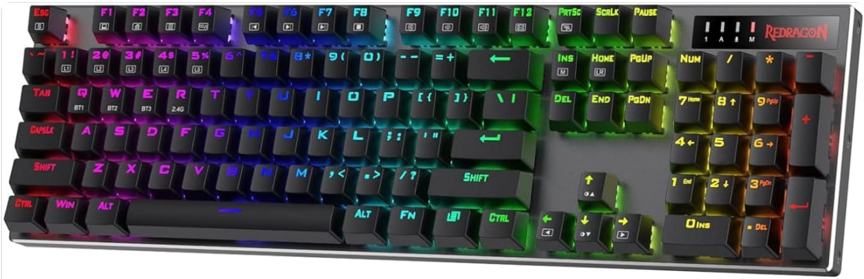
Image: The Redragon K556 PRO Gaming Keyboard and M724 Mouse, showing both devices included in the package.