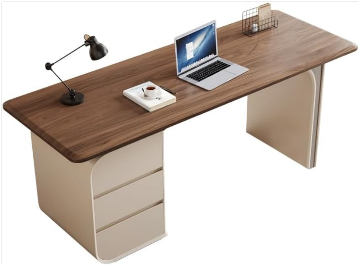
Figure 2.1: Overview of the LITFAD Modern Office Desk.