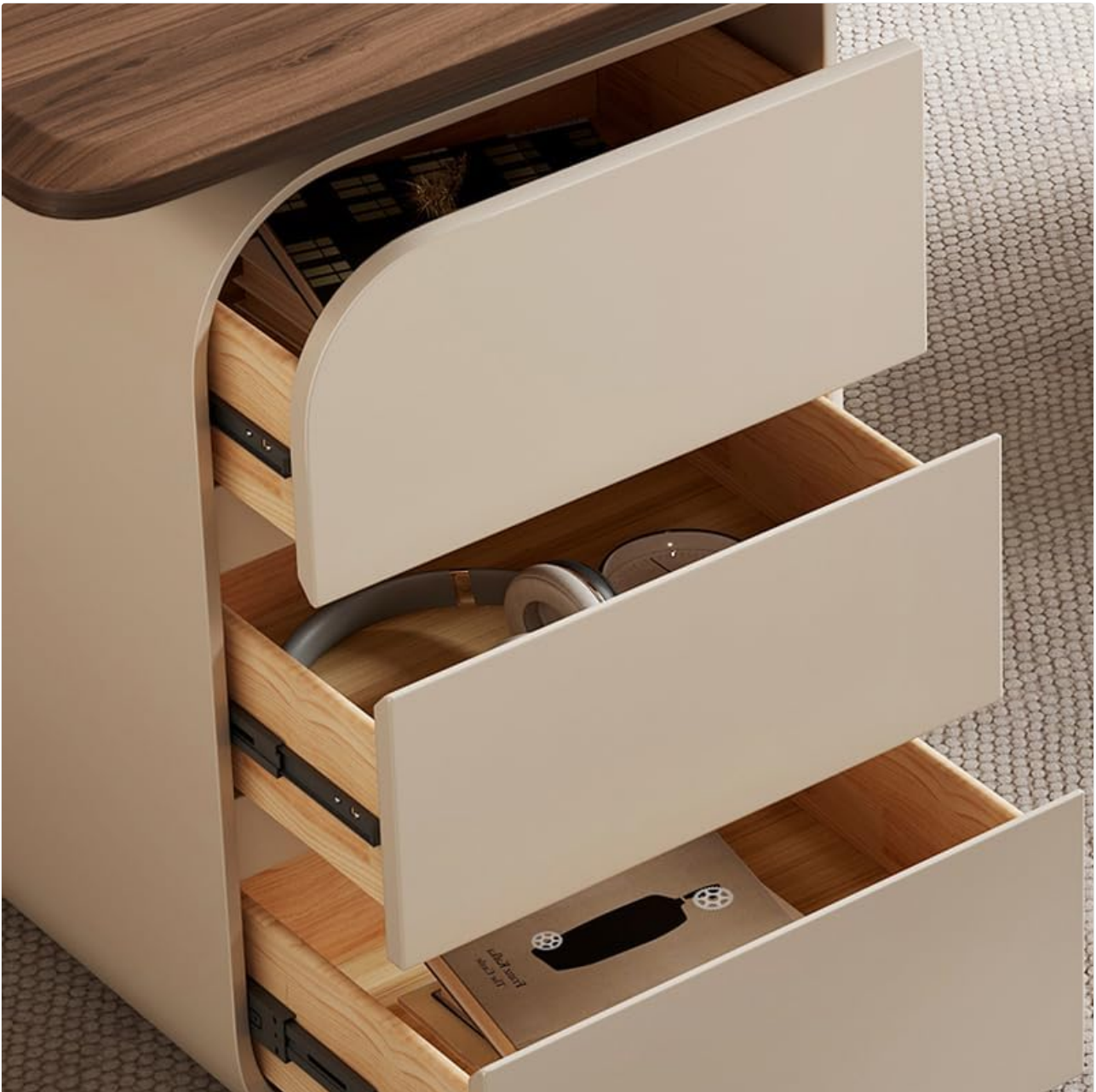
Figure 5.2: Detail of the drawer construction and smooth operation.