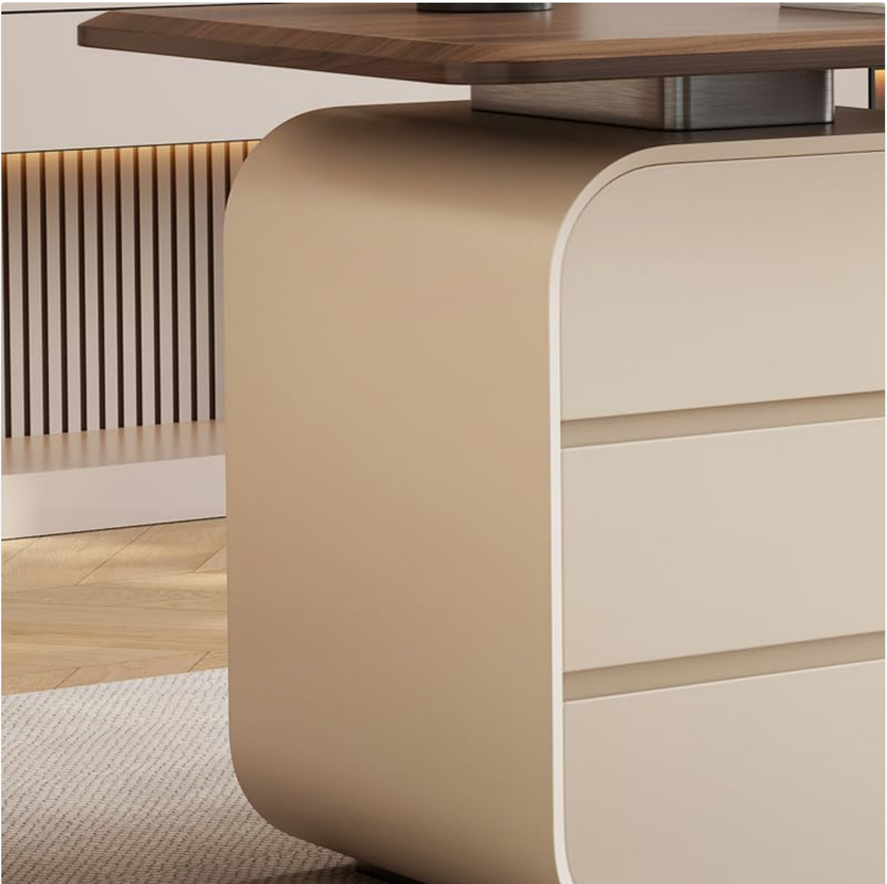
Figure 4.2: Detail of the desk's sturdy pedestal base and support leg.