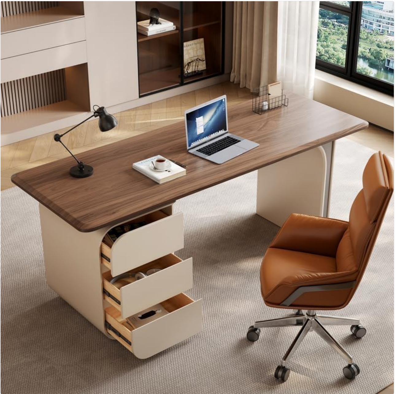
Figure 5.1: The three spacious drawers provide convenient storage.