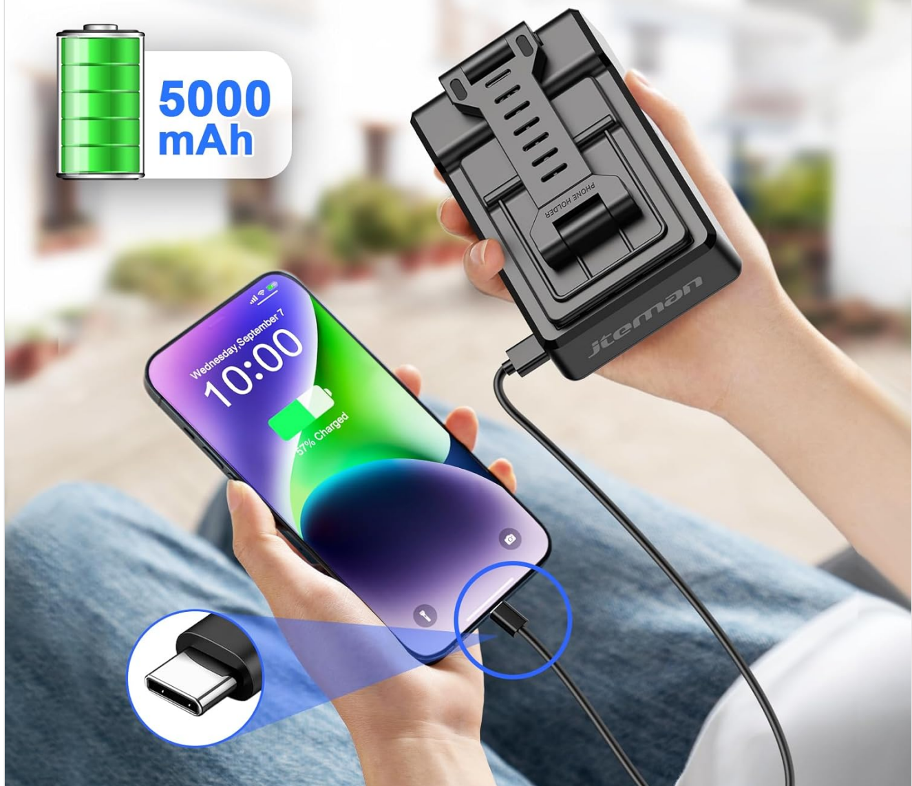
Figure 4.3: Demonstrates the power bank feature, allowing you to charge your phone while it's on the stand.