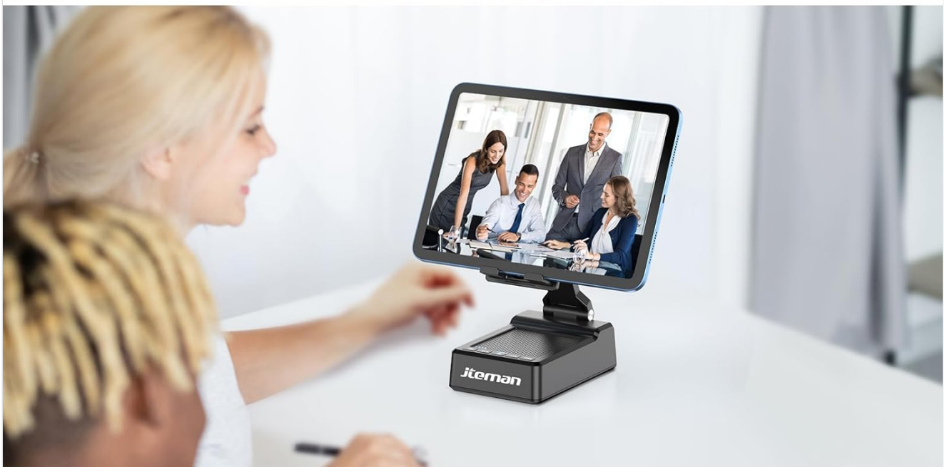
Figure 4.2: The stand provides a hands-free solution for using your phone or tablet on a desk.