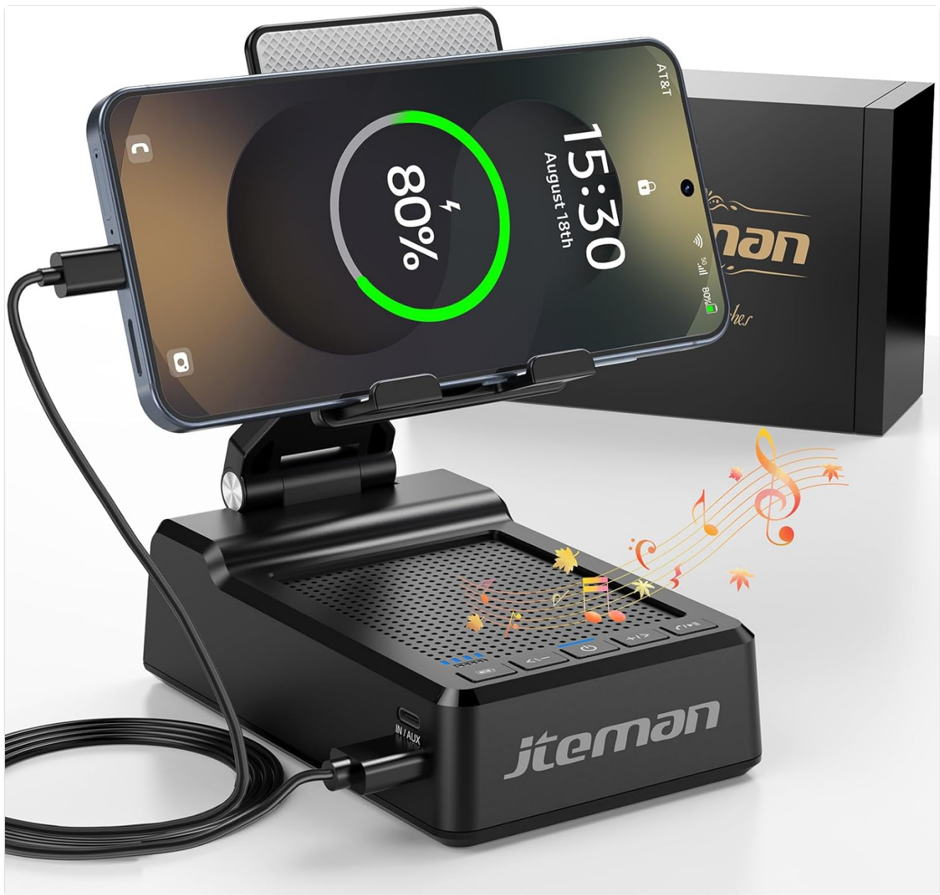
Figure 1.1: The JTEMAN 3-in-1 Cell Phone Stand, showcasing its primary functions as a phone holder, speaker, and charging device.