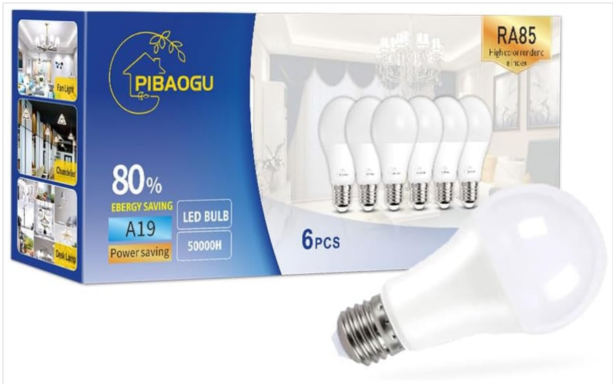
Image: PIBAOGU A19 LED Light Bulb and its packaging, illustrating the product in a 6-pack configuration.