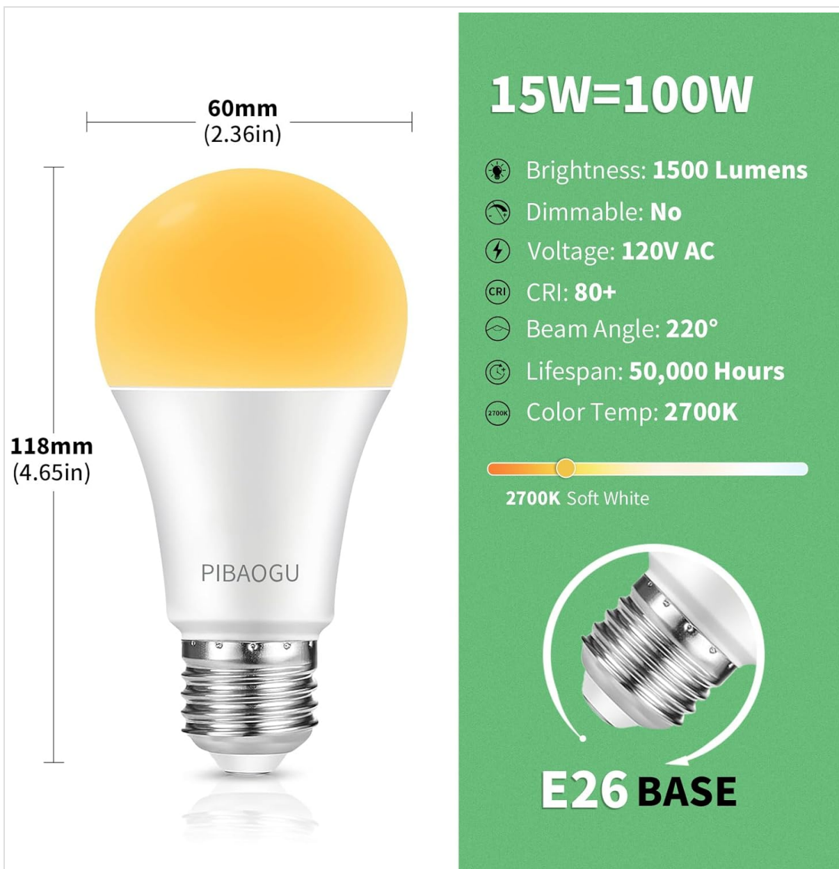
Image: Detailed view of the PIBAOGU A19 LED bulb showing its dimensions (118mm height, 60mm width) and key specifications such as 15W power, 1500 lumens, non-dimmable, 120V AC, CRI 80+, 50,000 hours lifespan, 2700K soft white color temperature, and E26 base.