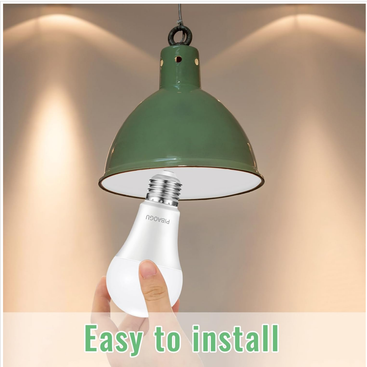
Image: A hand demonstrating the easy installation process of screwing a PIBAOGU A19 LED light bulb into a pendant light fixture.