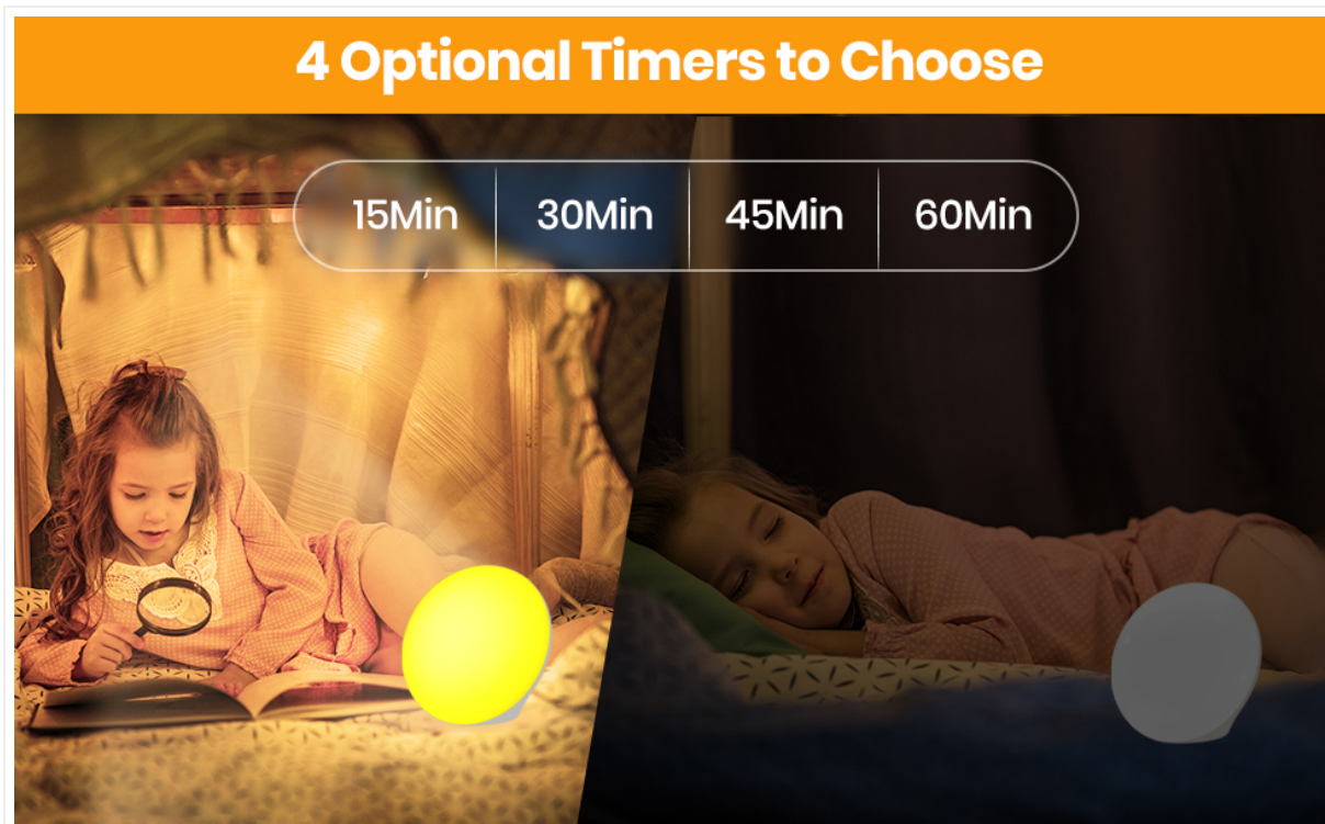
Figure 5: Illustration of the timer function, allowing the lamp to operate for set durations.

Short press the Timer Button ( ) to select a desired operating duration. The available timer settings are 15, 30, 45, and 60 minutes. The lamp will automatically turn off once the set time has elapsed.