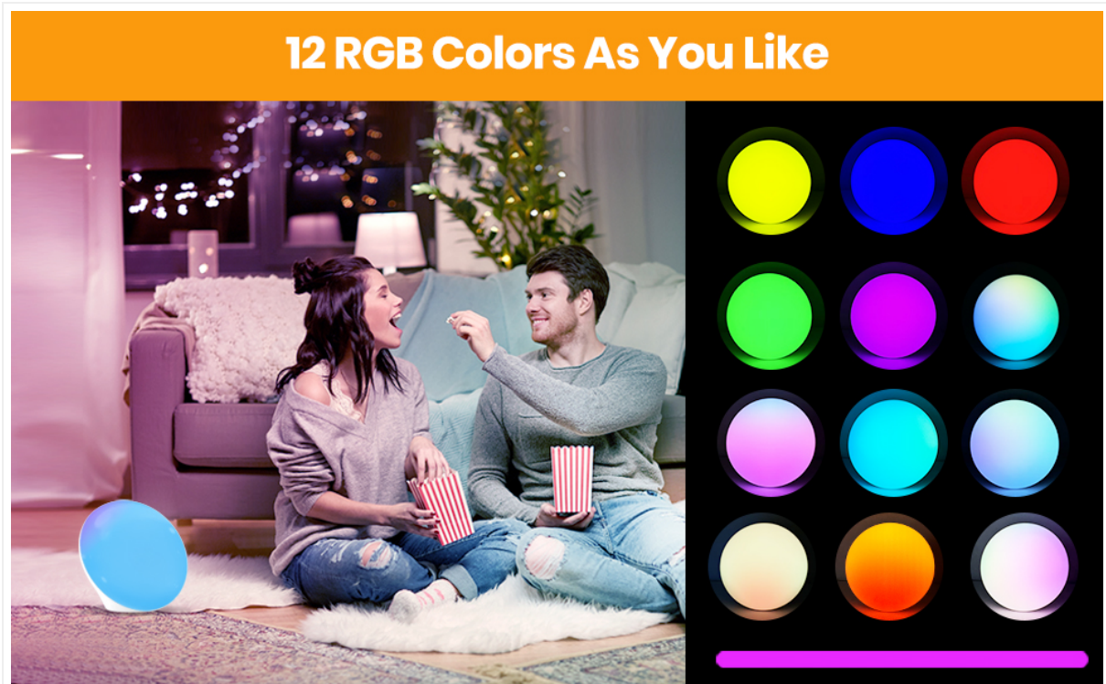
Figure 4: Display of the various color temperature and RGB color options available.