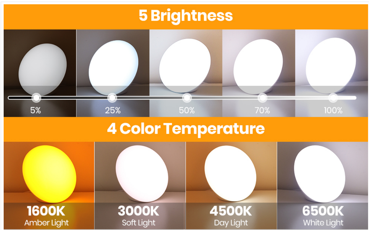
Figure 3: Visual representation of the five brightness settings available on the sun lamp.