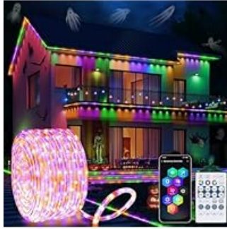
Image: A detailed view of the wireless RF remote control, highlighting its various buttons and functions for easy operation.

Note: Before first use, remove the plastic insulation sheet from the remote control's battery compartment.