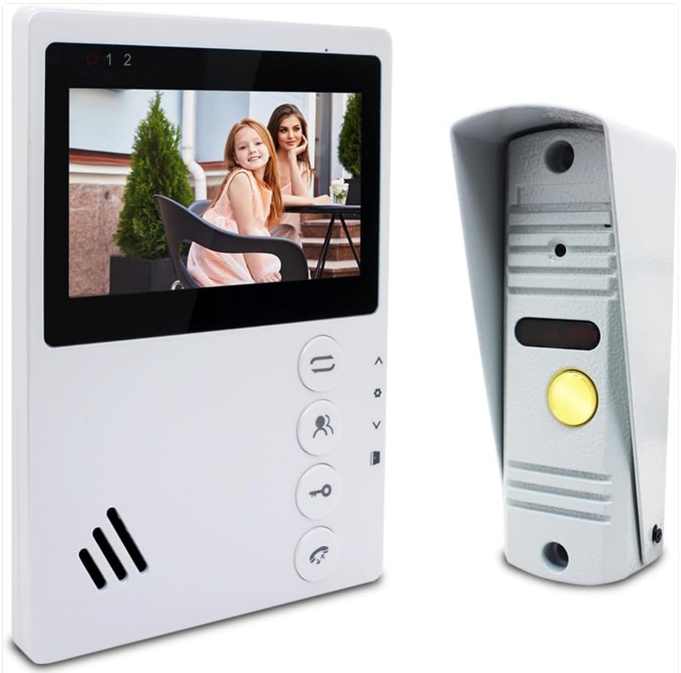
Image: The ANJIELO SMART Wired Video Intercom System, showing both the indoor monitor and the outdoor doorbell unit.