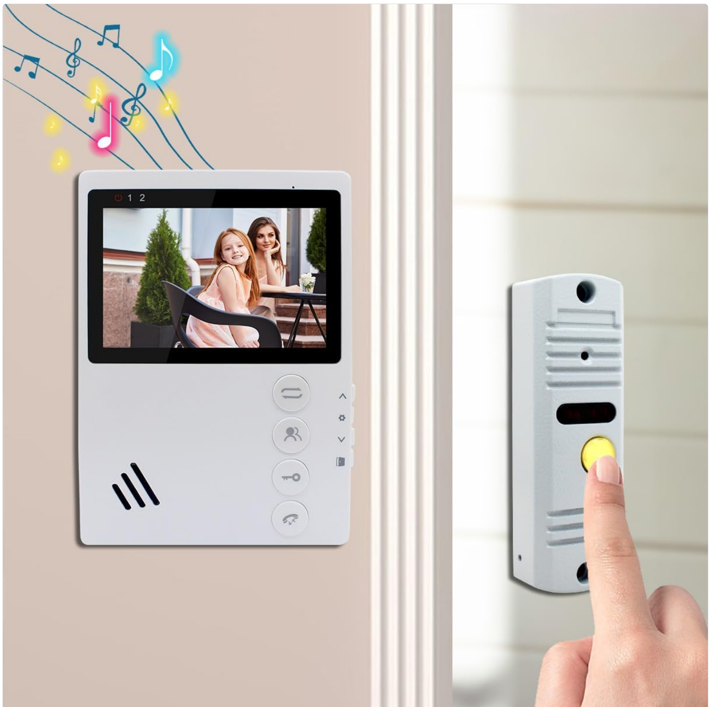
Image: The indoor monitor displaying a visitor and an arrow pointing to the "Door Unlock" button, indicating the one-key unlock feature.