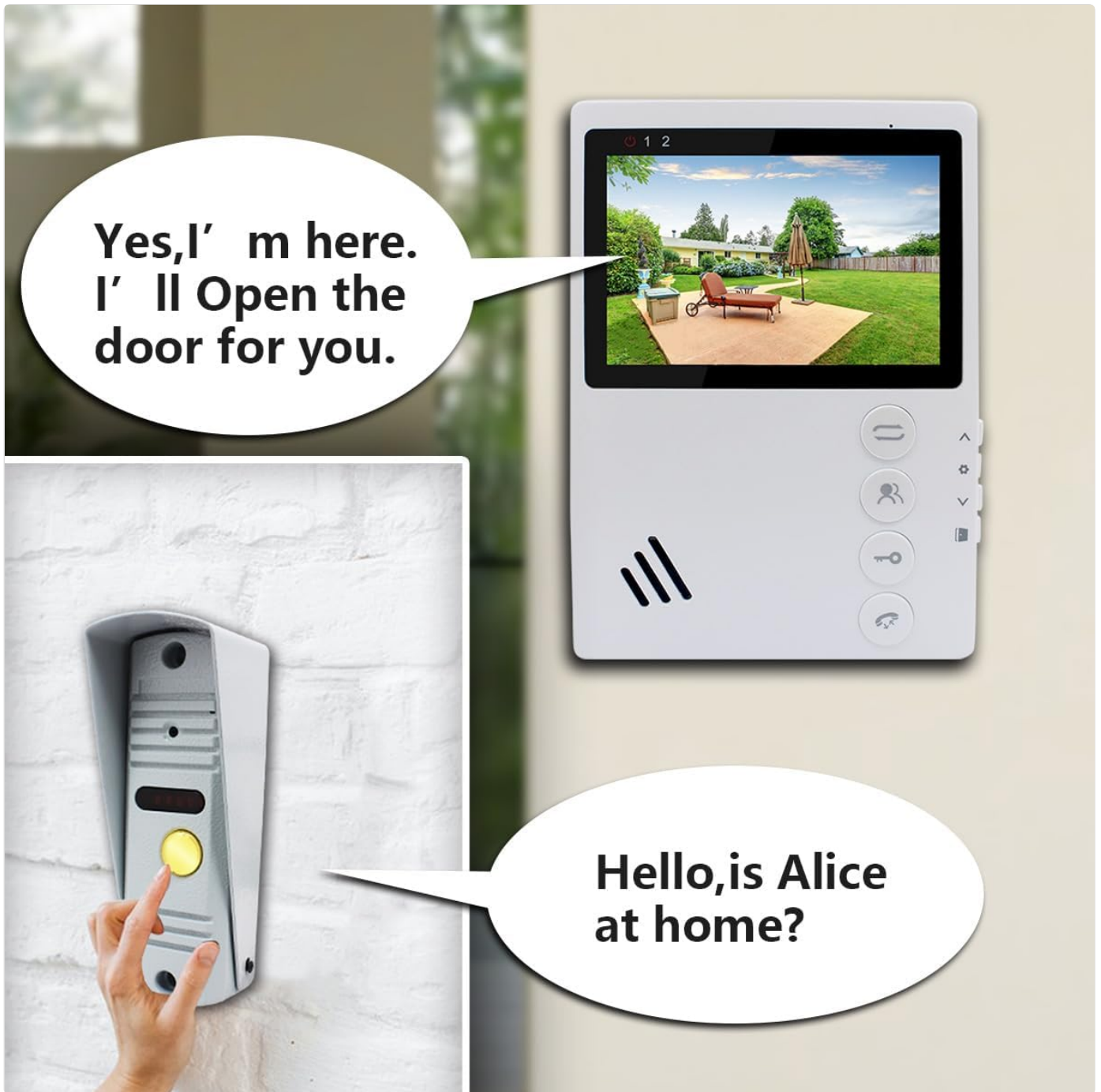
Image: A visual representation of two-way audio communication between a visitor at the doorbell and a person inside using the monitor.