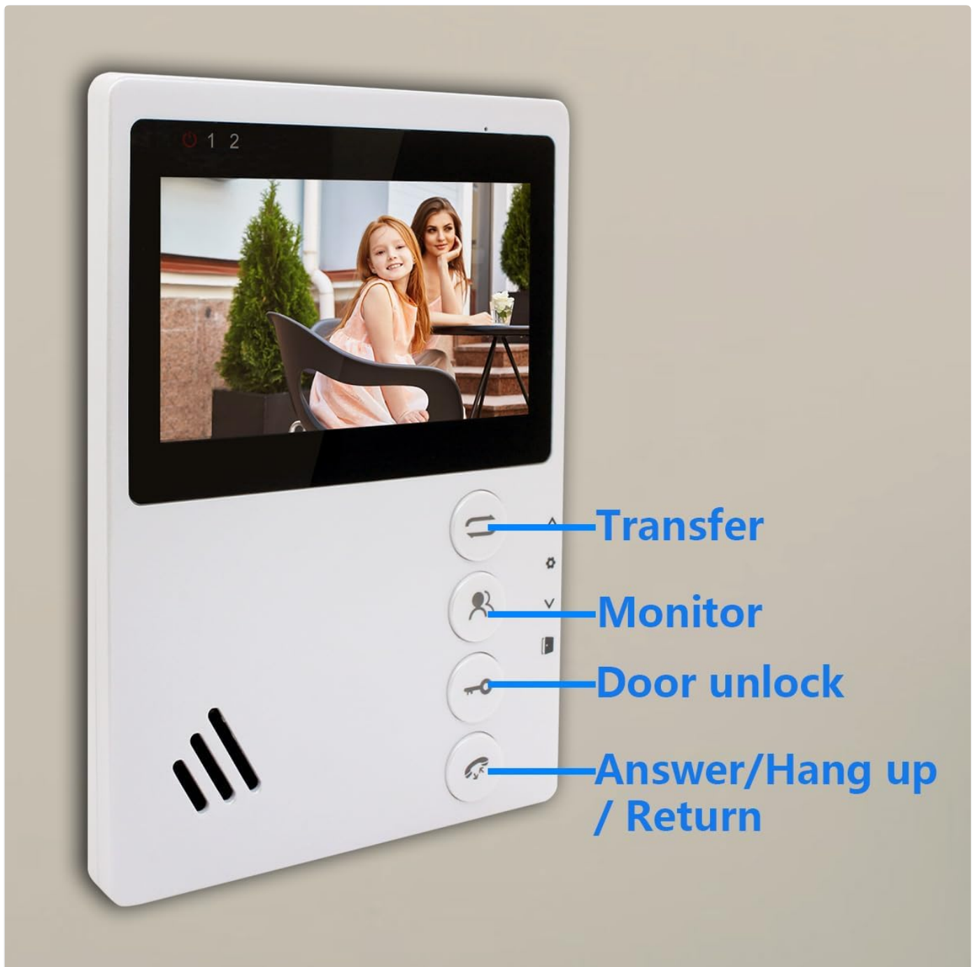
Image: The indoor monitor with labels indicating the functions of its main buttons: Transfer, Monitor, Door Unlock, and Answer/Hang up/Return.