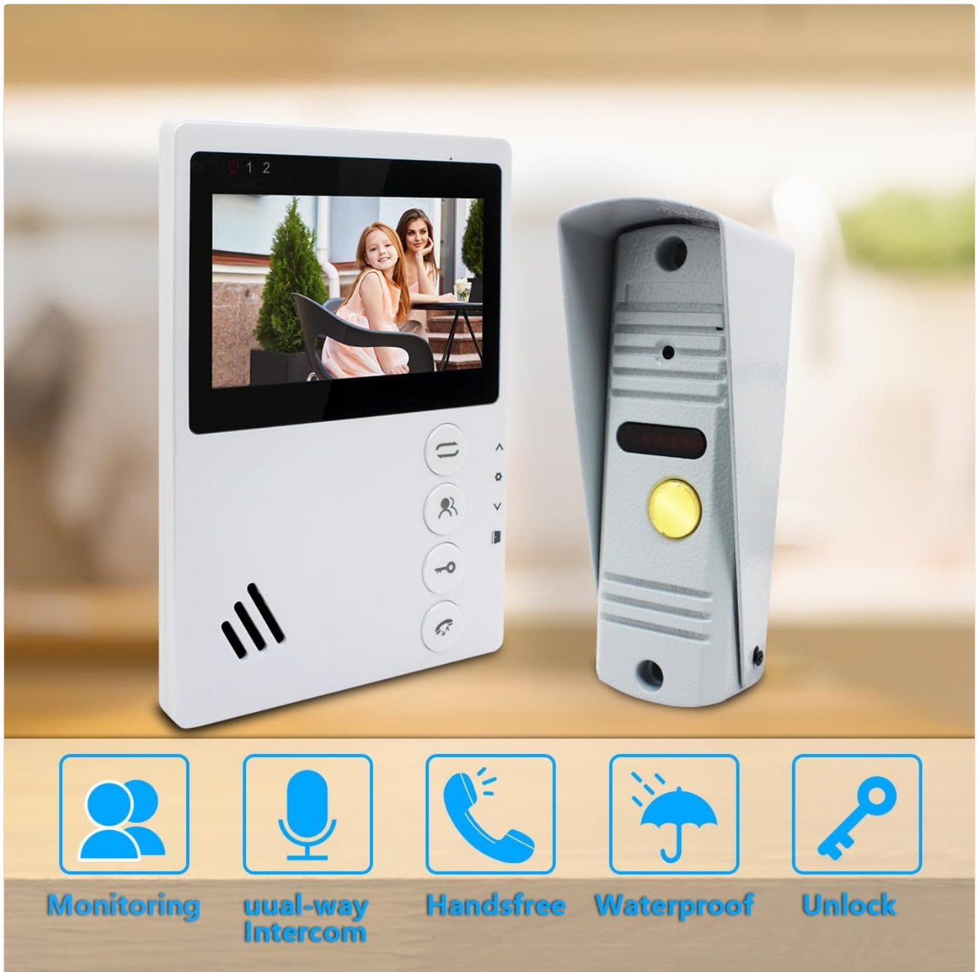
Image: The outdoor doorbell unit, highlighting its compact design and dimensions (120mm height, 40mm width, 25mm depth).