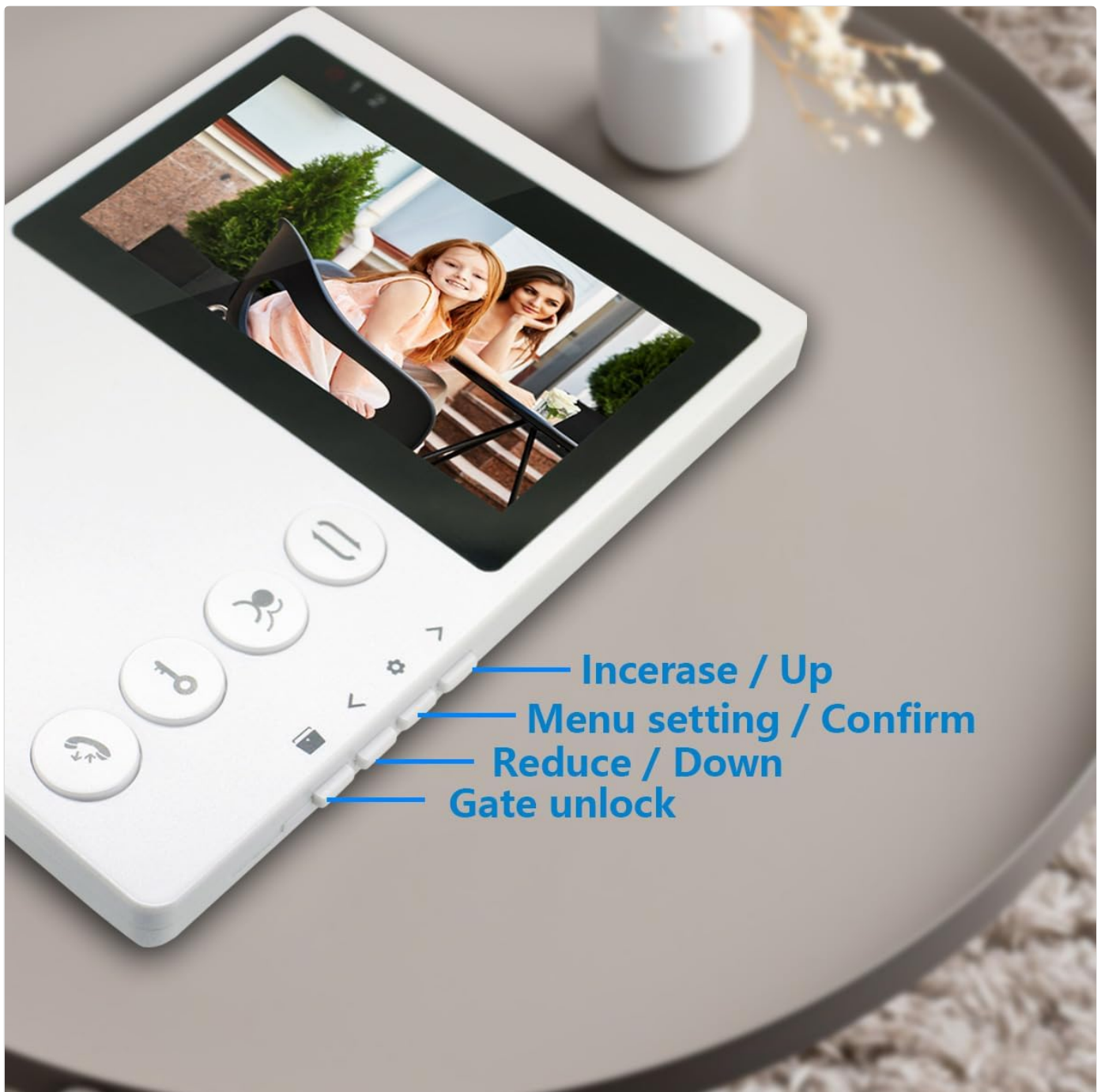
Image: The indoor monitor with labels indicating the functions of its side buttons: Increase/Up, Menu Setting/Confirm, Reduce/Down, and Gate Unlock.