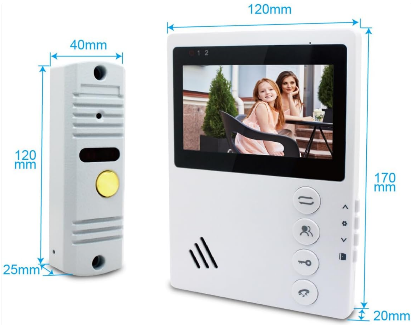
Image: The indoor monitor unit, displaying its dimensions (170mm height, 120mm width, 20mm depth).