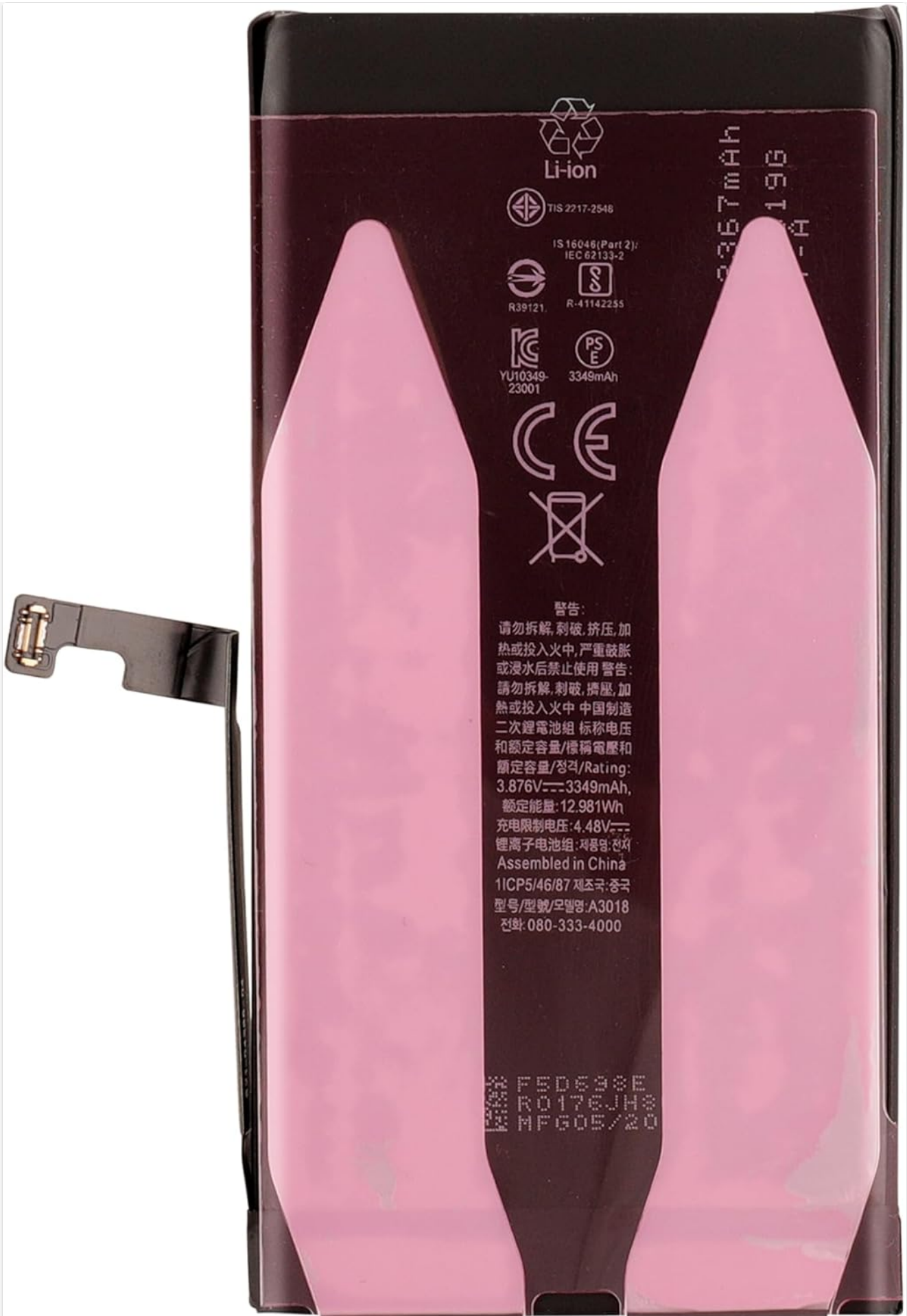
Detailed view of the battery's label, displaying model number and capacity.