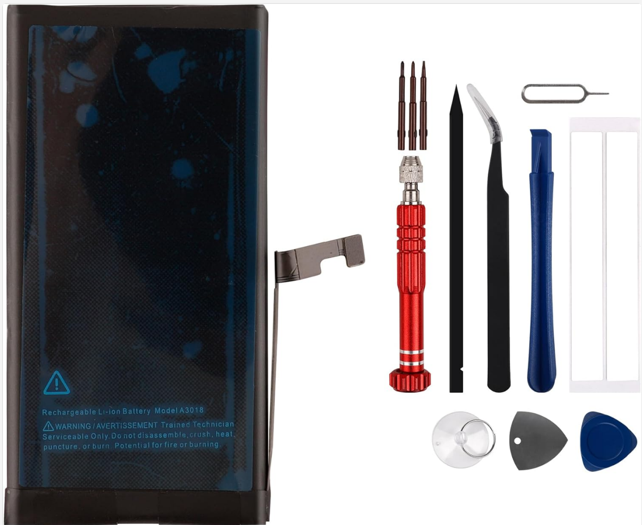
The SWARK A3018 battery alongside the complete set of tools provided for installation.